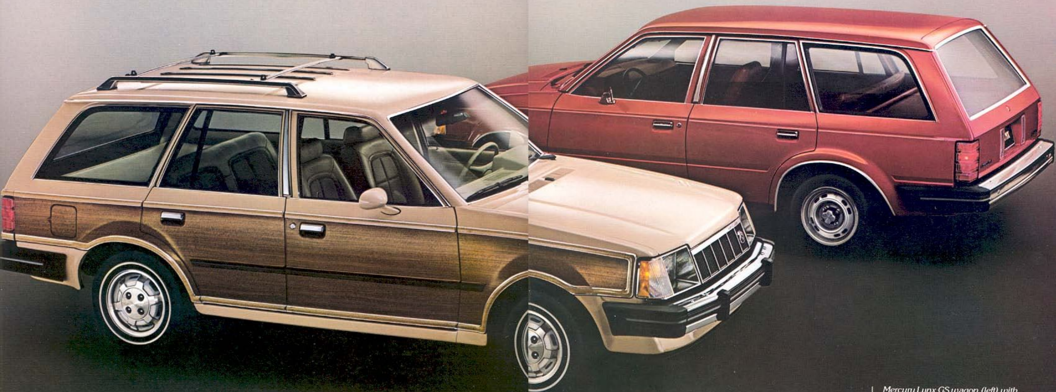
Mercury Lynx GS wagon (left) with Villager Option, shown in Fawn, with optional cast aluminum spoke wheels.

**Excluding other Ford Motor Company products.