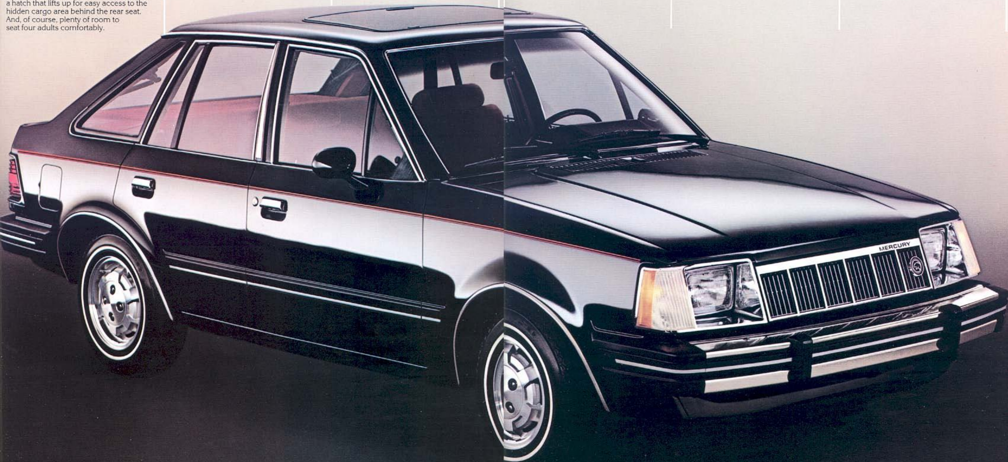
Mercury Lynx LS five-door in Black with optional cast aluminum spoke wheels and flip-up open-air roof.

For 1982, Lynx offers a brand-new five-door hatchback. With four doors for easy entrance and exit of passengers, and a hatch that lifts up for easy access to the hidden cargo area behind the rear seat. And, of course, plenty of room to seat four adults comfortably.