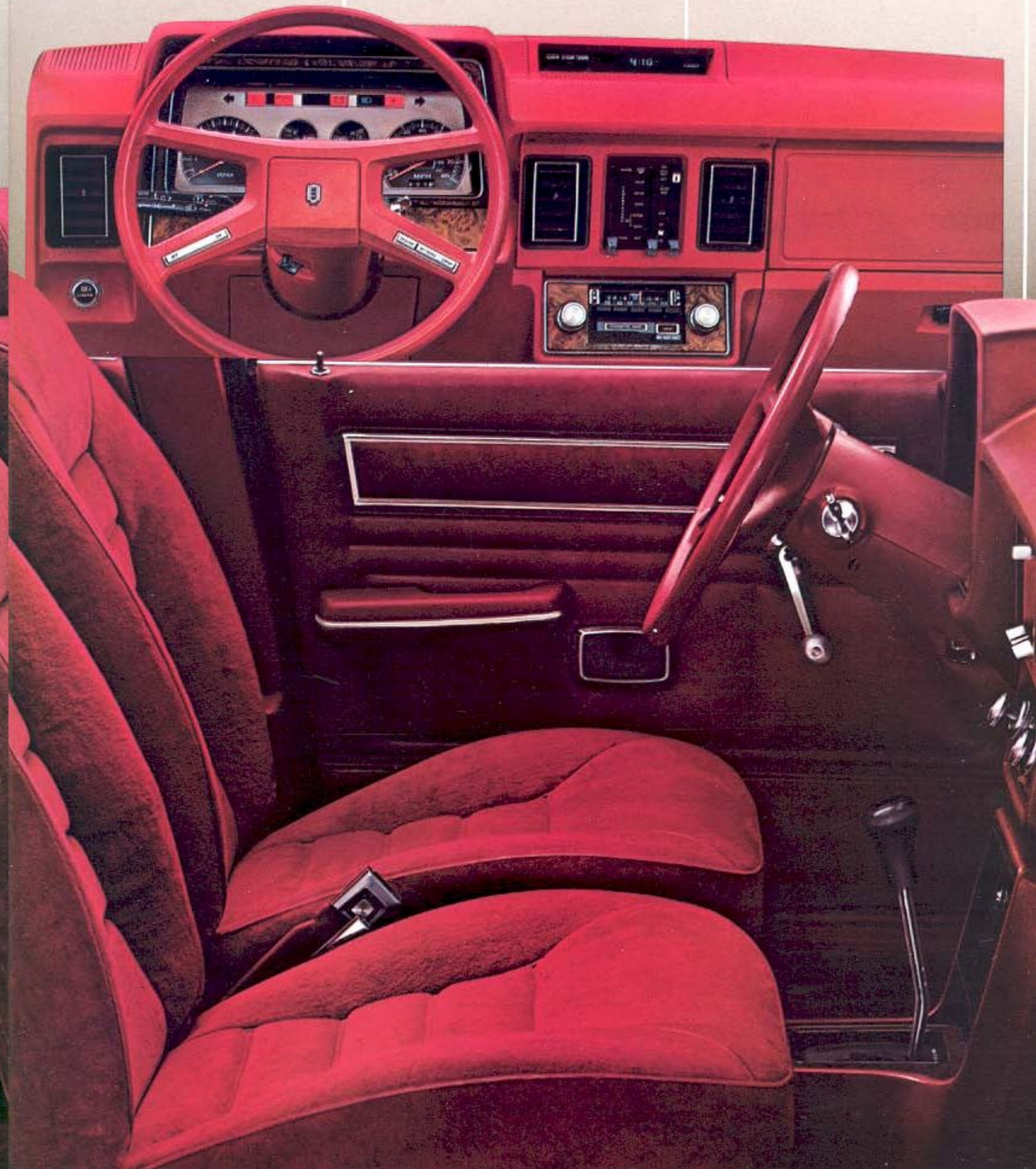
Lynx LS interior with reclining bucket seats in Red velour luxury cloth.