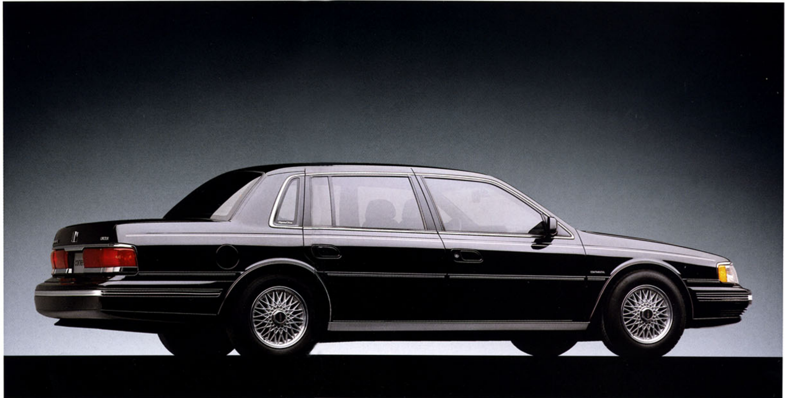
Lincoln Continental Signature Series in Midnight Black Clearcoat.