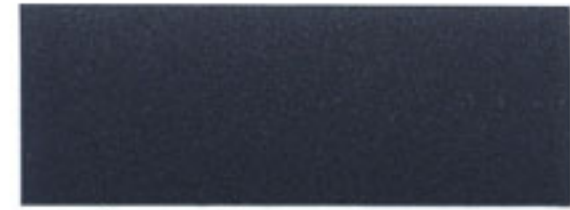
Amethyst Pearlescent Clearcoat Metallic KB Mark VII, Town Car, Continental