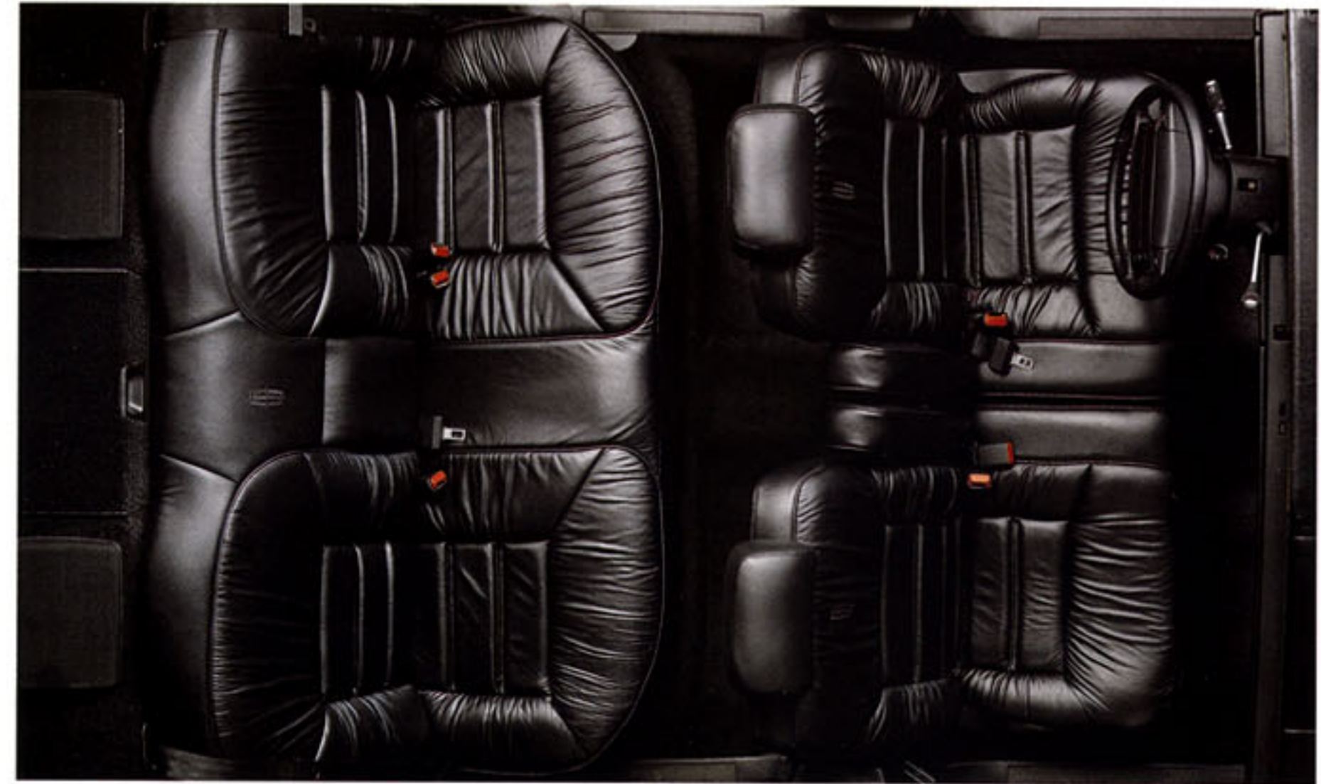
Lincoln Continental Signature Series interior with Ebony leather seating surfaces.

Choose from Continental Executive or Signature Series for 1991. Each is distinctive. Each offers features that make Continental stand apart in a world of luxury automobiles. And, like all Lincolns, each embodies an unyielding commitment to the highest standards of quality and customer satisfaction.