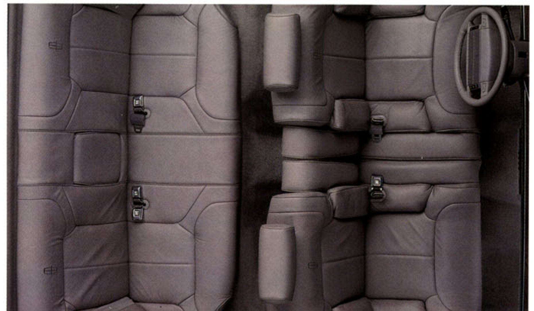
Town Car Signature Series interior with optional Light Titanium leather seating surfaces.

Three models are available for 1991. The luxurious Executive Series, the elegant Signature Series and the richly appointed Cartier Series. Each offers a classic style of luxury that is unmistakably Town Car. And each embodies Lincoln's unyielding commitment to the highest standards of quality and customer satisfaction.