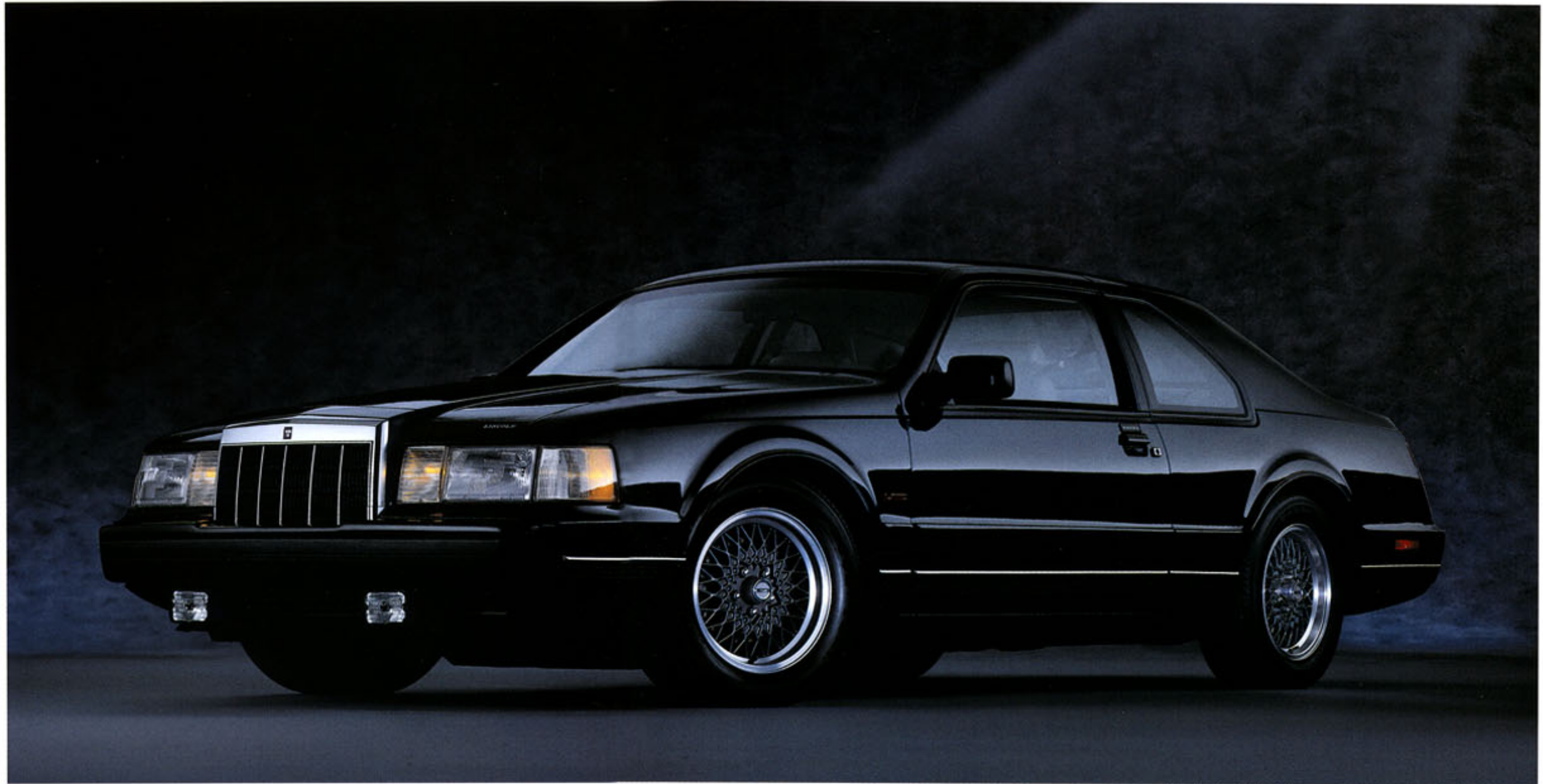
Lincoln Mark VII LSC in monochromatic Midnight Black Clearcoat.

A SOPHISTICATED BLEND OF POWER AND GRACE.