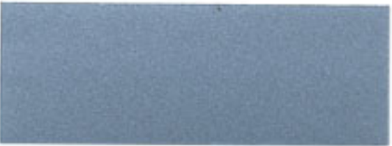
Crystal Blue Pearlescent Clearcoat Metallic MD Mark VII, Town Car, Continental