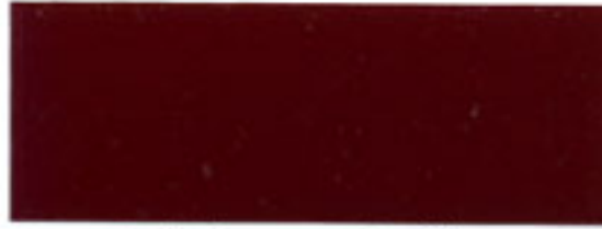
Garnet Red Clearcoat Metallic EG Mark VII, Continental