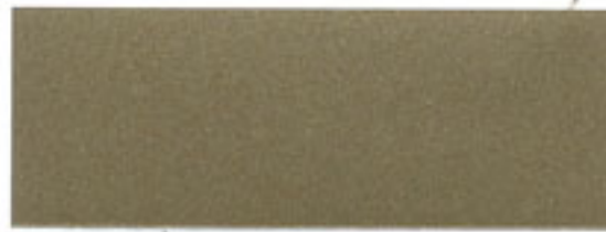
Champagne Pearlescent Clearcoat Metallic AD Town Car