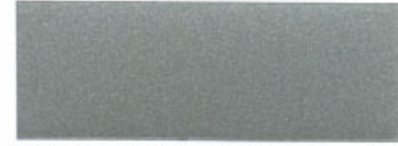
Titanium Pearlescent Clearcoat Metallic YX Mark VII, Town Car, Continental