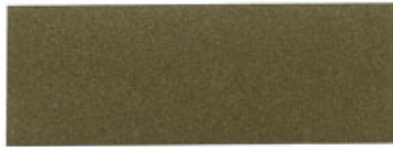
Aztec Gold Clearcoat Metallic AC Town Car