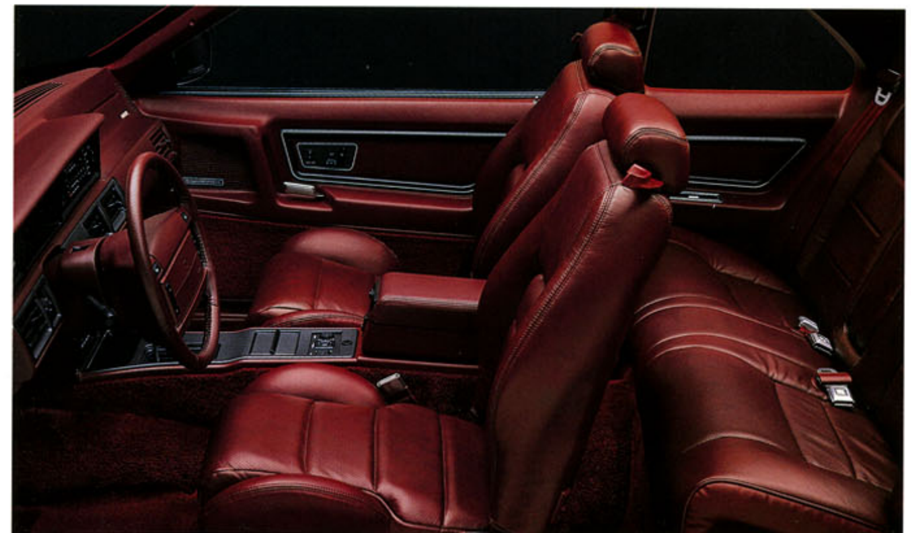
Lincoln Mark VII LSC interior with Cranberry leather seating surfaces.

Mark VII is available in LSC and Bill Blass models for 1991. Each includes Lincoln's unyielding commitment to the highest standards of quality and customer satisfaction. And each presents a unique interpretation of a truly American personal luxury coupe.