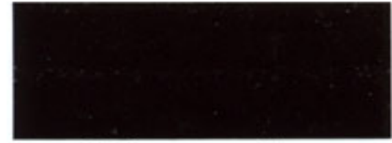
Burgundy Clearcoat Metallic ER Mark VII, Town Car, Continental