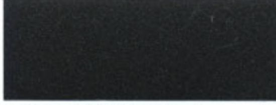
Graphite Clearcoat Metallic YG Mark VII, Town Car, Continental