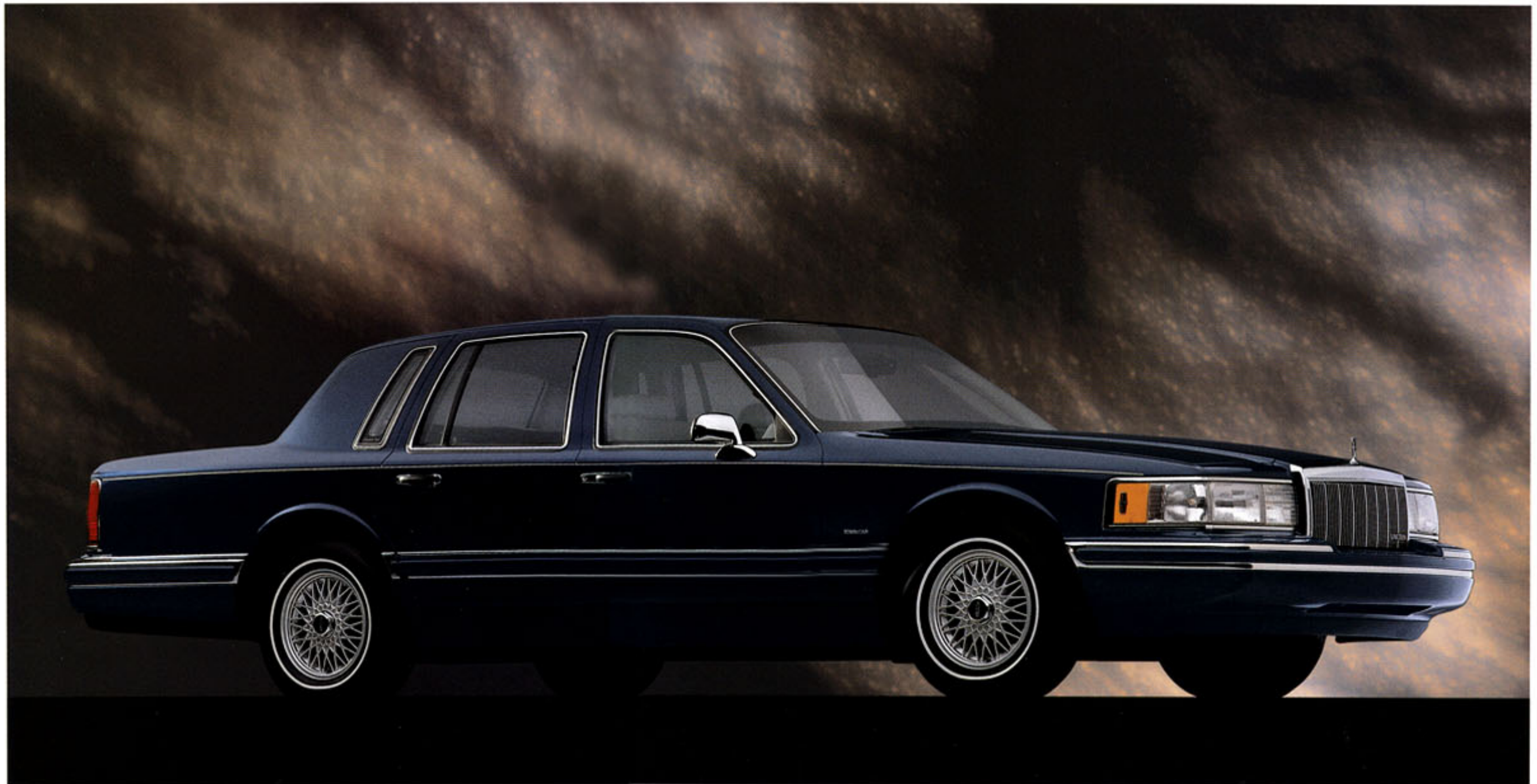
Lincoln Town Car Signature Series in Twilight Blue Clearcoat Metallic.

It's unmistakable. The Lincoln Town Car for 1991 is without doubt the standard for those who measure luxury on a large scale.