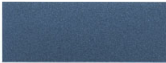
Regatta Blue Clearcoat Metallic ME Mark VII, Town Car