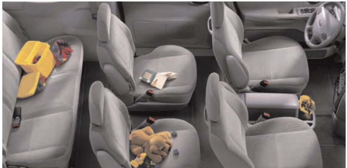
Windstar SE cloth interior, shown in Medium Graphite, featuring quad bucket seats and the optional AutoVision® Video Entertainment System.

Windstar's available dual power sliding doors give families a couple convenient ways to get in and out of any situation (a). Available power mirrors with integrated safety signals alert traffic behind when sliding doors are open. So, even when your kids aren't watching out, Windstar is (b). Also available, a soft light that emanates from the floor...not into a sleeping baby's face (c). Every Windstar also comes with built-in "LATCH" child safety seat lower tether anchors to better secure your precious cargo (d), and at the push of a button, Windstar Limited remembers the placement for the power seat, pedals and mirror settings for two drivers and resets them accordingly (e). The optional remote keyless entry system is as handy as it gets. Hands full? Push the button and the power sliding doors will automatically open or close (f).