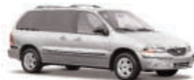
WINDSTAR SE IN VIBRANT WHITE