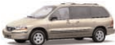
WINDSTAR SE IN LIGHT PARCHMENT GOLD