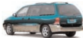
WINDSTAR SEL IN AMAZON GREEN