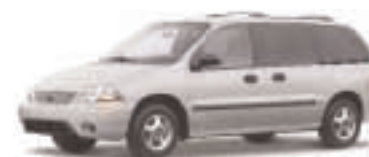
WINDSTAR LX DELUXE IN SILVER FROST