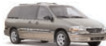
WINDSTAR SEL IN SPRUCE GREEN