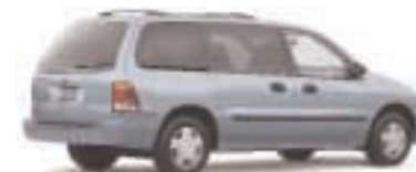
WINDSTAR LX IN LIGHT SAPPHIRE BLUE