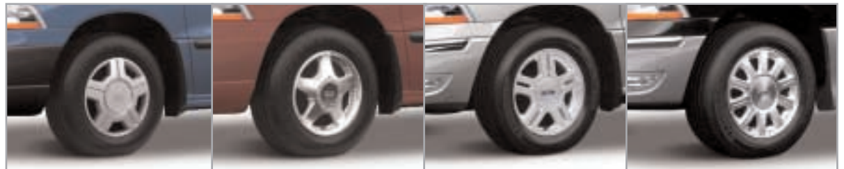
15" Steel Wheel with cover standard on LX Base and LX Standard

Flexible interior space has long been the hallmark of Windstar's success. Sometimes you need all the room just for people. A few minutes later, you need all the room for cargo. Knowing this, Windstar offers seats that flip and fold or come out as easily as they go in. It's not magic. It's just smart.