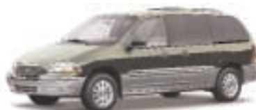
WINDSTAR LIMITED IN ESTATE GREEN

Windstar features Clearcoat paint for beauty and protection. Colors shown are representative only. See your dealer for actual paint/trim choices. Vehicles shown may contain optional equipment.