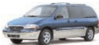
WINDSTAR SEL IN TRUE BLUE