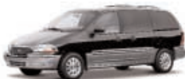
WINDSTAR LIMITED IN BLACK