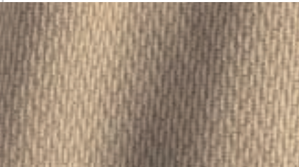
Medium Parchment Cloth