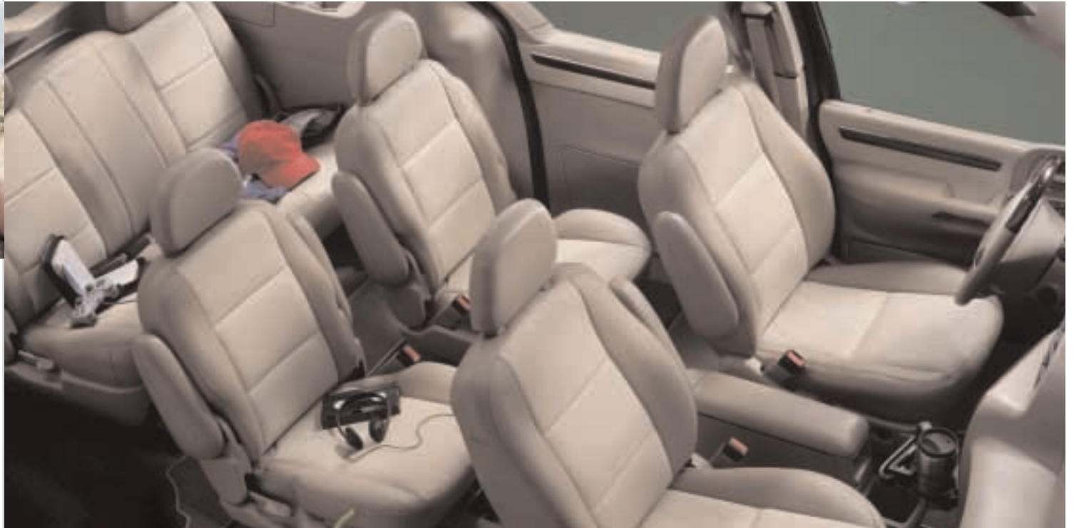
Windstar Limited interior, shown in Medium Parchment, with AutoVision® Video Entertainment System.

INSIDE EVERY WINDSTAR YOU'LL HEAR THINGS LIKE, "HEY...HOW'D THEY THINK OF THAT?" AND "THAT'S REALLY COOL."