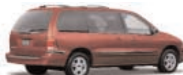
WINDSTAR SE IN MATADOR RED