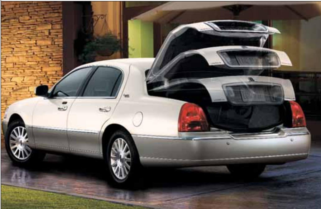
Town Car Signature Limited in Ceramic White Pearllescent Tri-Coat with Light French Silk Metallic accent.