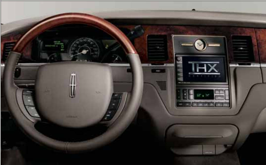
Town Car Signature Limited with the Lincoln Soundmark THX-Certified Car Audio/Navigation System.