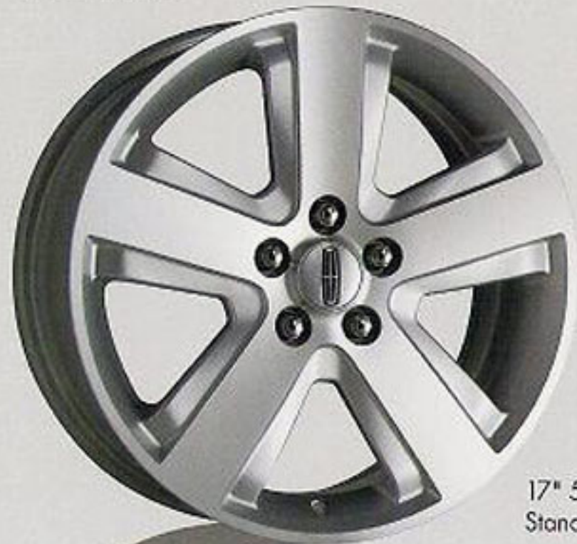
17" 5-spoke machined-aluminum Standard