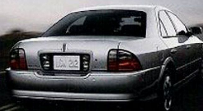
Lincoln LS in Black (top) and Silver Birch Metallic (bottom) with available equipment.