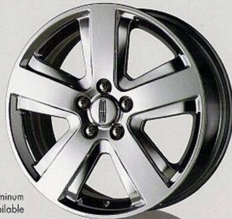
17" 5-spoke chrome-aluminum Available