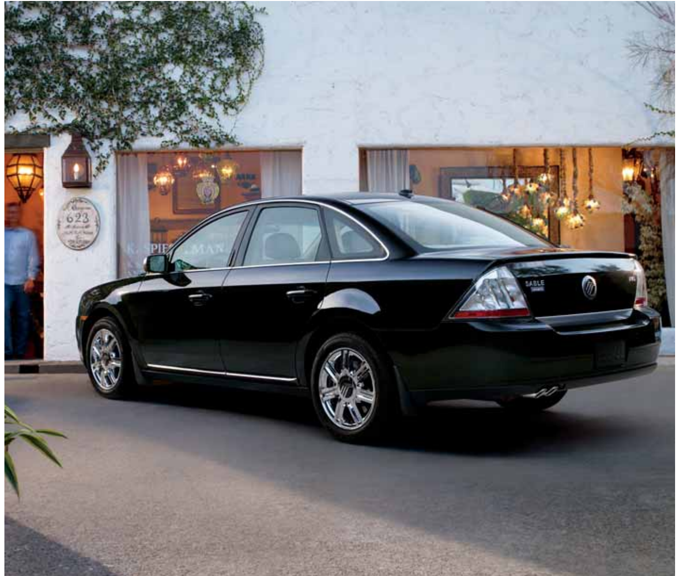
SABLE PREMIER IN TUXEDO BLACK METALLIC WITH AVAILABLE EQUIPMENT.