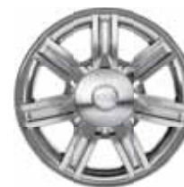
18" 7-SPOKE CHROME-CLAD ALUMINUM AVAILABLE WITH VOGA PACKAGE

Mercury uses clearcoat paint for beauty and protection. All exterior paints are Metallic except for White Suede. Colors are representative only.