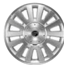
17" 7-SPOKE BRIGHT-ALUMINUM STANDARD ON SABLE

Garmin is a registered trademark of Garmin Ltd.