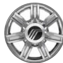
18" 7-SPOKE CHROME-CLAD ALUMINUM AVAILABLE ON PREMIER