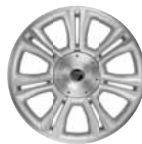
18" 7-SPOKE BRIGHT-ALUMINUM STANDARD ON PREMIER