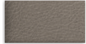
3 Medium Light Stone Leather