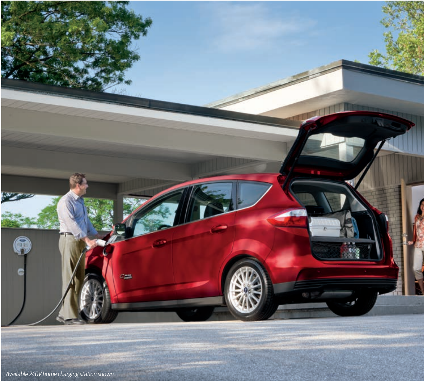
Available 240V home charging station shown.