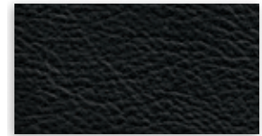
4 Charcoal Black Leather