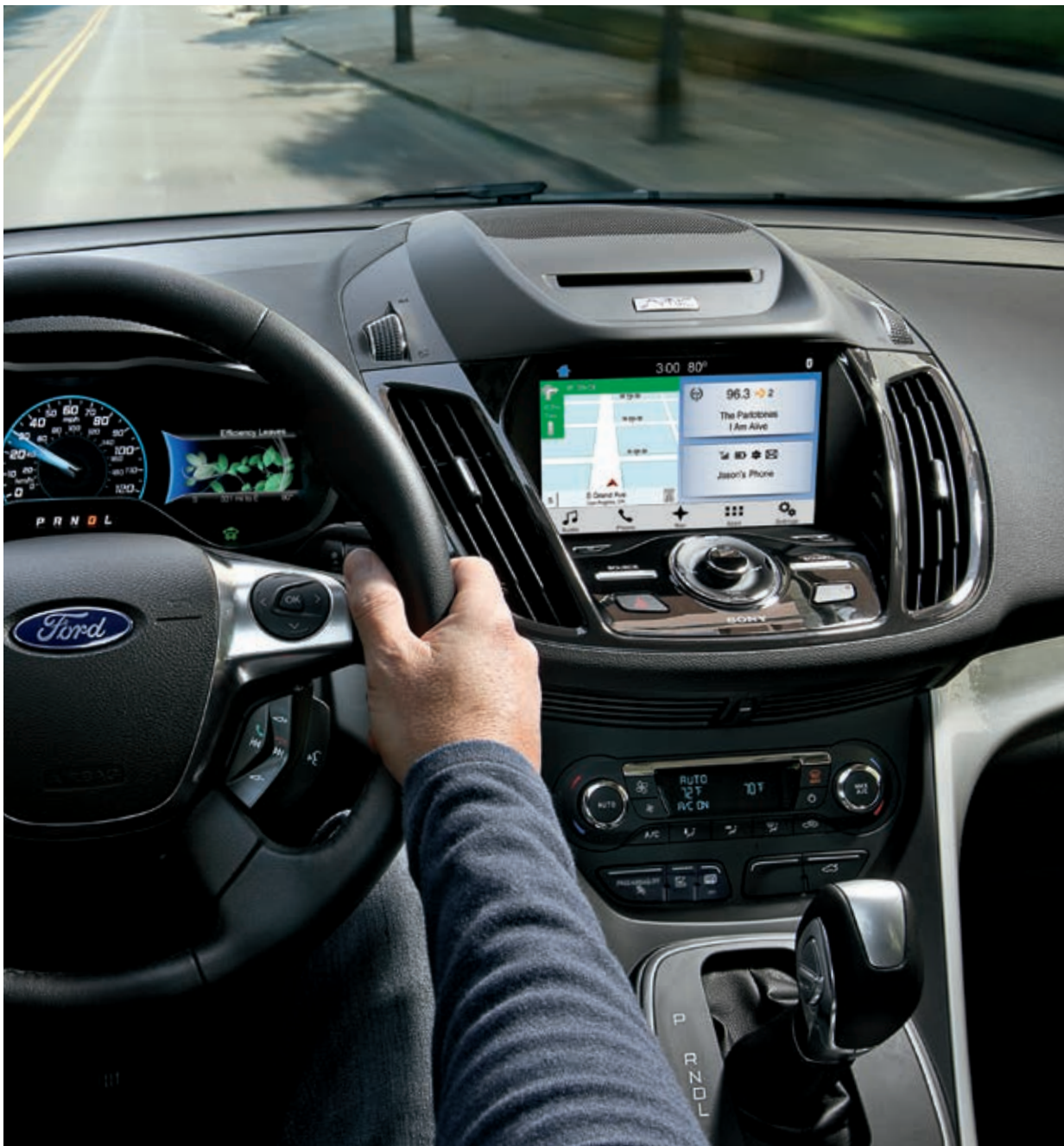
C-MAX Hybrid SEL. Charcoal Black leather trim. SYNC 3. Available equipment.