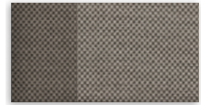
1 Medium Light Stone Cloth with Medium Dark Stone Accents