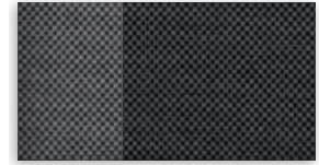
2 Charcoal Black Cloth with Warm Steel Accents