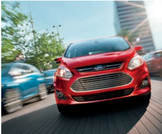
Ruby Red Metallic Tinted Clearcoat. Available equipment.