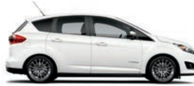
White Platinum Metallic Tri-coat