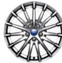
17" Sparkle Silver-Painted Aluminum Standard