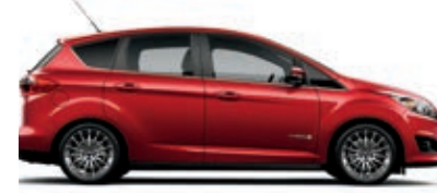
Ruby Red Metallic Tinted Clearcoat