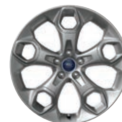
19" Premium Luster Nickel-Painted Aluminum Optional