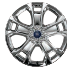
18" Chrome Alloy Finish Available: SE