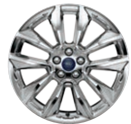
19" Chrome-Like Alloy Finish Included: Chrome Package on SE