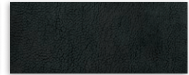
6 Charcoal Black Leather