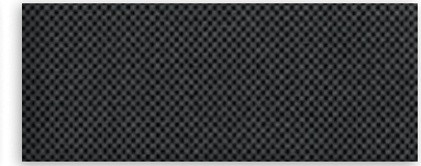
2 Charcoal Black Cloth