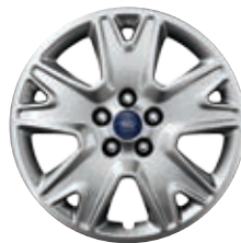
17" Steel with Sparkle Silver-Painted Wheel Covers Standard: S