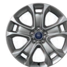
18" Sparkle Nickel-Painted Aluminum Standard

High-intensity discharge (HID) headlamps!*