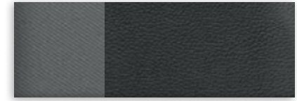
8 Charcoal Black Leather with Smoke Storm Cloth Accents