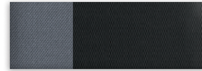
5 Charcoal Black Cloth with Anthracite Accents