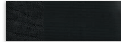
1 Charcoal Black Cloth with Charcoal Black Inserts