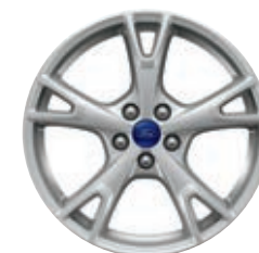
18" Premium Painted Aluminum Included: Titanium 18" Wheel Package