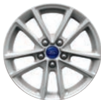
16" Painted Aluminum Standard: SE