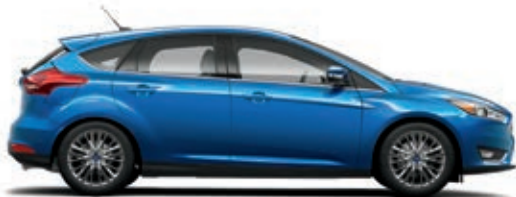
Blue Candy Metallic Tinted Clearcoat