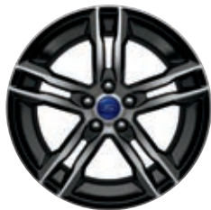
18" Premium Rado Gray-Painted Aluminum Standard