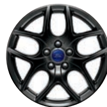
17" Gloss Black-Painted Aluminum Available: SE EcoBoost Appearance Package Included: SE Luxury Package