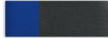
7 Charcoal Black Leather with Performance Blue Cloth Accents