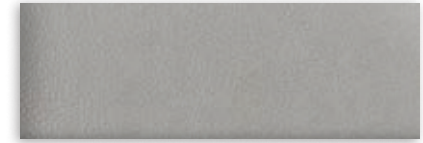
4 Medium Soft Ceramic Leather with Medium Soft Ceramic Inserts