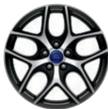
17" Machined Aluminum with Black-Painted Pockets Included: SE Sport Package