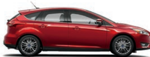
Ruby Red Metallic Tinted Clearcoat