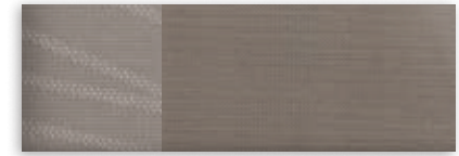
2 Medium Light Stone Cloth with Medium Light Stone Inserts