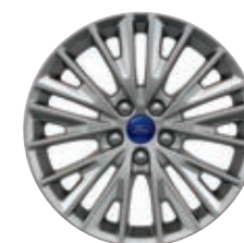
17" Sport Painted Aluminum Standard

Dual-zone electronic automatic temperature control.