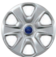
15" Steel with Silver-Painted Covers Standard: S

SiriusXM Satellite Radio with 6-month trial subscription (included on 201A)