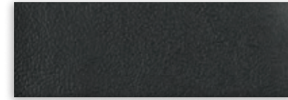
3 Charcoal Black Leather with Charcoal Black Inserts