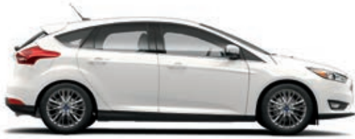
White Platinum Metallic Tri-coat