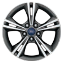
16" Machined Aluminum with Dark-Painted Pockets Included: SE EcoBoost Appearance Package