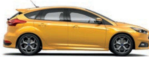
Tangerine Scream Metallic Tri-coat