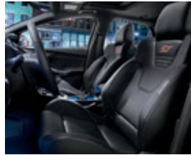
Charcoal Black leather trim. ST3 Package with RECARO front seats and heated, flat-bottom steering wheel. Available equipment.