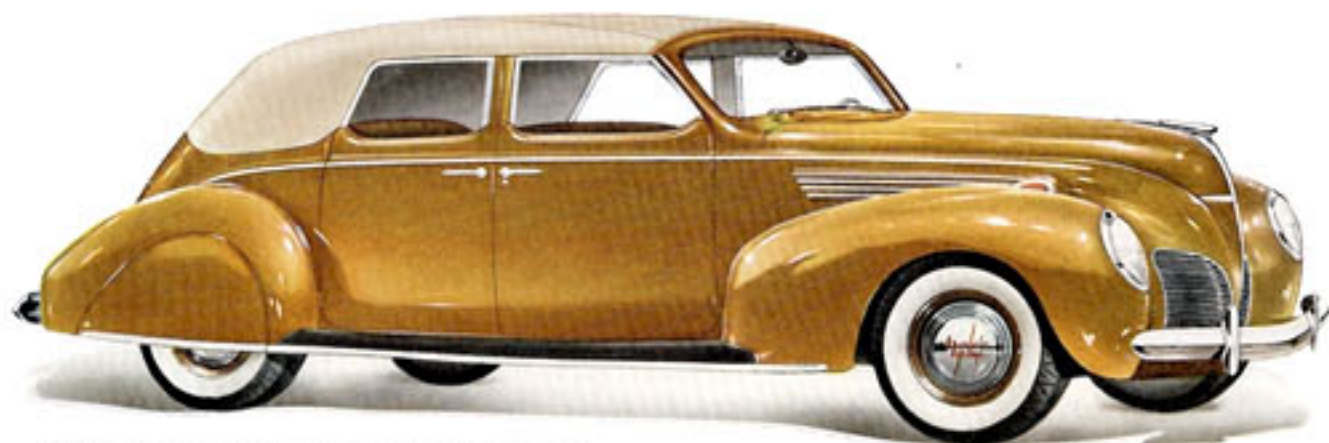
THE CONVERTIBLE SEDAN