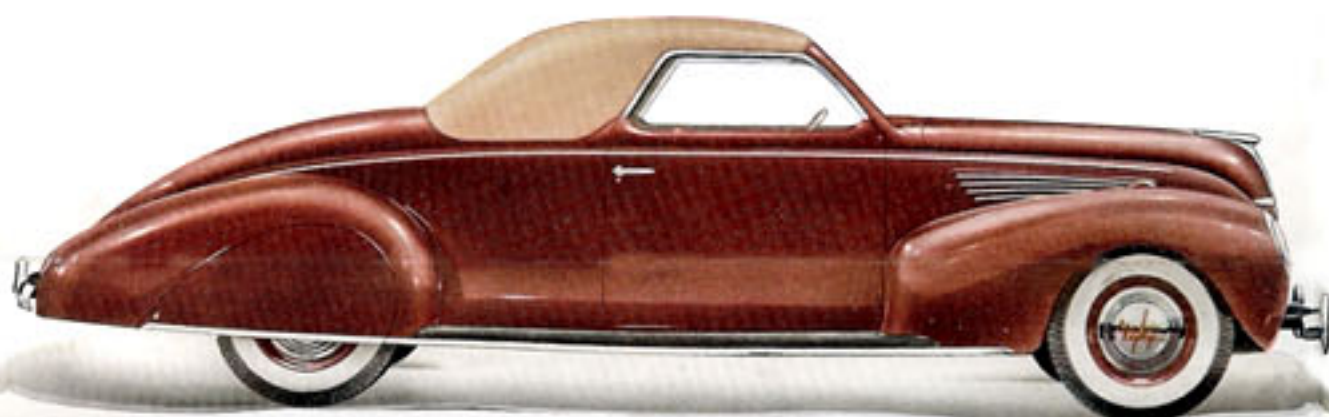
THE CONVERTIBLE COUPE