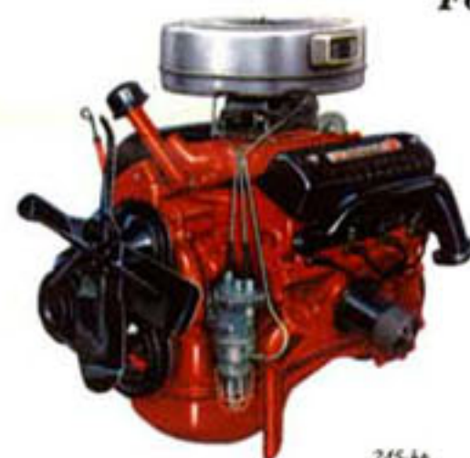
245-hp THUNDERBIRD 312 Special V-8

Ford celebrates twenty-five years of V-8 leadership with the widest engine choice ever! Both Custom Series offer the basic 190-hp Ford 272 V-8 . . . Fairlanes and Station Wagon Series, the 212-hp Thunderbird 292 V-8. All Series offer the optional 245-hp Thunderbird 312 Special V-8. Also available in every