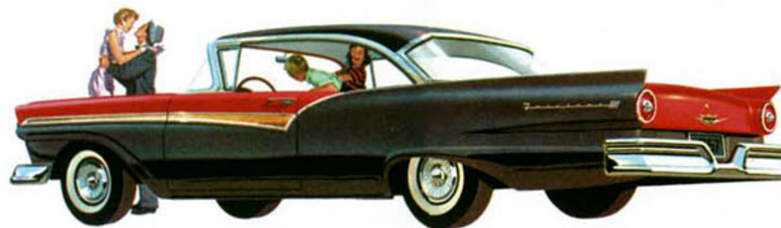
FAIRLANE 500 CLUB VICTORIA A new thin-line roof design with extra support means greater strength in this two-door hardtop. The visor-like roof extension gives extra rear-seat head room.