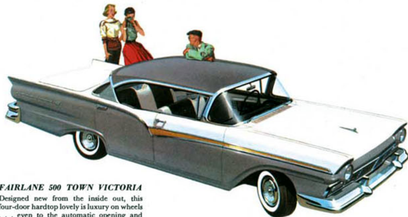
FAIRLANE 500 TOWN VICTORIA Designed new from the inside out, this four-door hardtop lovely is luxury on wheels . . . even to the automatic opening and closing assist feature of the rear doors.

Take a good long look! On these pages you see a completely new kind of Ford for '57 . . . the Fairlane 500 Series. It's a car so big, so daringly styled, you'll hardly believe it's in the low-price field. Each model is over 17 feet long, and only a scant 4½ feet high! A durable enamel keeps all '57 Fords beautiful longer. A chrome body molding with gold anodized panel and Sunburst wheel covers are standard on each Fairlane 500. As for performance, you have a choice of the most powerful engines in Ford's field—mighty Thunderbird V-8's or the famous Mileage Maker Six. Once you drive a Fairlane 500, you'll understand why Ford goes first with families who can afford to pay almost any price for a car.