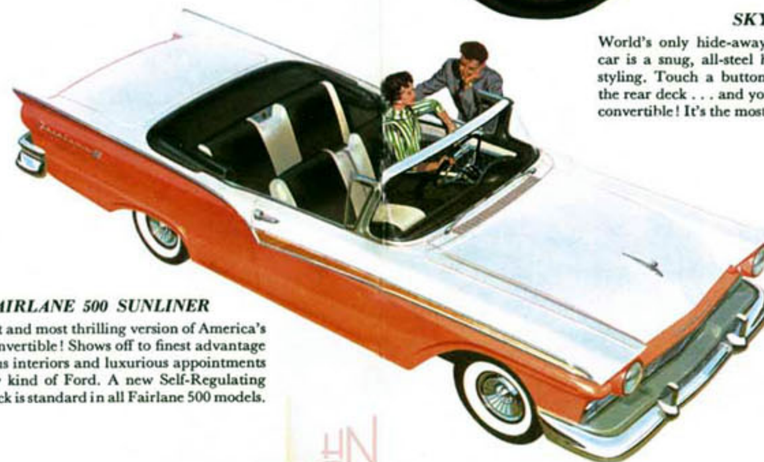
FAIRLANE 500 SUNLINER

World's only hide-away hardtop! One minute this car is a snug, all-steel hardtop with smart Victoria styling. Touch a button and the roof vanishes into the rear deck . . . and you're sitting pretty in an open convertible! It's the most exciting car in a generation!