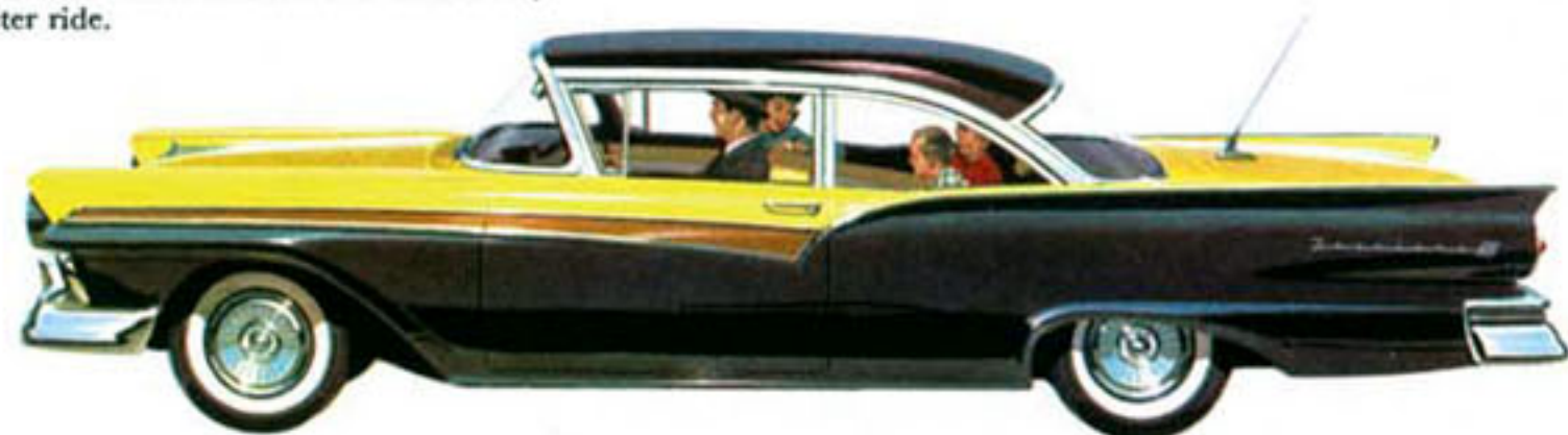
FAIRLANE 500 CLUB SEDAN Here's a two-door sedan, with the open look of a "hardtop." Windshield wraps around farther than ever.