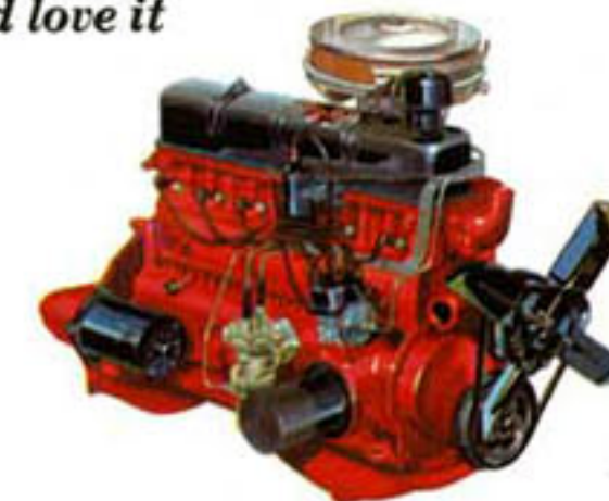
144-hp MILEAGE MAKER SIX

Series, is the special 300-hp Thunderbird 312 Supercharged V-8. Or in any '57 Ford (except Skyliner and Thunderbird) you can have the industry's most powerful, most modern Six, the economical 144-hp Mileage Maker Six. Fordomatic, Overdrive or Conventional transmission is available with any engine.