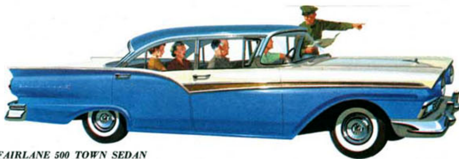
FAIRLANE 500 TOWN SEDAN You'll love its thrillingly low silhouette with dramatic "hardtop" styling. As in all Fords, Silent-Grip body mounts soak up sound and road shock for a smoother, quieter ride.

The newest and most thrilling version of America's favorite convertible! Shows off to finest advantage the spacious interiors and luxurious appointments in the new kind of Ford. A new Self-Regulating electric clock is standard in all Fairlane 500 models.