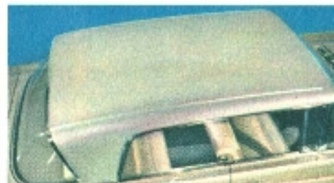
The other two fine cars

for that Imperial touch of distinguished identity . . .