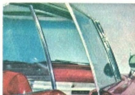
Curved side windows—exclusive!