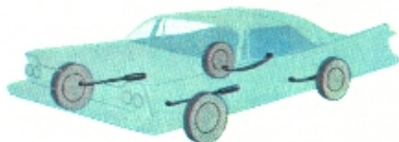
Conventional Coil-Spring Suspension