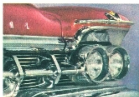
Headlight grouping—deeply sculptured!

for that Imperial look of assured originality . . .