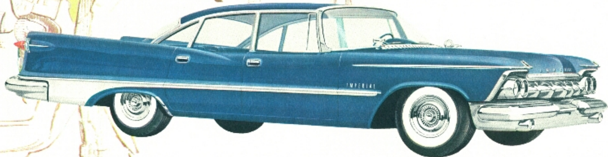
Imperial Custom Four-door Sedan