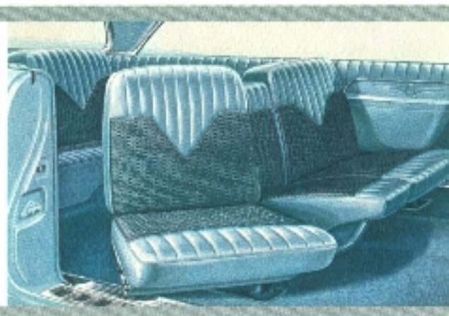
In the fine-car field, only Imperial offers you swivel seats!

Here is just the kind of extra consideration that you'd expect from Imperial—the car that, more than any other, is designed with driver and passengers in mind.