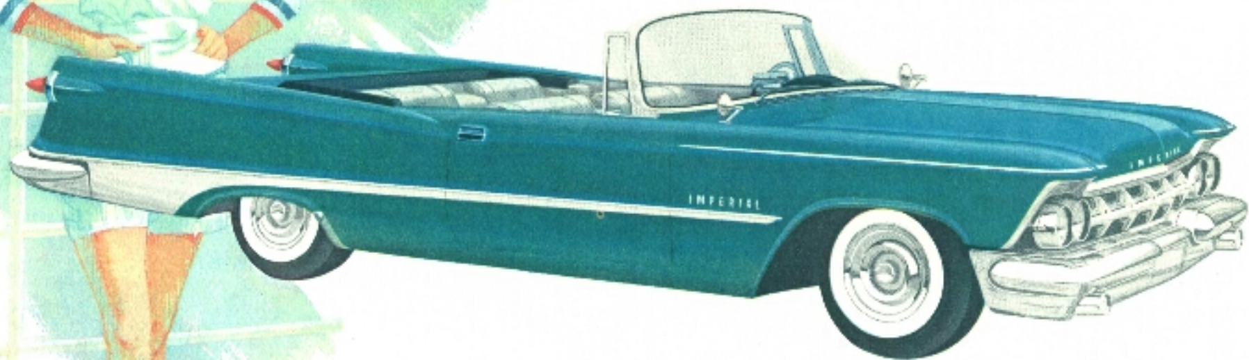
Imperial Crown Convertible