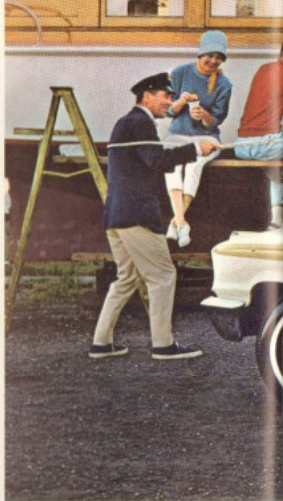
Above: 9-Passenger Country Squire with optional wagon roof rack (also offered in 6-passenger model)