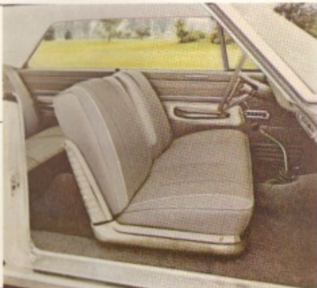
Foreground: Galaxie 500 2-Door Hardtop Background: Galaxie 500 4-Door Hardtop