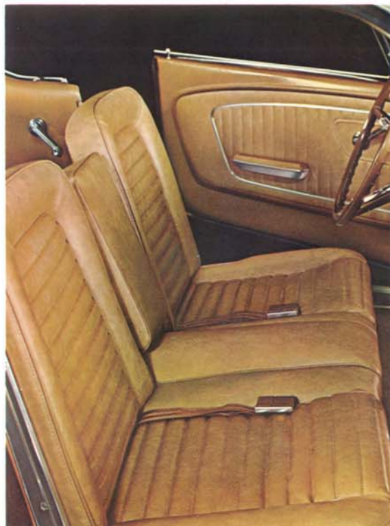
Full-Width Seat (Hardtop, Convertible)

†Replaces side air scoop ornament; rocker panel moldings standard on Fastback