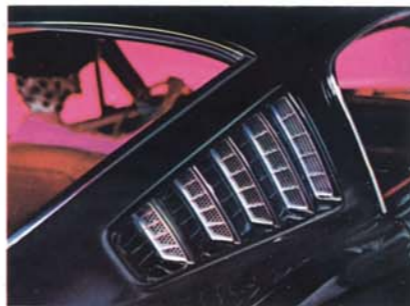
2+2's Silent-Flo Ventilation louvers

< Fastback 2+2: imported looks at a low Ford price