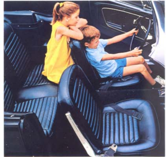
Six all-vinyl trim choices with the look and feel of leather

For sports Mustang: Convertible plus sports options in next six pages