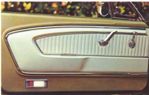
Door panels have integral arm rests, safety-courtesy lights