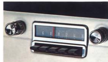
Push-Button AM Radio