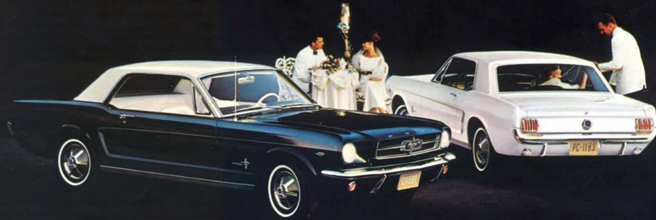
Mustang options make a luxurious personal car (right) of Mustang Hardtop (far right)