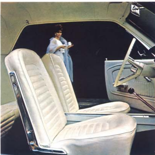
Mustang's individually adjustable, deep-foam bucket seats