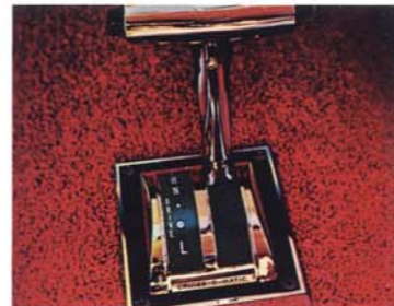
T-bar Cruise-O-Matic Drive