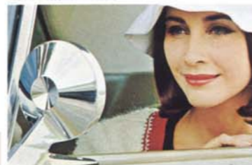
Remote-Control Outside Mirror