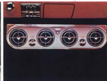
Ford Air Conditioner