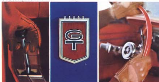
4-Speed Stick Shift†