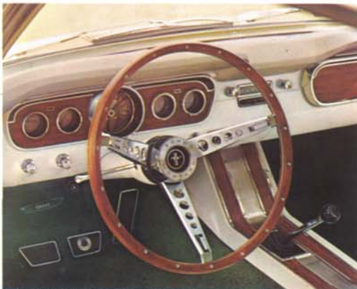
Steering wheel, instrument panel have rich, woodlike finish

*Optional †Available also as separate option