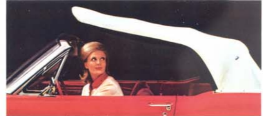
Power top is one of over 70 options