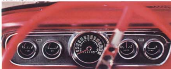
GT Instrument Cluster