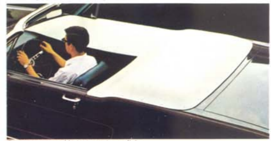
Tonneau cover adds true sports-car flair