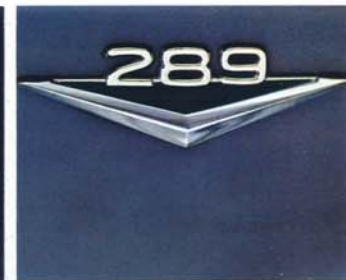
Three sports-blooded V-8's