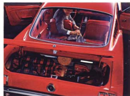
Folding rear seat triples luggage space