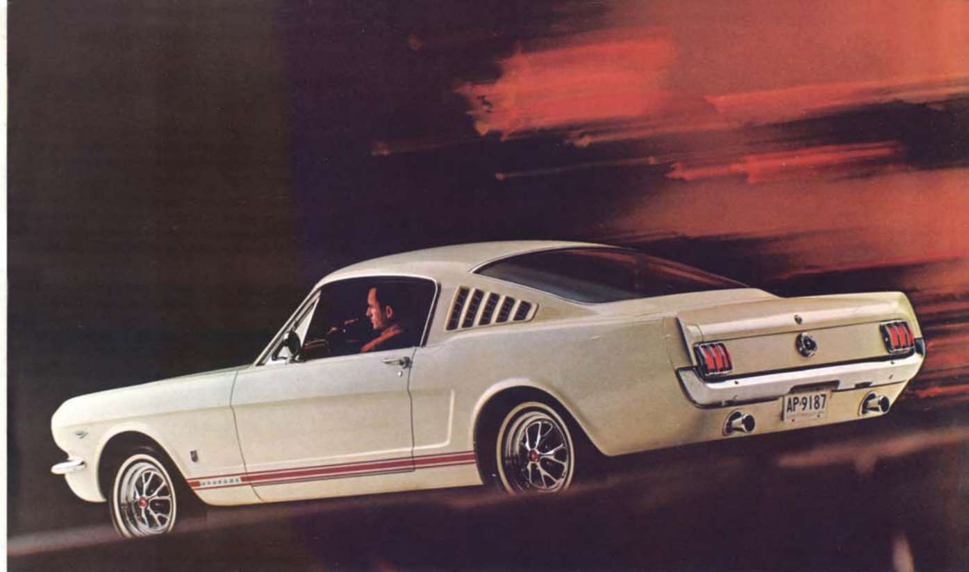
271-hp Challenger High Performance V-8†