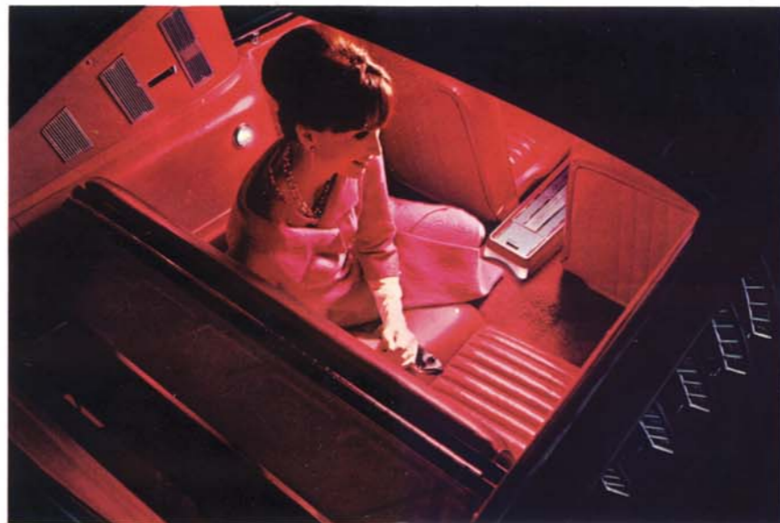
Rear seat luxury in the 2+2