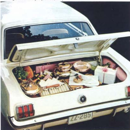
Trunk is surprisingly spacious, easy to load