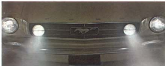
4-Inch Fog Lamps

†Separate option, not included in GT Group