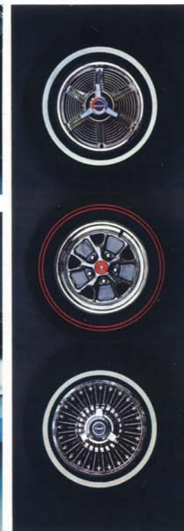
Deluxe Wheels and Wheel Covers