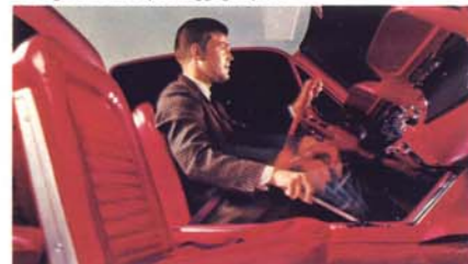
2+2 cockpit: where spirited looks come alive!

< Fastback 2+2: imported looks at a low Ford price