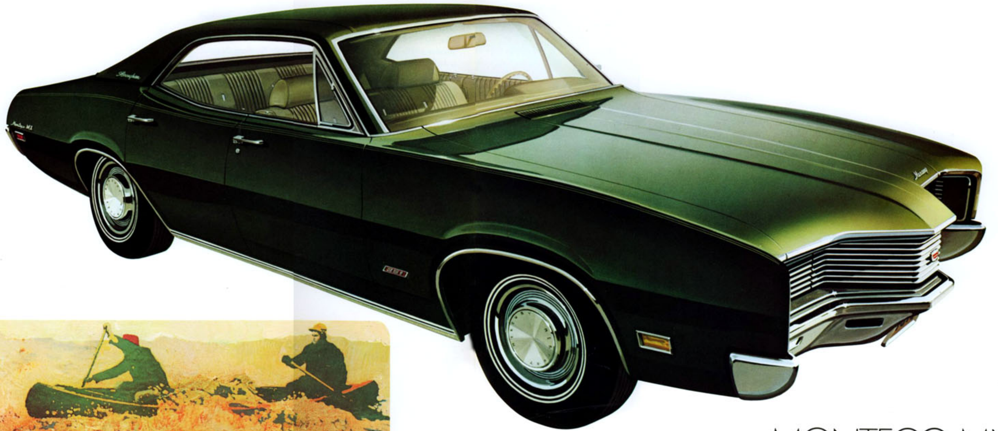
Montego MX Brougham 4-door hardtop with optional vinyl roof