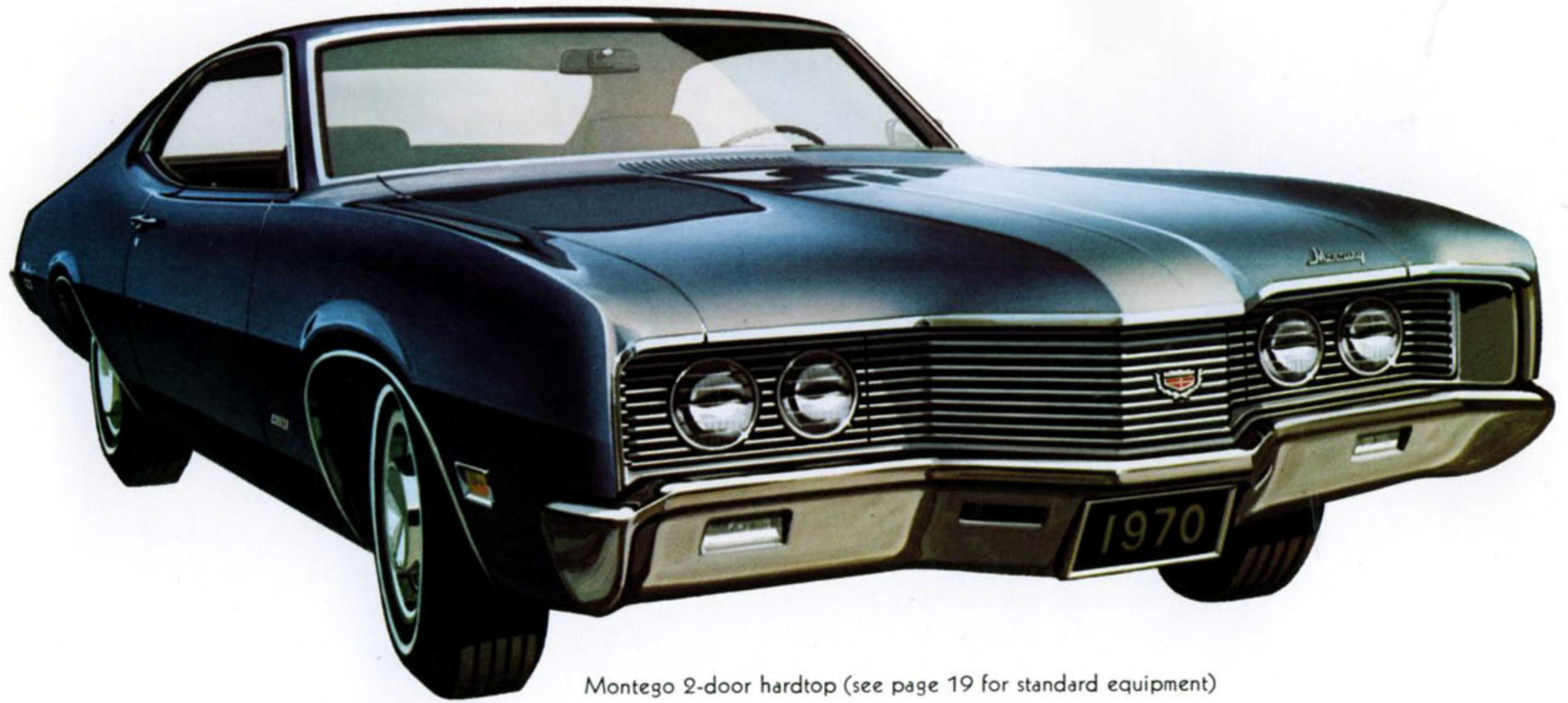
Montego 2-door hardtop (see page 19 for standard equipment)