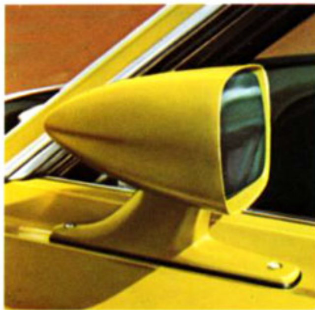
Remote-control racing mirror