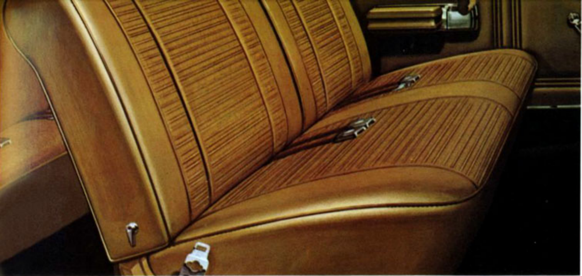
Cyclone standard all-vinyl interior