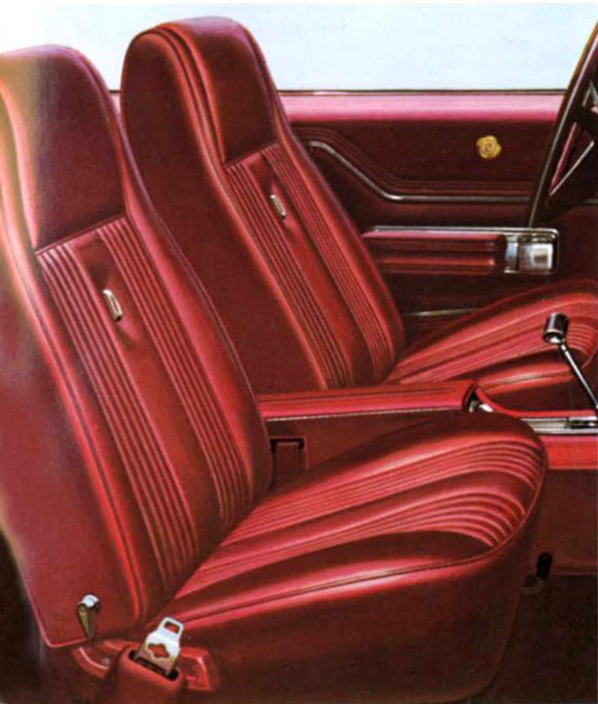
Hi-back buckets. Standard for GT and Spoiler, optional Cyclone