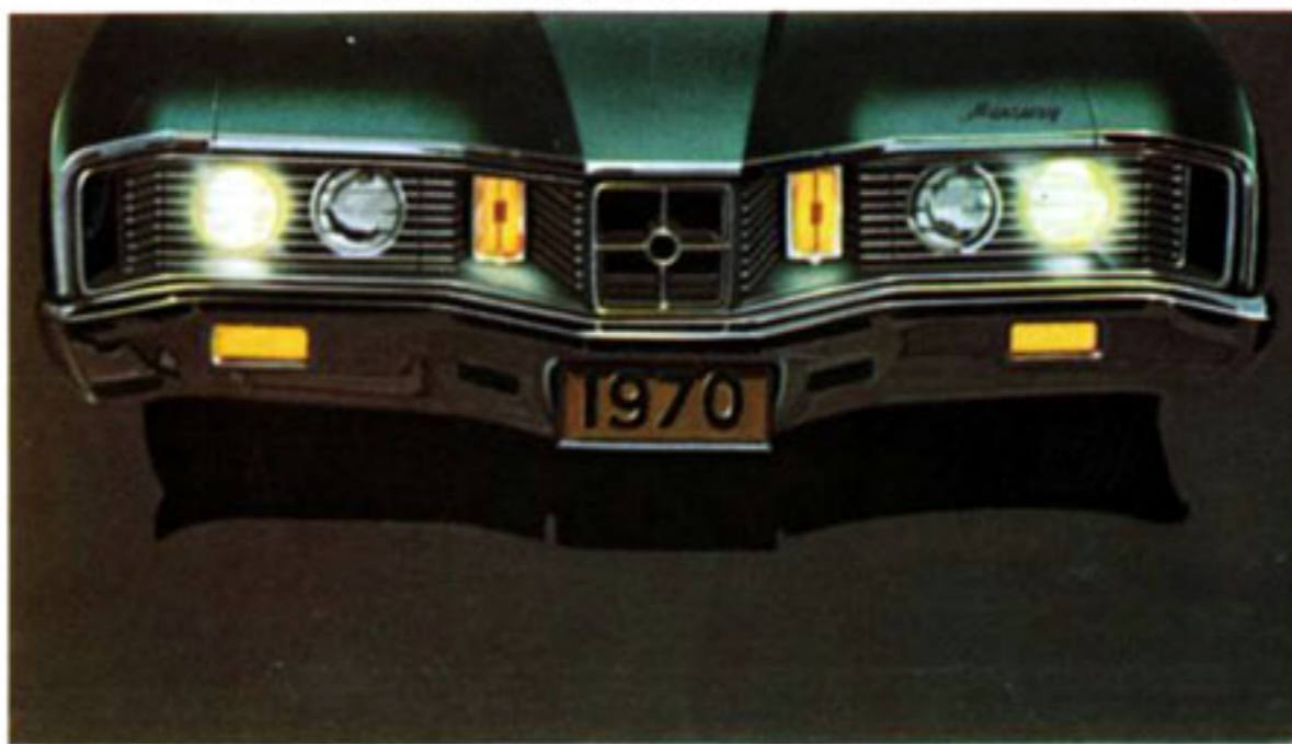
Special Cyclone running lights