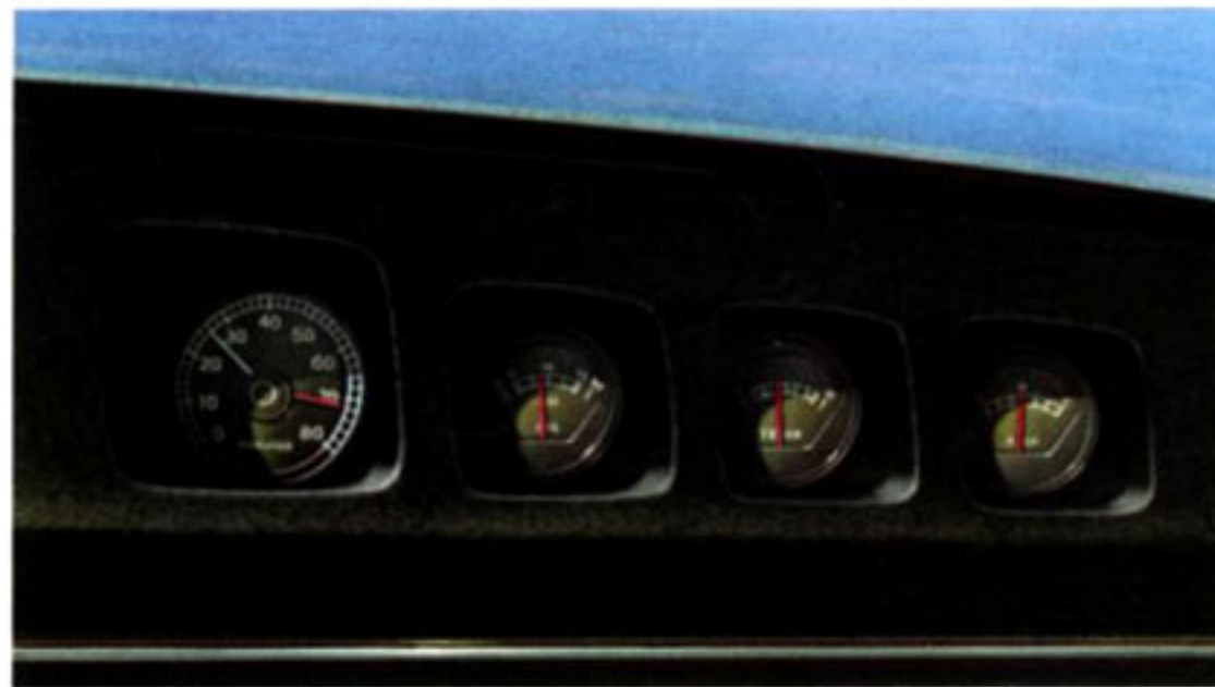
Instrumentation group, standard on Spoiler, optional for others.