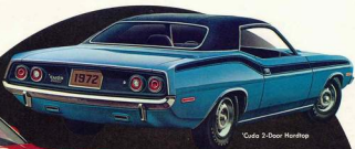
'Cuda 2-Door Hardtop