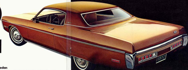
Fury Gran Coupe 2-Door Hardtop