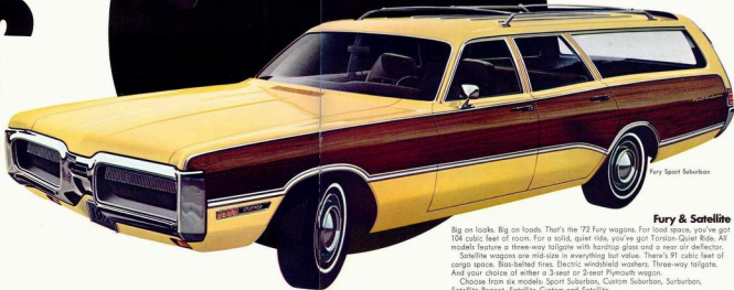
Fury Sport Suburban