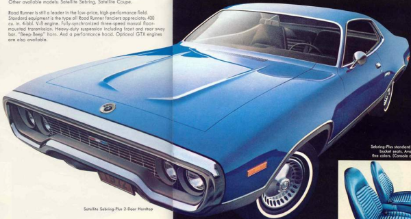
Satellite Sebring-Plus 2-Door Hardtop

Sebring-Plus standard all-vinyl bucket seats. Available in five colors. (Console optional.)