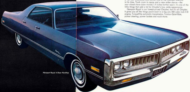
Newport Royal 4-Door Hardtop