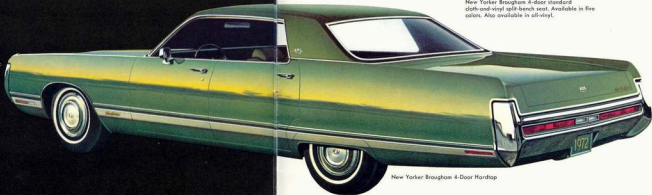
New Yorker Brougham 4-Door Hardtop

Town & Country is the complete wagon. New looks make it so with loop-type front bumper surrounding dual horizontal headlights, new simulated wood-grain appliqué on body sides and new rear wheel opening skirts. Standard features: new 3-way tailgate with hardtop glass and a power tailgate window.