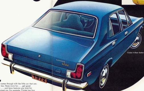
Cricket 4-Door Sedan