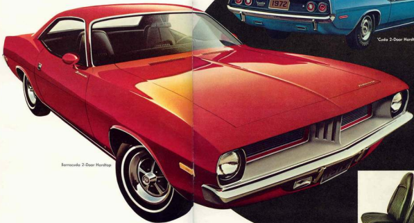
Barracuda 2-Door Hardtop

You're looking at two of the best-looking sporty cars made in America. The Barracuda hardtop—Six or V-8—is the low-cost way to let it happen. The 'Cuda is a charter member of the Rapid Transit System. Sporty options: stripes, racing mirrors, "Snap-Stick" floor shift. Comfort options: Air conditioning, power steering, automatic transmission and much more.