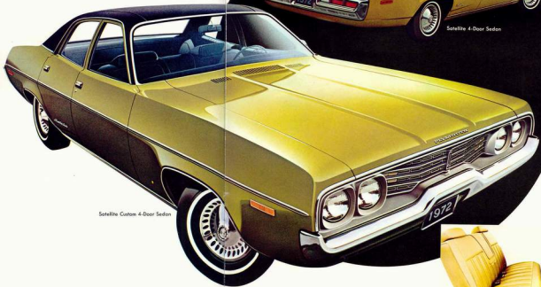
Satellite Custom 4-Door Sedan

Big luxury in a mid-size car is yours with the Satellite Custom. Four-door convenience is enhanced by bright wheel lip and windshield moldings. Optional decor includes protective vinyl body side and doorsill moldings. Our lowest-priced four-door Satellite sedan is designed from the ground up to be just a 4-door sedan. A 117 inch wheelbase aids in parking and maneuverability. Yet the interior is spacious enough for six adults to ride comfortably.