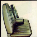
Fury Gran Coupe and Gran Sedan standard all-vinyl bench seat with center armrest. Available in six colors.