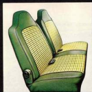
Duster and Duster 340 standard cloth-and-vinyl bench seat. Available in three colors.