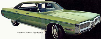
Fury Gran Sedan 4-Door Hardtop

two-door brothers it has a vinyl rear bumper appliqué that's scratch and dent resistant . . . and a vinyl side molding that helps defend against accidental door dings. Both are color-keyed in five colors. Just a couple of the ways we've engineered our cars to last and look good longer.