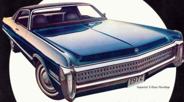
Imperial 2-Door Hardtop