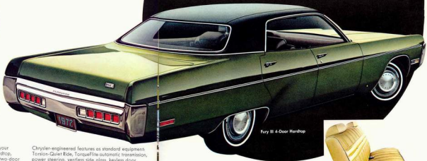
Fury III 4-Door Hardtop