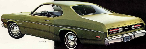
Duster 2-Door Coupe