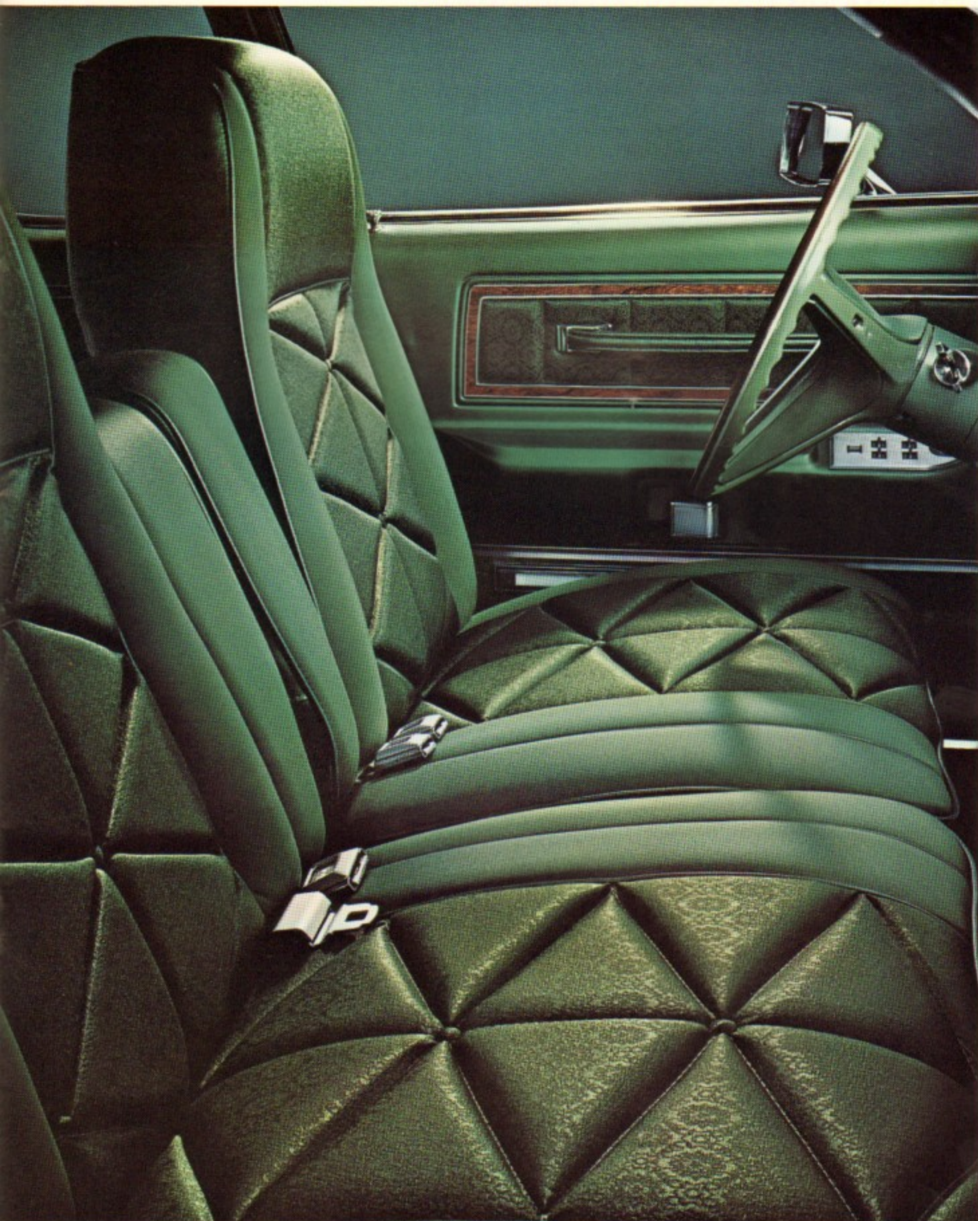
Marquis Brougham interior with optional Twin Comfort Lounge Seats & luxury steering wheel