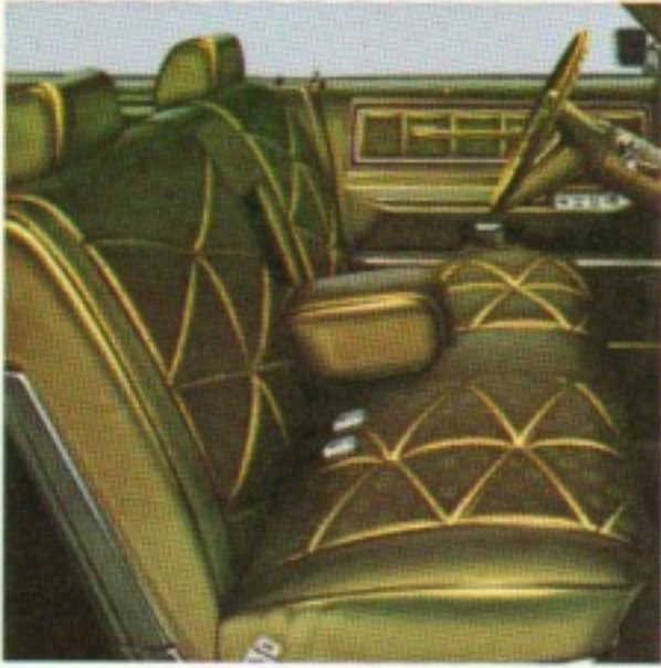
Marquis Brougham interior