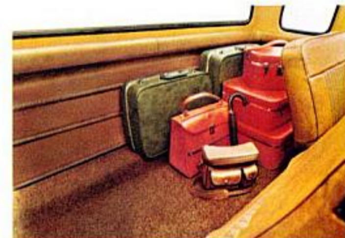
3. Big 44-cu. ft. cargo space is easy to reach from either side behind split-back front seat.