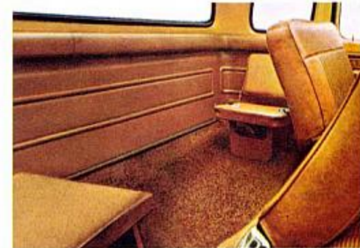
2. Jump seats (optional) have foam-padded cushion and back, fold out of way quickly when not in use to clear floor.