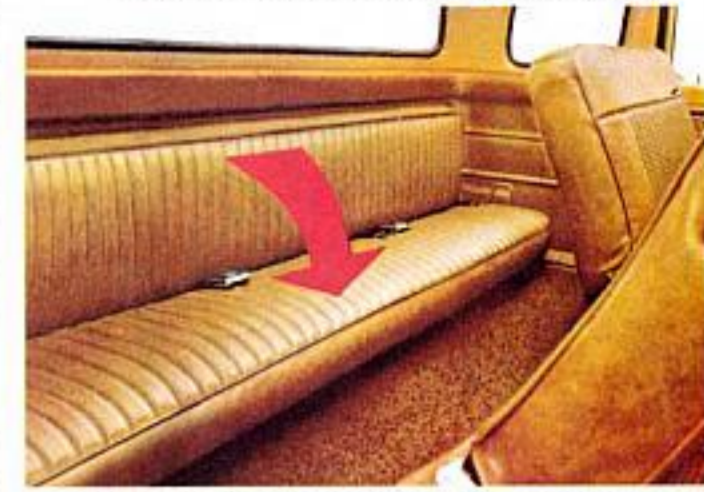
1. Foam-padded rear seat (optional) folds flat with steel-ribbed back to make load floor.