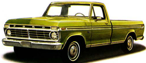
F-100 Ranger XLT with regular cab. Shown with optional whitewall tires, wheel covers and rear bumper.

SuperCab's large 15x15-inch rear side windows are standard. Flip-open feature optional... plain or tinted glass.