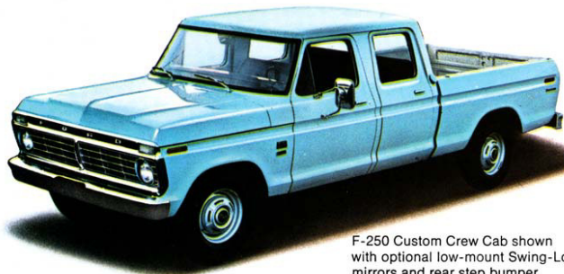
F-250 Custom Crew Cab shown with optional low-mount Swing-Lok mirrors and rear step bumper.