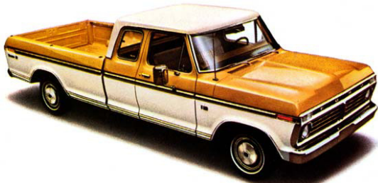
F-250 Ranger XLT SuperCab shown (here and on front cover) with optional rear seat, two-tone paint, whitewall tires, wheel covers, rear bumper, flip-open side windows, radio and low-mount Swing-Lok mirrors.