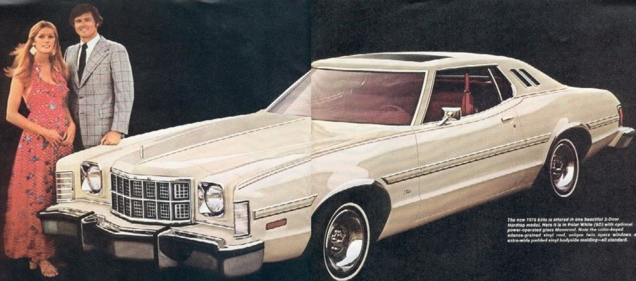
The new 1975 Elite is offered in one beautiful 2-Door Hardtop model. Here it is in Polar White (9D) with optional power-operated glass Moonroof. Note the color-keyed odense-grained vinyl roof, unique twin opera windows and extra-wide padded vinyl bodyside molding—all standard.