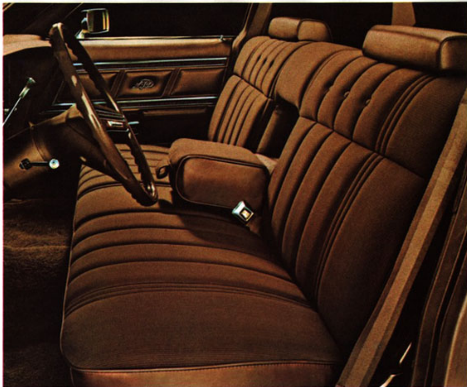
Beautiful LTD Brougham 4-Door Pillared Hardtop

Beautiful LTD Brougham 4-Door Pillared Hardtop, illustrated below in Creme finish (Code 6P), with Dark Brown vinyl roof. Luxurious to see. Luxurious to own.