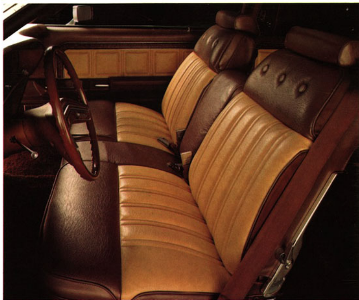
LTD Landau 2-Door Pillared Hardtop

The LTD Landau 2-Door Pillared Hardtop is shown below in Dark Brown Metallic/Tan Glow, an optional Harmony Color Group exterior (Codes 5Q, 5U), beautifully coordinated with a Brown vinyl roof.