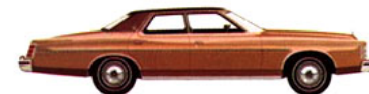
LTD Brougham 4-Door Pillared Hardtop, Tan Metallic (Code 5U), 2-Door Pillared Hardtop also available.