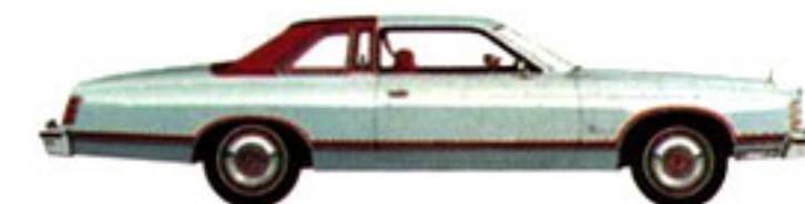
LTD Landau 2-Door Pillared Hardtop, Silver Metallic (Code 1G), 4-Door Pillared Hardtop also available.