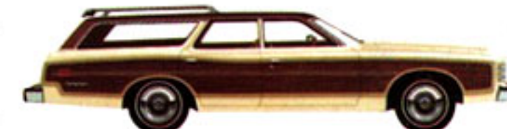
LTD Country Squire, 4-Door, Creme (Code 6P), LTD Wagon also available.