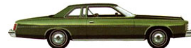
Ford LTD 2-Door Pillared Hardtop, Dark Yellow Green Metallic (Code 4V), 4-Door Pillared Hardtop also available.