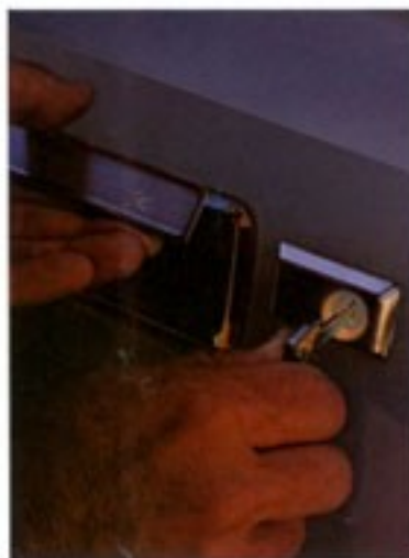
Illuminated entry system

Each luxury group has 6-way power passenger seat, grey cut-pile carpeting in luggage compartment, plus choice of exterior color finish, premium bodyside molding and optional vinyl roof.