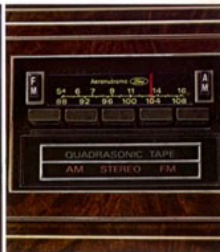
AM/FM/MPX radio with Quadrasonic-8 tape system