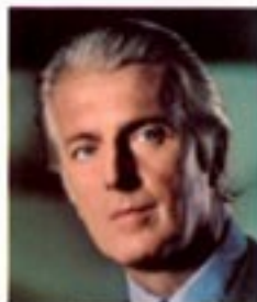
Hubert de Givenchy

Models' fashions by Givenchy. Options shown are dual wide-band white side- walls, illuminated entry system, and remote control right-hand mirror.