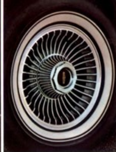
Turbine-styled cast aluminum wheels