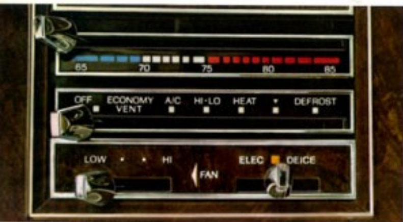
Automatic Temperature Control