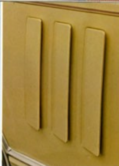
Functional fender louvers