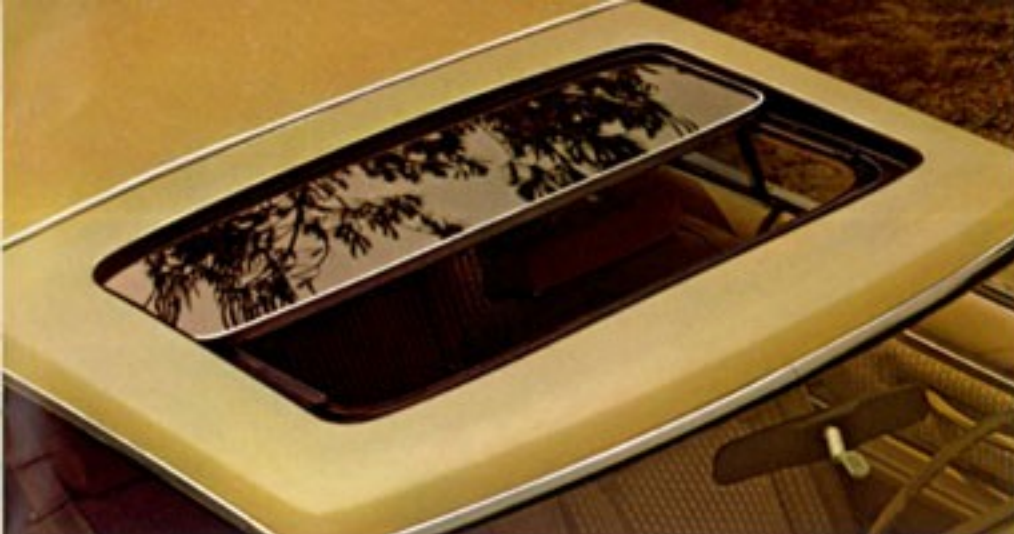
Power glass moonroof