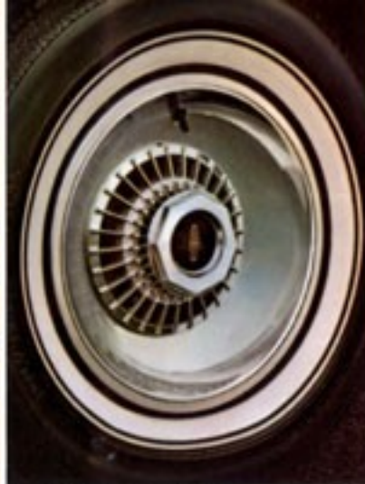
Forged aluminum wheels