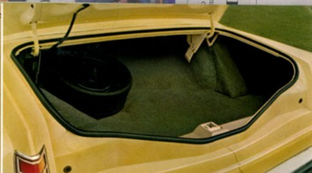
Space saver spare tire (with cover removed)