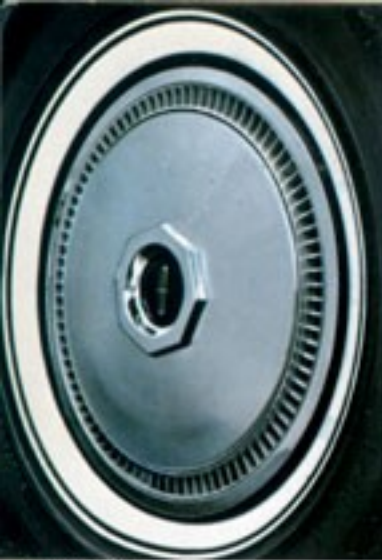
Luxury wheel covers