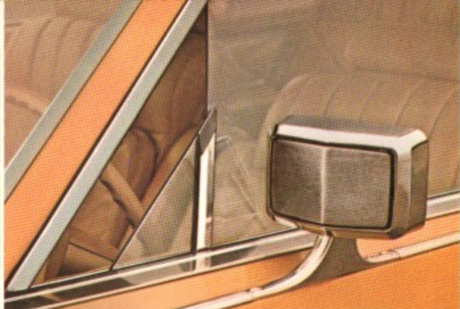
Power vent windows