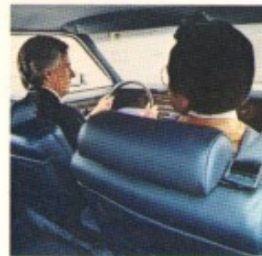
The midnight blue Lincoln Continental sedan is shown with optional coach roof, premium bodyside moldings, custom paint stripes, defroster group, luxury wheel covers, illuminated entry system, and remote control right-hand mirror.

The 1977 Lincoln Continental. You'll drive one because you've got your standards.