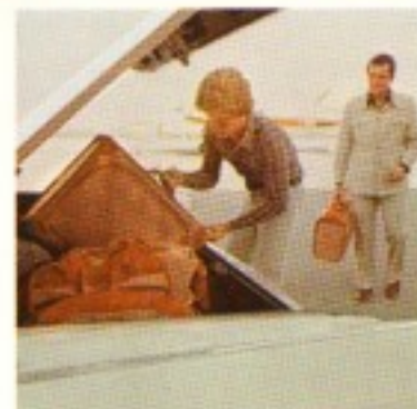
Dark red interior shown with optional leather seating surfaces.

Experience the 1977 Lincoln Continental for yourself. It's a car of uncompromising character.