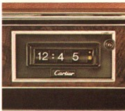
Cartier-signed digital timepiece