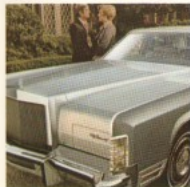
The silver Williamsburg shown with optional remote control right-hand mirror.

It's a classic in every meaning of the word. In room. In ride. In its handsome styling and approach to comfort. You can sense the Williamsburg's fine character in its smartly coordinated body colors and vinyl roofs of silver/grey or dark/midnight cordovan. And you can see it in such accessories as standard power vent windows. And in the richness of our Twin Comfort Lounge Seats. This luxurious interior provides both you and your front passenger with the convenience of illuminated visor vanity mirrors and six-way power seats. There's a recliner on the passenger side for extra comfort on long trips. And you have your choice of selecting lavish leather with vinyl or soft Media velour fabric.