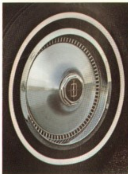
Deluxe wheel covers

(Preceding standard features plus): • Power vent windows • Six-way power seat • Leather with vinyl bench seat with "loose pillow" appearance • Carpeted luggage compartment with spare tire curtain • Unique upper door and quarter trim panels • Full vinyl roof • Coach lamps • Town Coupé/Town Car script identification.