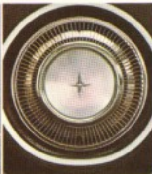
Luxury wheel covers