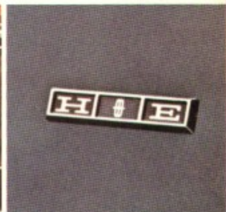
Personalized owner's initials