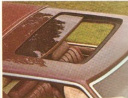
Power glass moonroof