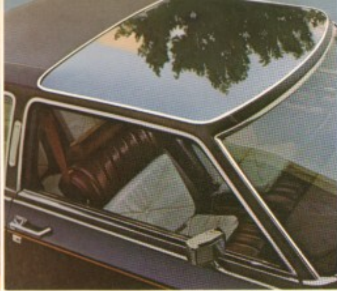
Wide fixed glass moonroof