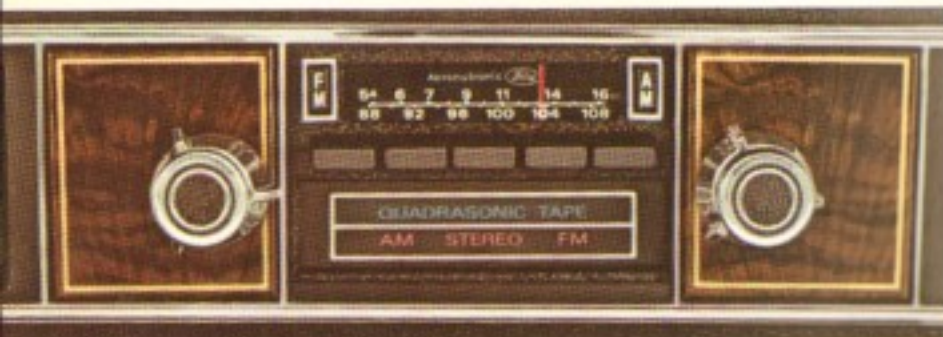
AM/FM stereo with Quadrasonic 8-track tape system

Sure-Track brake system with 4-wheel disc brakes—(not illustrated) provides maximum braking modulation and fade resistance at each wheel, and helps prevent sustained rear wheel lock-up on ice, snow, or wet pavement (N/A Calif.).