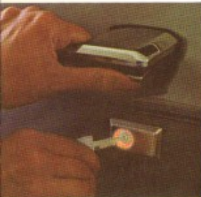
Illuminated entry system