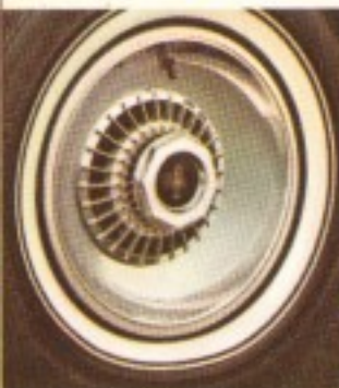
Forged aluminum wheels