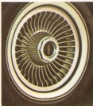
Turbine-styled cast aluminum wheels