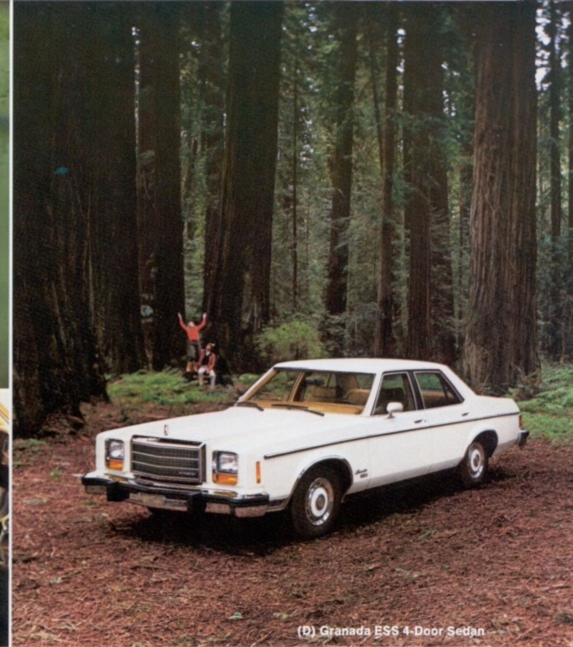
(D) Granada ESS 4-Door Sedan