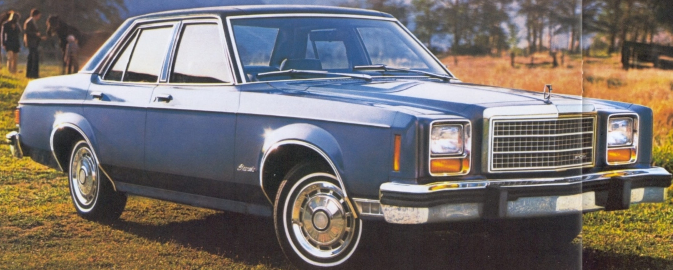
(A) Granada 4-Door Sedan