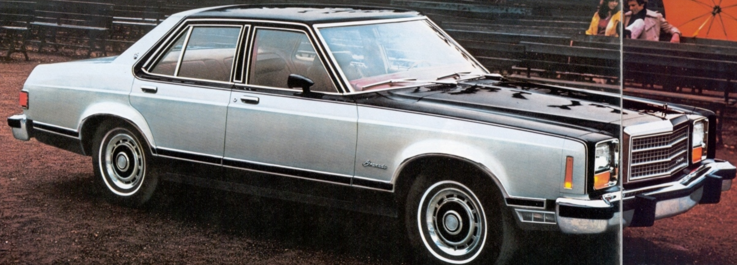
(A) Granada Ghia 4-Door Sedan with new Tu-Tone paint