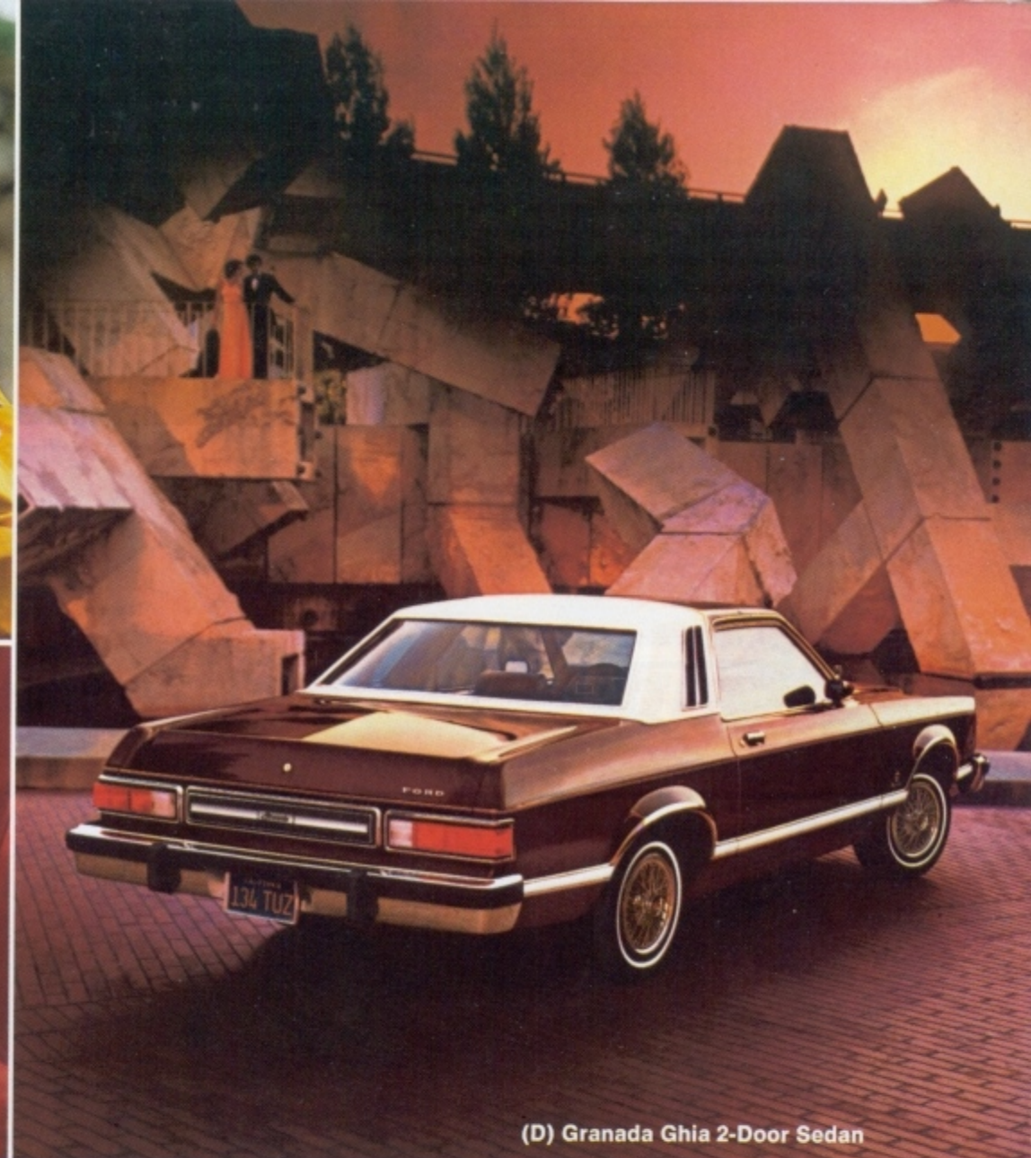
(D) Granada Ghia 2-Door Sedan