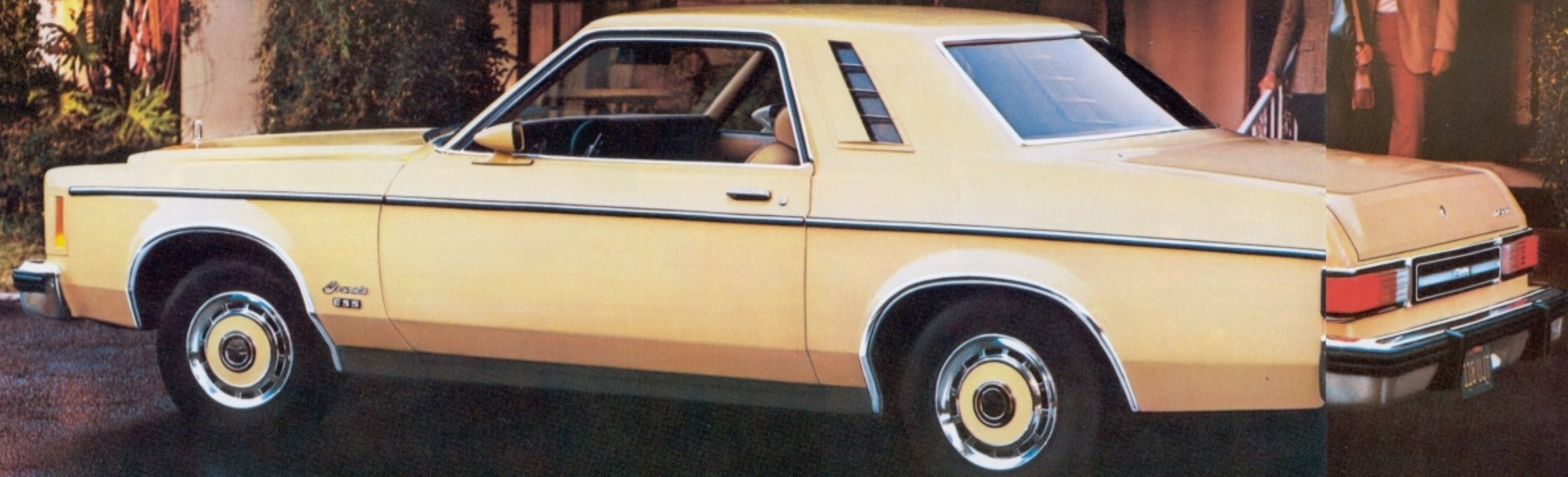
(A) Granada ESS 2-Door Sedan