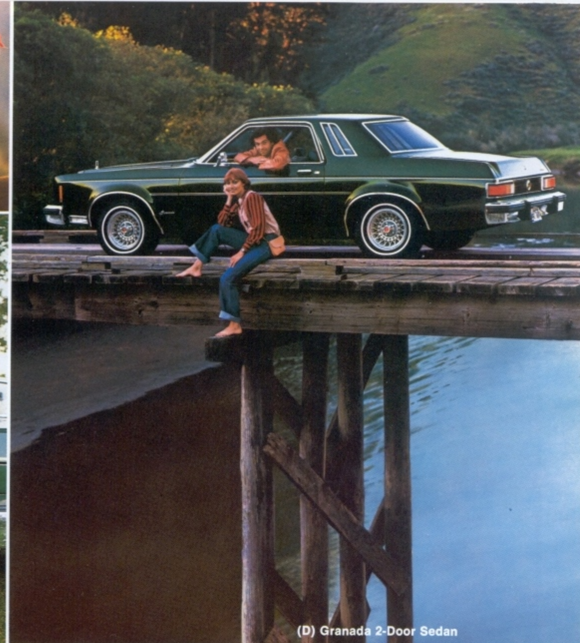
(D) Granada 2-Door Sedan