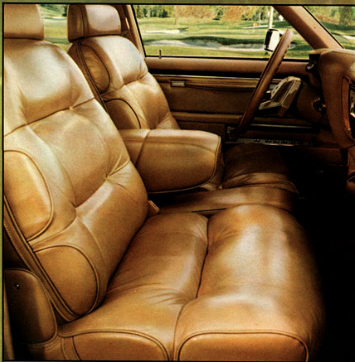
Luxury unlimited. The Town & Country's optional 60/40 leather-and-vinyl seating.

T own & Country. The very name tells you that this is no ordinary means of transportation. Of course, it can carry a generous 73.3 cubic feet of cargo with the rear seat down or six adult passengers with the rear seat up. But how it carries them! In the lap of luxury. With carpeting, stainless steel skid strips and lockable stowage bins in the cargo area. With soft vinyl seating standard. In a car as quiet and solid as Chrysler can make it.