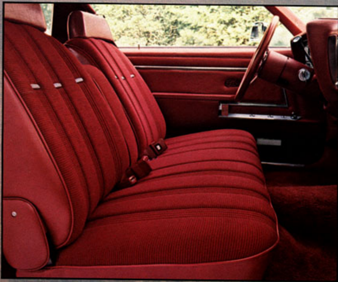
These cloth-and-vinyl seats with folding center armrest are standard on the Salon two-door. Shown here in Red.

But don't get the idea that this LeBaron two-door is just another handsome mid-size automobile. Try to look beyond its shiny surface for a moment and you'll discover a solid, well-built car. The product of fine engineering, exceptional workmanship and one of the most demanding quality control programs in the automotive industry.