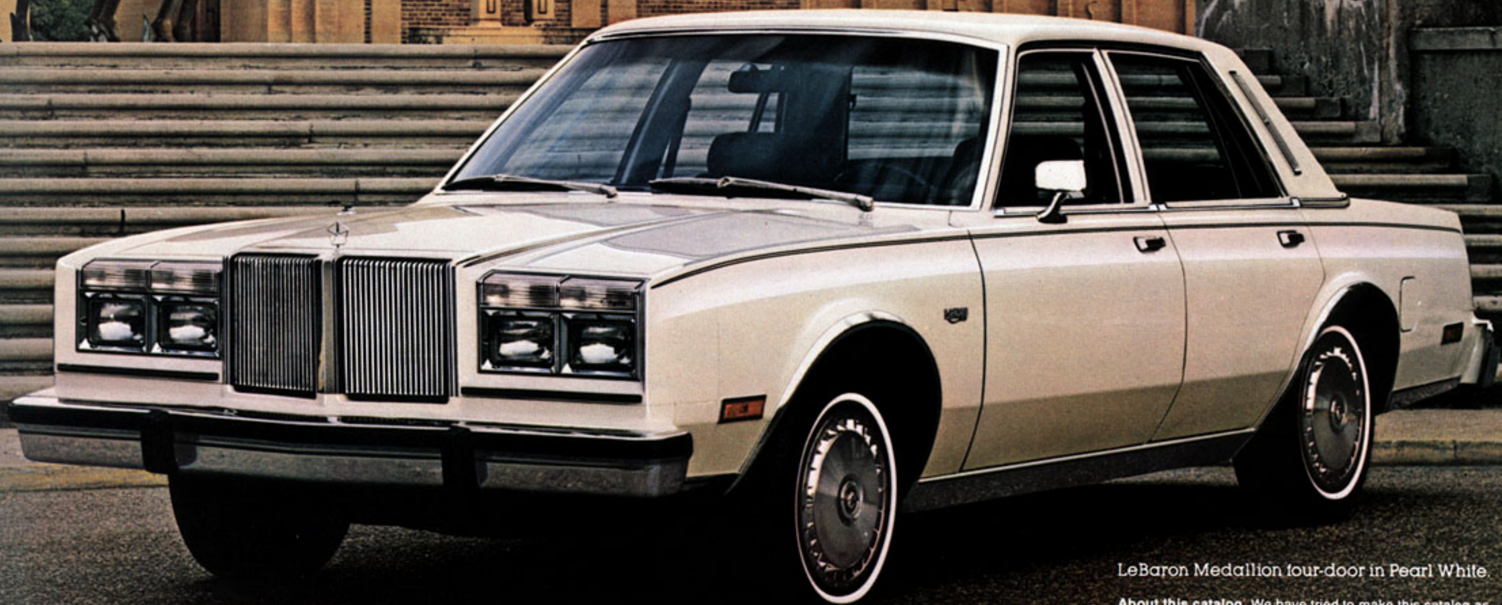
LeBaron Medallion four-door in Pearl White.

About this catalog: We have tried to make this catalog as complete as possible. And we hope you find it useful. However, since the time of printing, some of the information you'll find here may have been updated. Also, some of the equipment shown or described throughout this catalog is available at extra cost. Your dealer has details and you should ask him for current information before ordering.