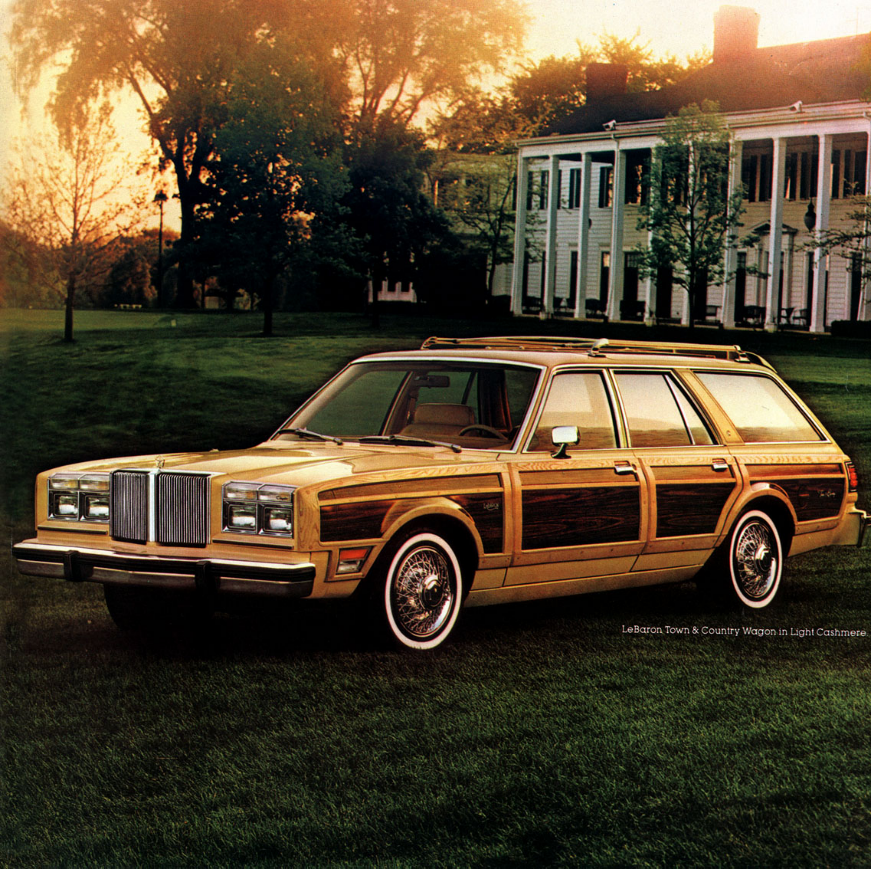
LeBaron Town & Country Wagon in Light Cashmere