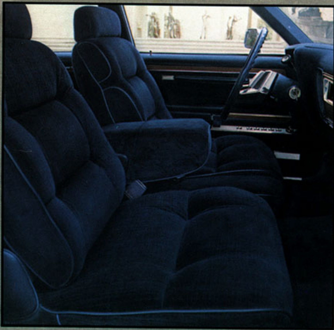
LeBaron Medallion four-door's standard 60/40 seating upholstered in rich cloth. Shown here in Dark Blue.

Y ou might call the '81 LeBaron Chrysler's finest mid-size sedan ever. Go ahead. You wouldn't be far from the truth. Because, whether you choose the elegant top-of-the-line Medallion (shown here) or the surprisingly well-appointed Salon, you'll be getting a four-door that's built to be driven and enjoyed for years to come.