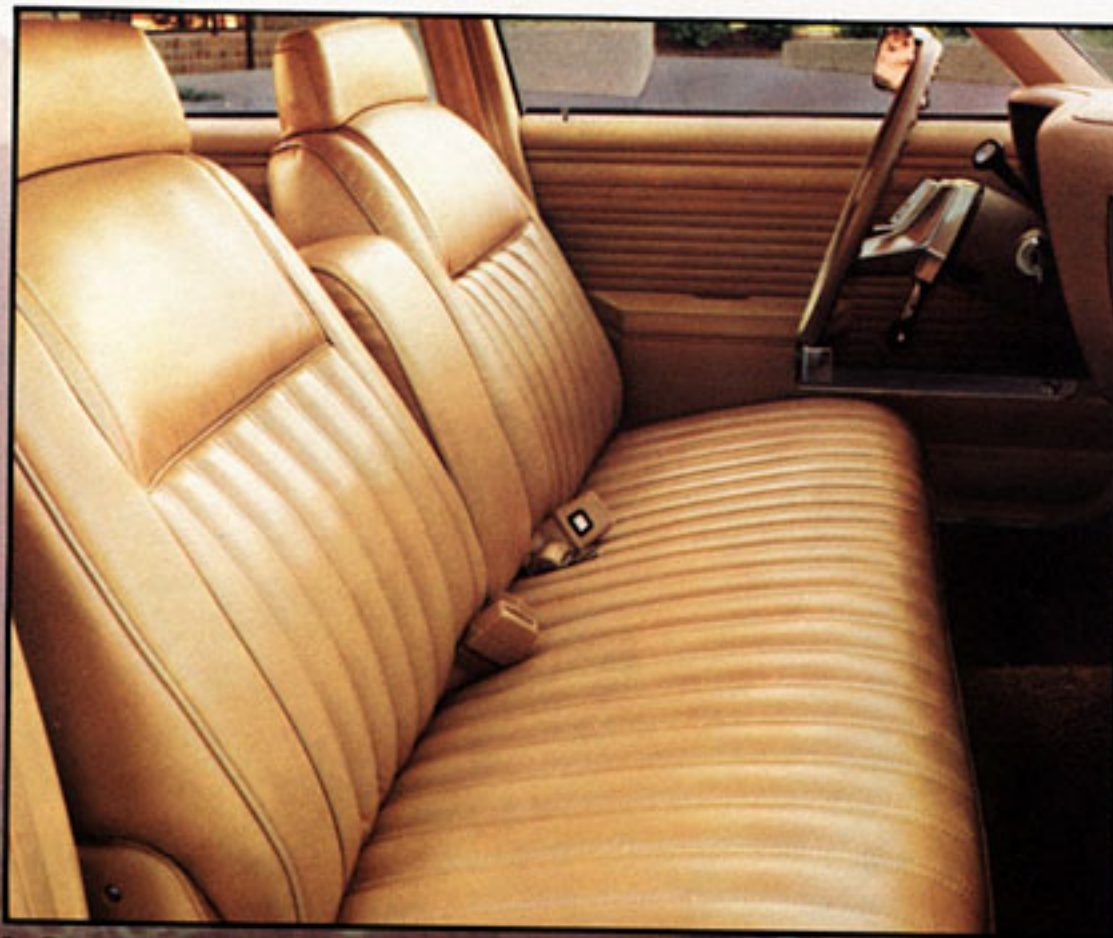
LeBaron Special sedan's optional split-back bench seat in soft vinyl with folding center armrest. Shown here in Cashmere.

These—and Chrysler's constant attention to quality in every detail—are all part of what makes the 1981 LeBaron Special sedan such an extremely valuable commodity in today's mid-size market.