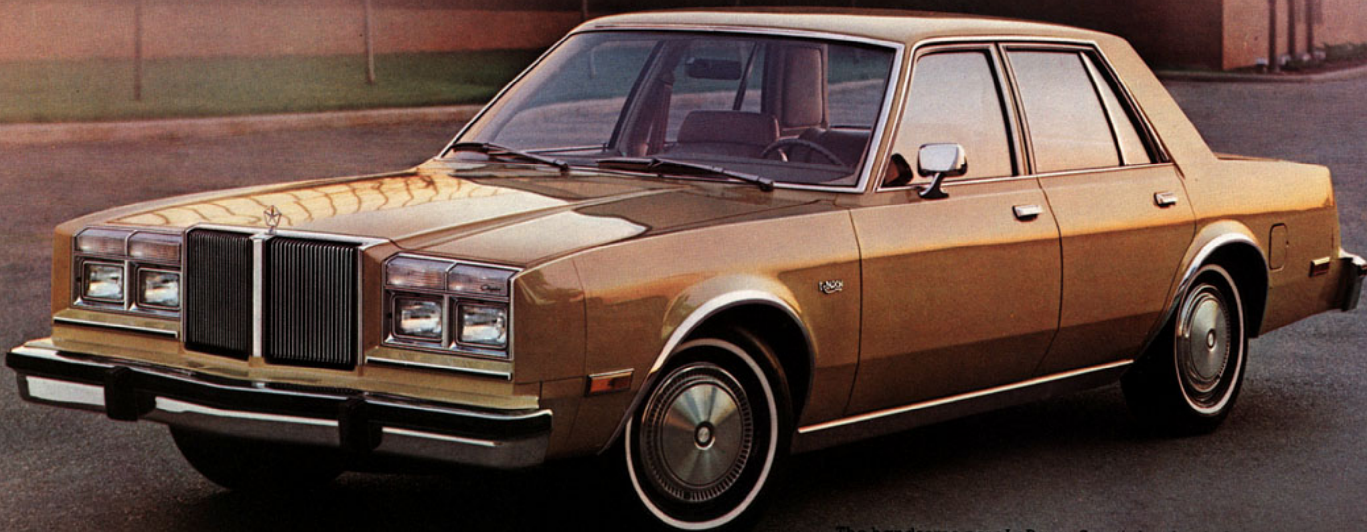
The handsome new LeBaron Special sedan in Light Cashmere.