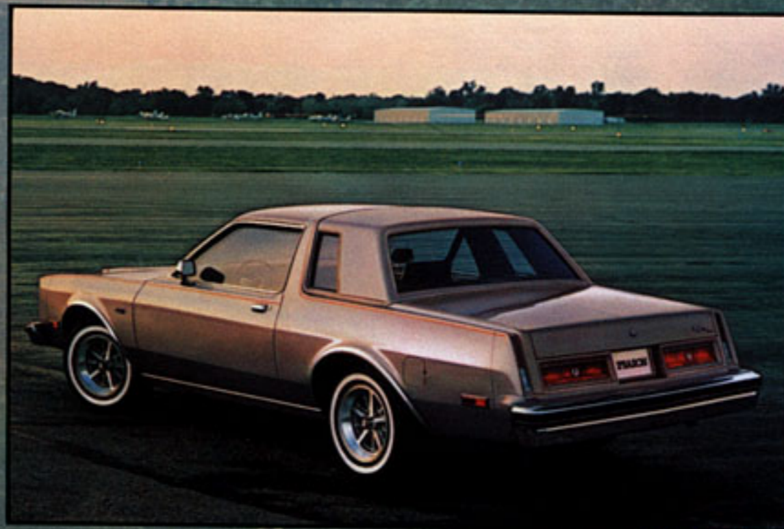
LeBaron Salon two-door in Burnished Silver Metallic.

Make no mistake—with standard equipment like a proven Slant Six engine, power steering, power brakes, a TorqueFlite automatic transmission and an isolated transverse torsion bar front suspension—the 1981 LeBaron two-door is one very enjoyable car to own and drive. But it's Chrysler's unswerving commitment to quality that makes LeBaron the truly fine car it is. And an unquestionable value for the money. Right now... and in the years ahead.