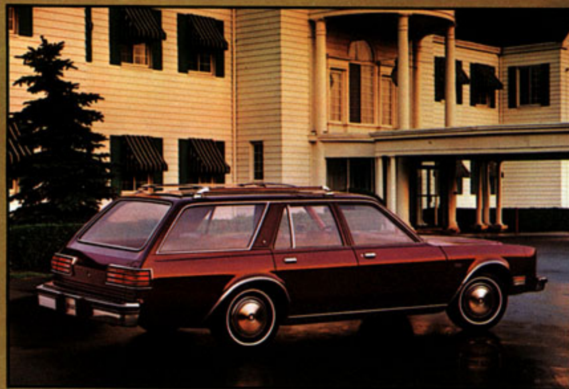
The beautiful LeBaron Wagon in Baron Red.

For people who prefer their elegance and utility . . . but not their quality . . . understated, there is also a more affordable LeBaron Wagon. Whichever one you choose, rest assured that you have selected a mid-size wagon with a remarkable capacity for the finer things in life.