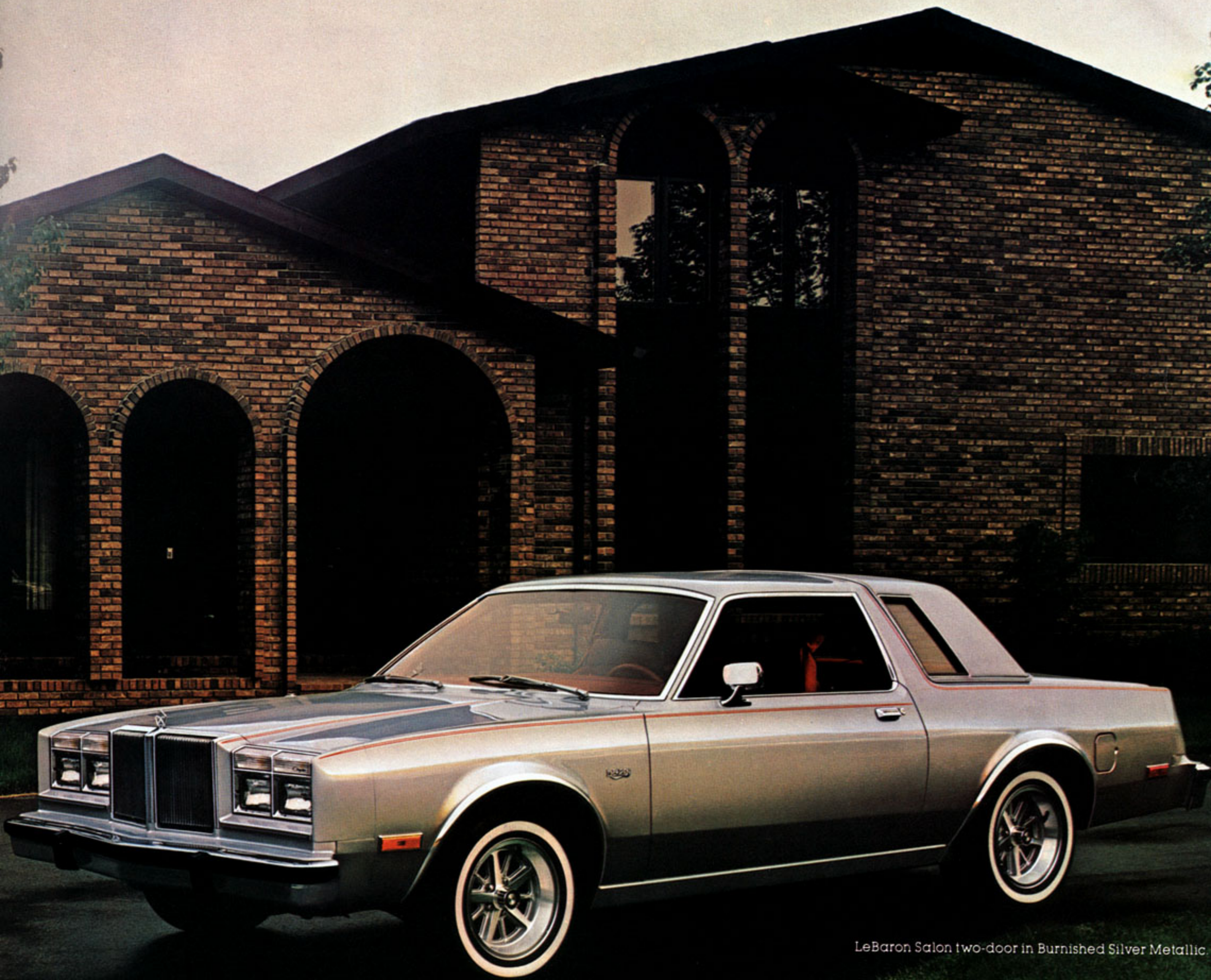
LeBaron Salon two-door in Burnished Silver Metallic.