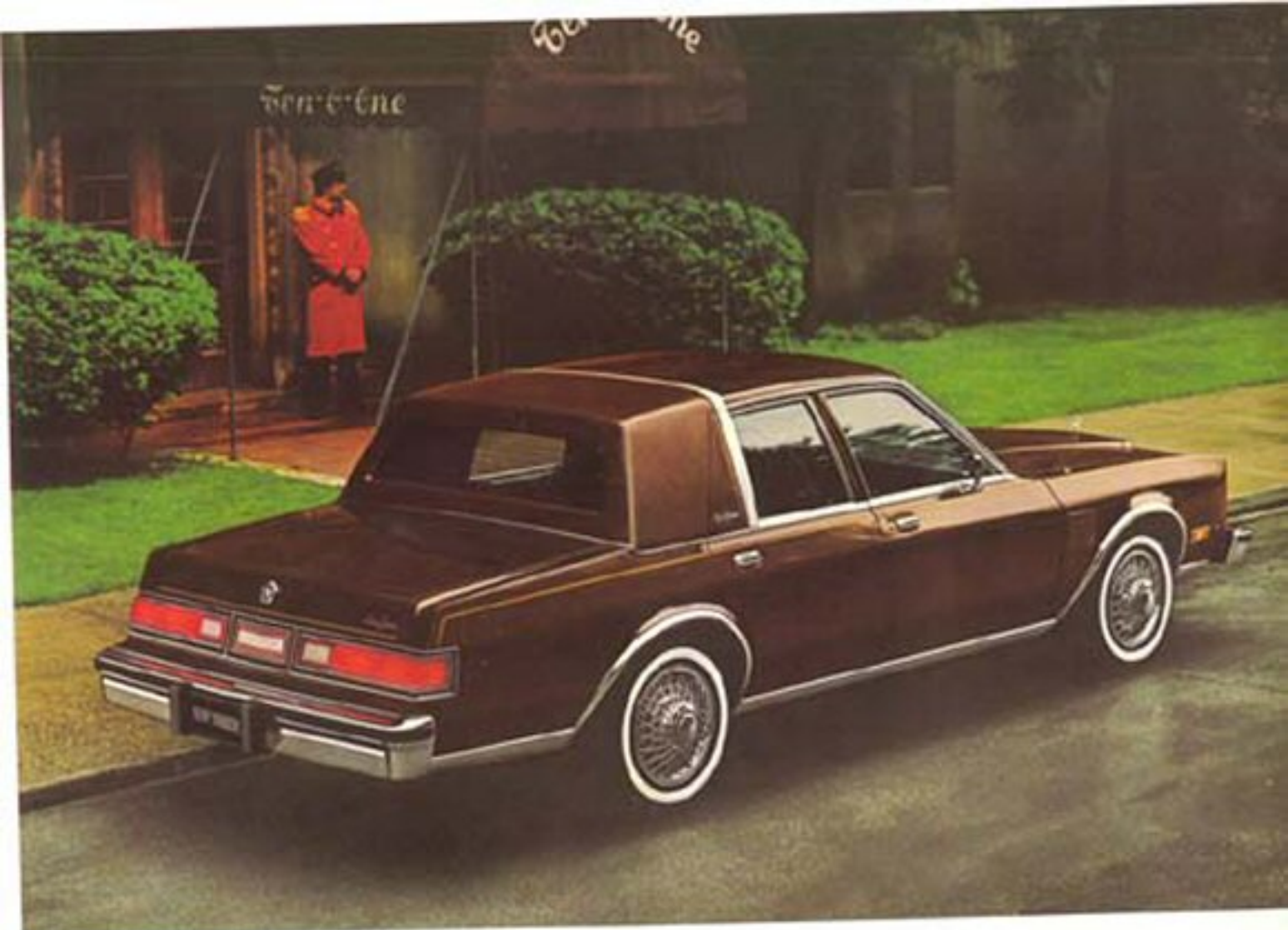
NEW YORKER IN MAHOGANY METALLIC.