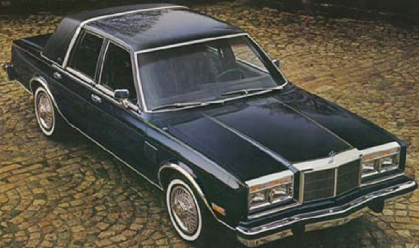
CHRYSLER NEW YORKER, FIFTH AVENUE EDITION IN NIGHTWATCH BLUE.

Some of the equipment shown or described throughout this catalog is available at extra cost.