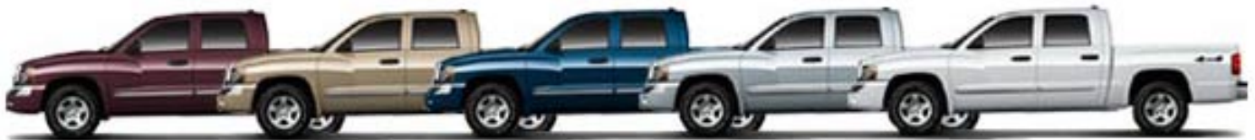
Deep Molten Red Pearl Coat