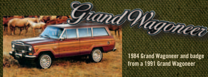
1984 Grand Wagoneer and badge from a 1991 Grand Wagoneer

Jeep Wagoneer The Ultimate in 4-wheel drive