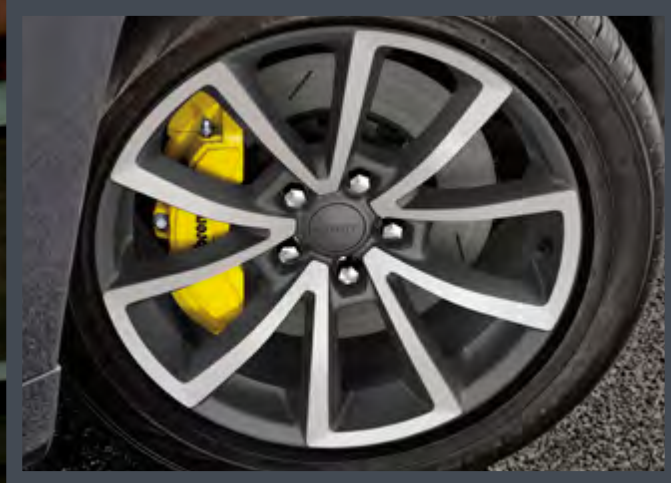
HIGH-PERFORMANCE 6-PISTON BREMBO® CALIPER

THE MORNING SKY OPENS. PRESS ON. TIME WILL NOT WAIT.