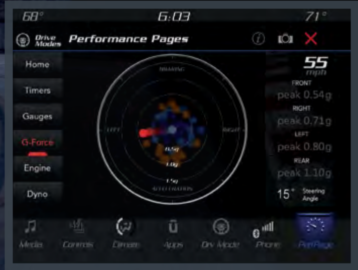
PERFORMANCE PAGES: G-FORCE HEAT MAP

SIMPLY EXHILARATING. LEAN IN. OWN EVERY CURVE.