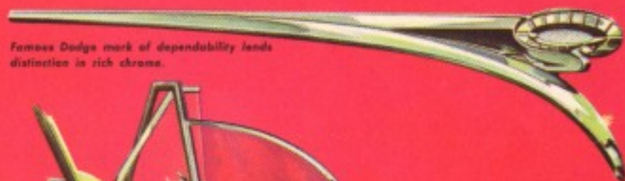
Famous Dodge mark of dependability lends distinction in rich chrome.