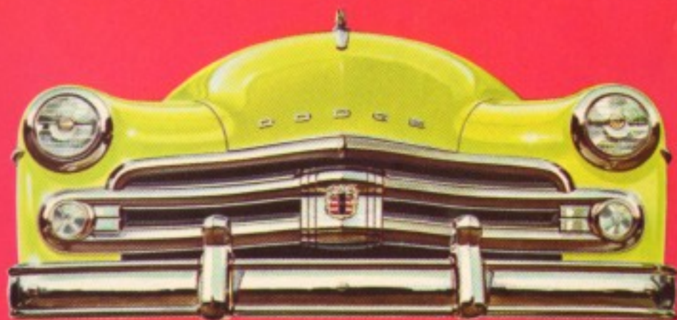
Attractive use of brilliant chrome gives a massive modern appearance to new Dodge grille.