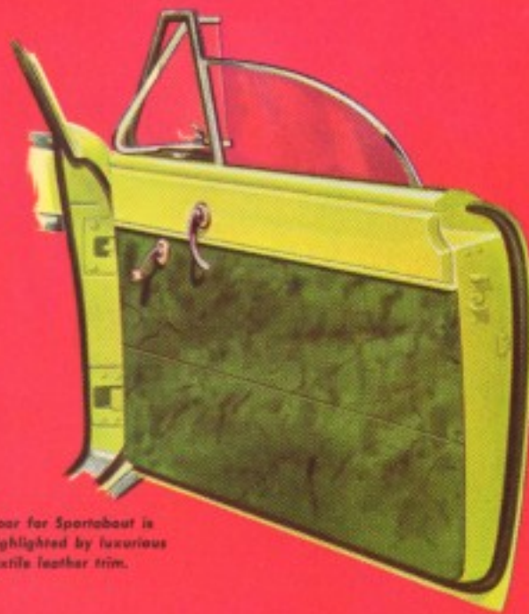
Door for Sportabout is highlighted by luxurious textile leather trim.