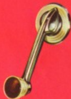
Smartly styled crank speeds window completely up or down in 1½ turns.