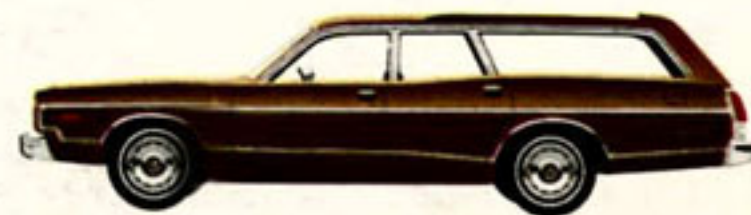
Coronet Crestwood wagon