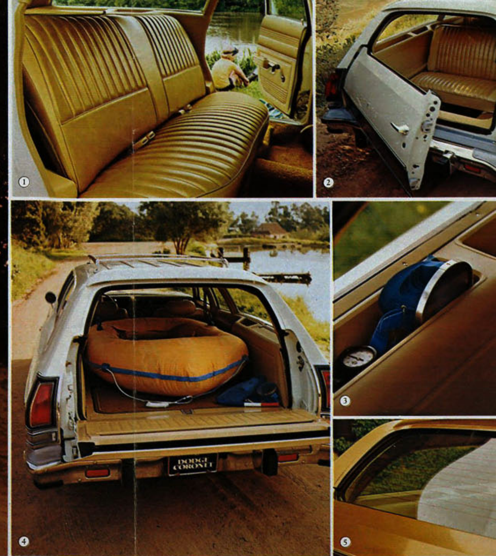
Coronet Crestwood wagon