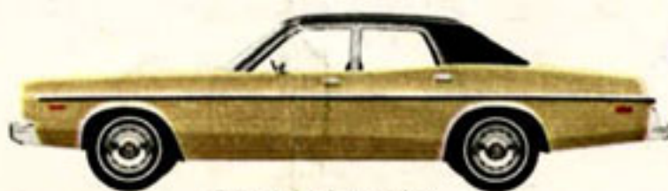
Coronet 4-door sedan