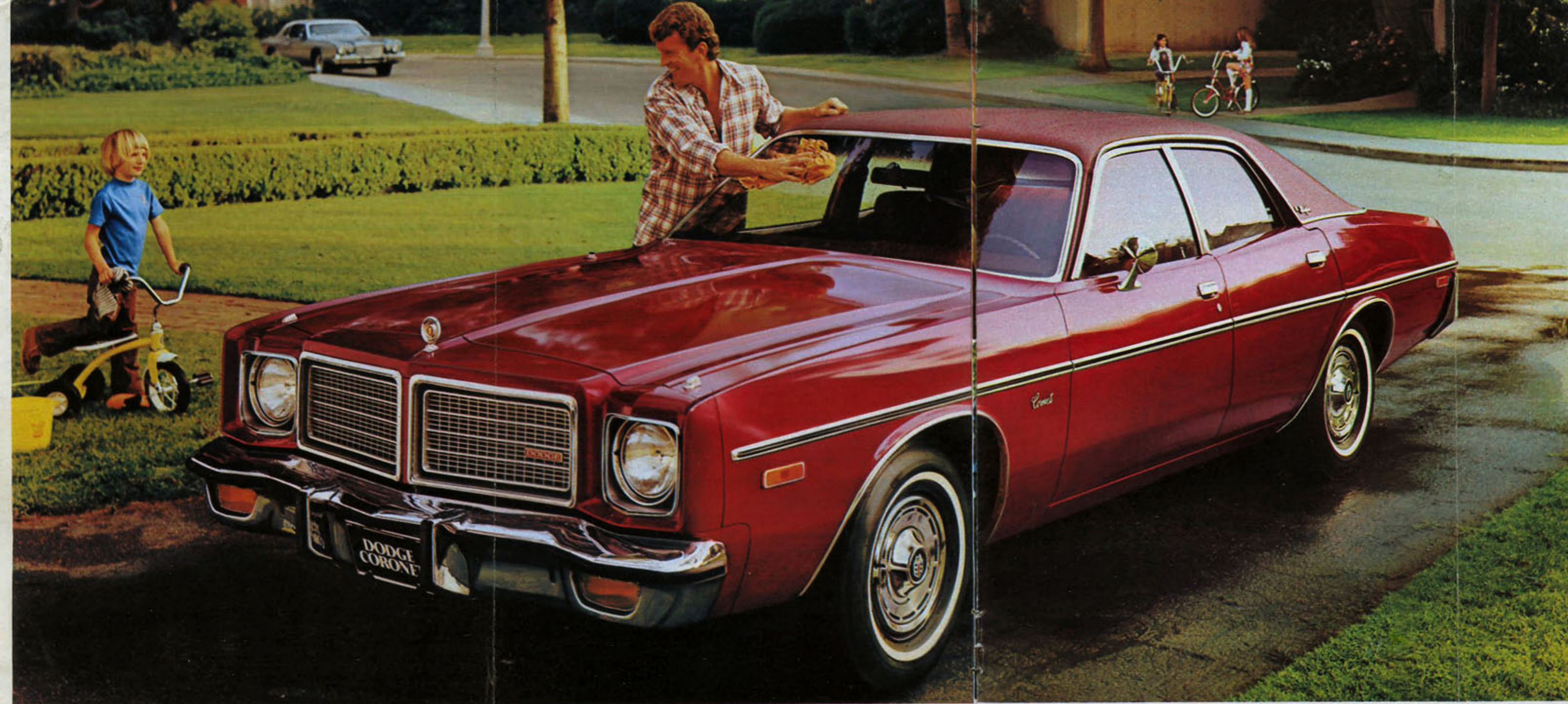
Coronet Brougham 4-door sedan