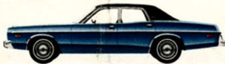
Coronet Brougham 4-door sedan