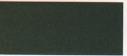
Medium Fern Pearl Coat