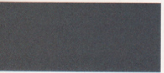
Light Iris Pearl Coat