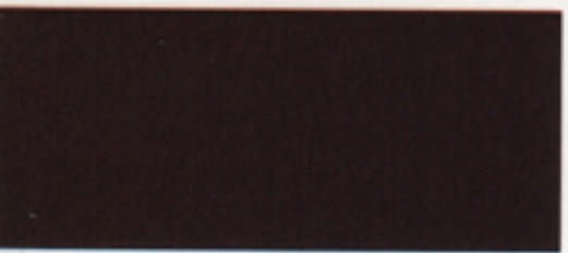
Dark Rosewood Pearl Coat