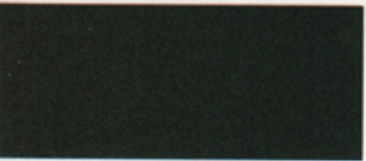
Forest Green Pearl Coat