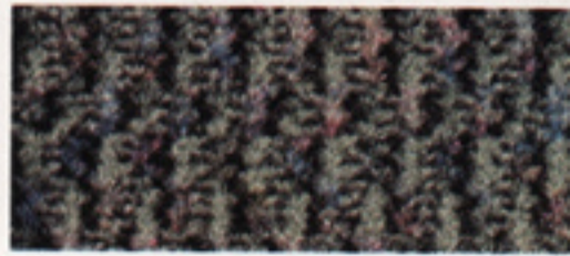
Joliett cloth fabric (Stratus model only), shown in Silver Fern