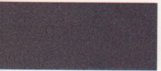
Orchid Pearl Coat