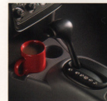
▲ A standard center console includes storage, two cup holders and a power outlet. An available Smoker's Package replaces the left cup holder with an ash receiver and adds a lighter to the power outlet.