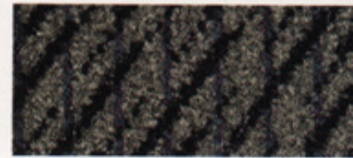
Pulsar cloth fabric (ES model only), shown in Silver Fern