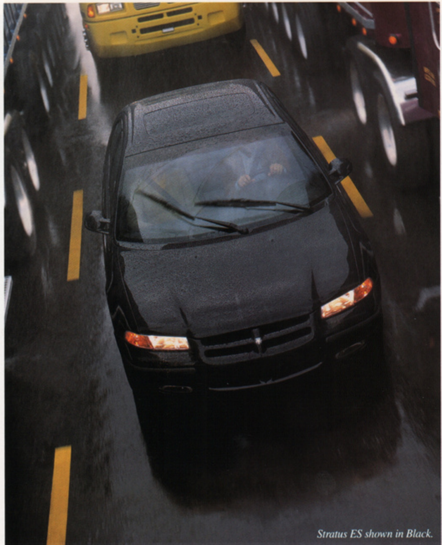
Stratus ES shown in Black.