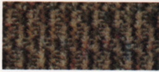
Joliett cloth fabric (Stratus model only), shown in Camel