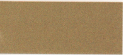
Light Gold Pearl Coat