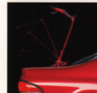
▲ Stratus’ large trunk (15.7 cubic feet) features a low liftover for easy loading and unloading. Spring-operated hinges help by positioning the trunk lid up and out of the way.