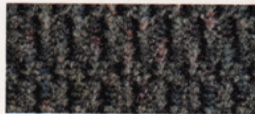
Joliett cloth fabric (Stratus model only), shown in Mist Gray