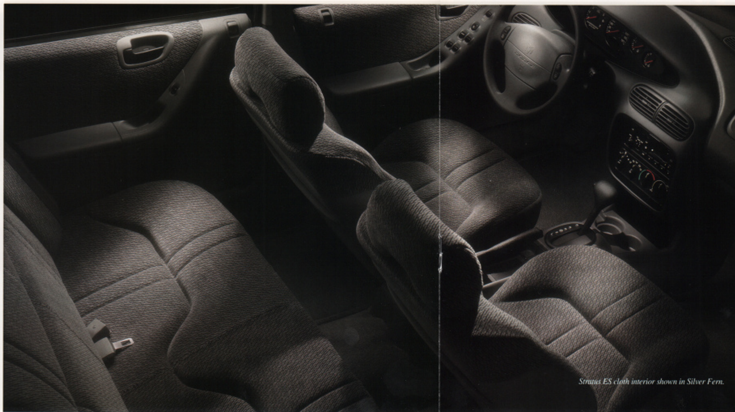
Stratus ES cloth interior shown in Silver Fern.

“The cab-forward design gives the Stratus a huge interior, which feels like a first-class cabin compared to the competition’s coach class.”