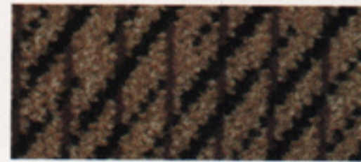
Pulsar cloth fabric (ES model only), shown in Camel