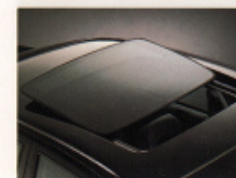
▲ Optional sunroof. From the closed or vent position, simply touch Stratus’ available power sunroof control once to move it to its full open position. (Sunroof late availability.)