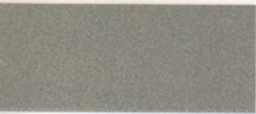
Light Silver Fern Pearl Coat