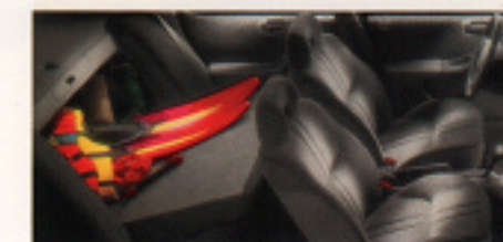
▲ Stratus’ rear seatback folds down, providing increased cargo area.