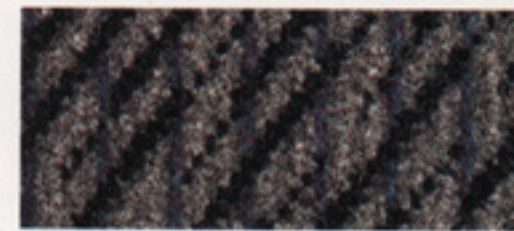
Pulsar cloth fabric (ES model only), shown in Mist Gray