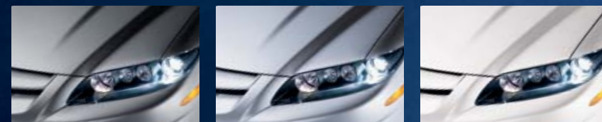
TITANIUM GRAY METALLIC