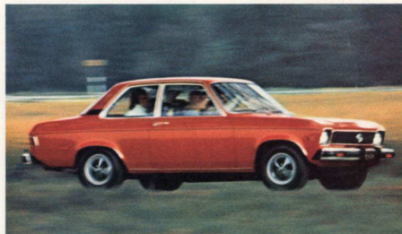
1900 SEDAN. Functional design; spirited soul.