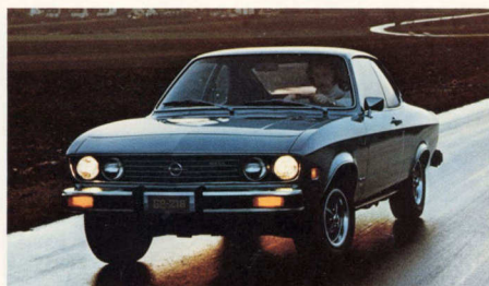
MANTA. Our most rakish-looking Opel.

And, naturally, control switches are labelled with international insignias.