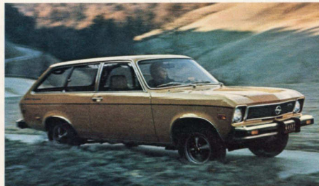
SPORTWAGON. Essentially the 1900 Sedan with a 53.3 cubic foot storage space.