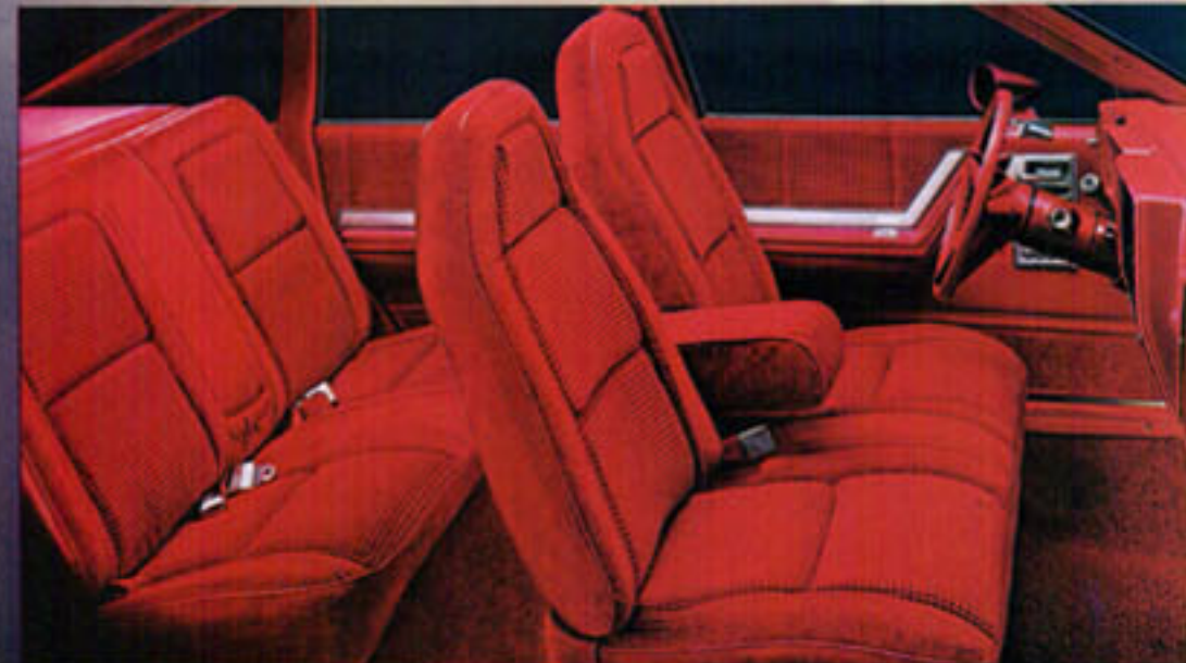
Hobnail cloth notchback seats with center armrest are lavishly standard on LJs.

And here's one more special feature standard on Phoenix LJ Hatchback and available on the base Hatchback: a removable cargo cover that conceals