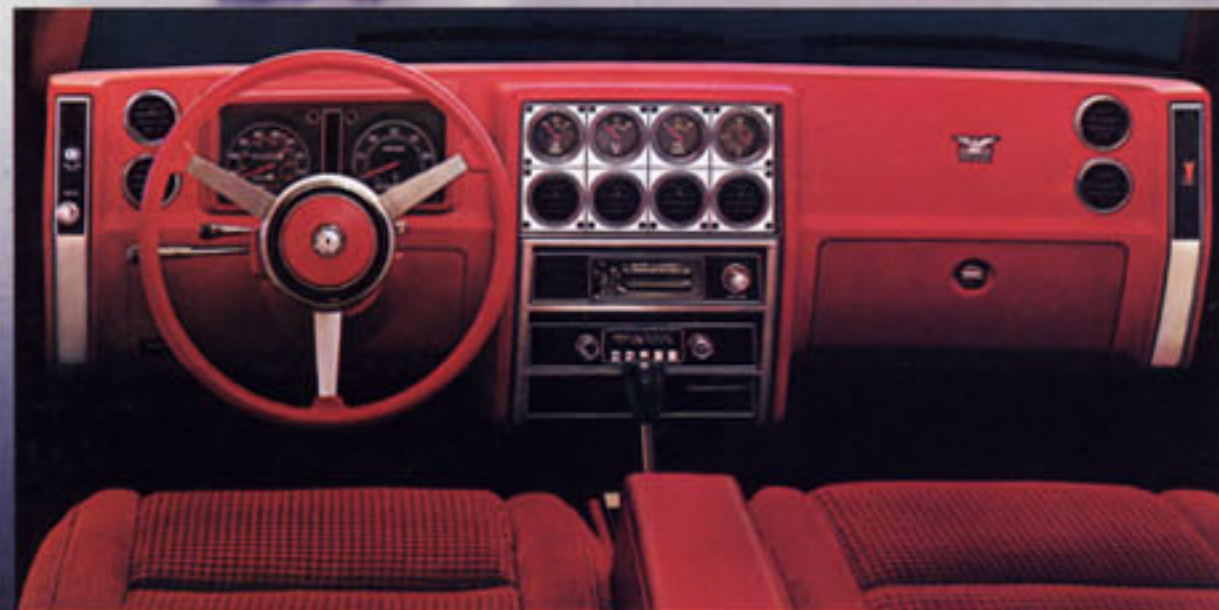
This exclusive new Phoenix instrument panel displays many available controls and gauges.

In keeping with Pontiac tradition, Phoenix for 1980 offers you a high degree of personalization.