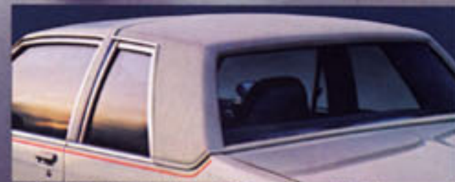
Top honors go to Phoenix Coupe's available landau top.