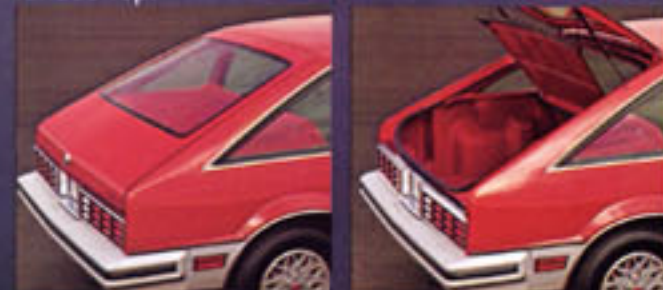
Protect Hatchback parcels from prying eyes with available cargo cover. Raises with hatch door.

Phoenix your own include: a choice of 26 color combinations (including two-tones and special SJ combinations). Padded landau or full cordova top (Coupe only). Console (with bucket seats only). Air conditioning. Power door locks and windows. And for the first time, power seat and antenna.