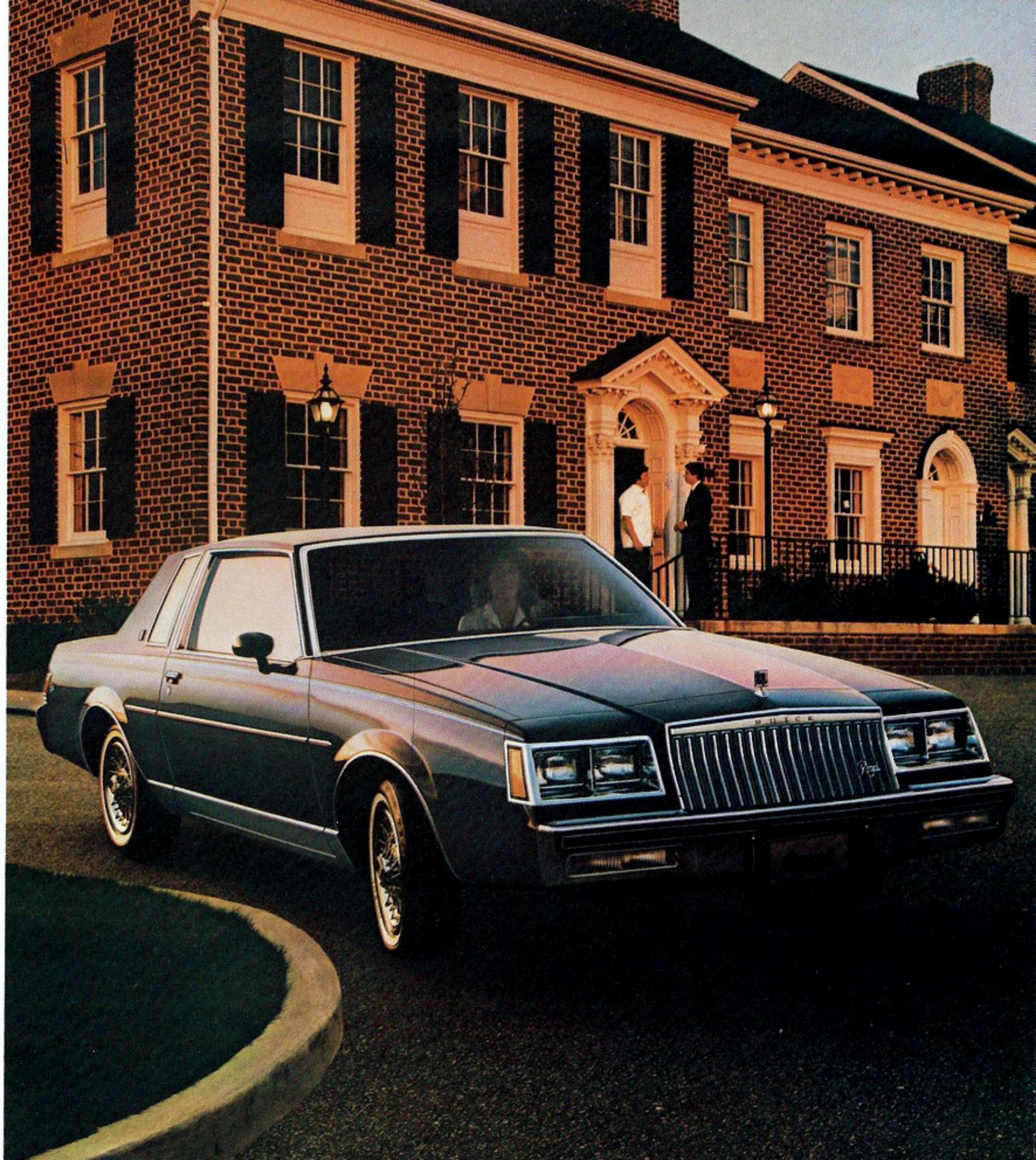
Regal Limited Coupe

1983 Regals promise more of what has made them a continuing favourite. Aerodynamic coupes. Roomy sedans. The just-right balance of formality plus sportiness. A brace of new exterior colours coordinated with new interior choices. Plus a range of available equipment that, depending on the model, includes such diverse items as an astrorooftop or hatch roof, custom locking wire wheelcovers, coach lamps, and a wide range of handsome vinyl roofs.