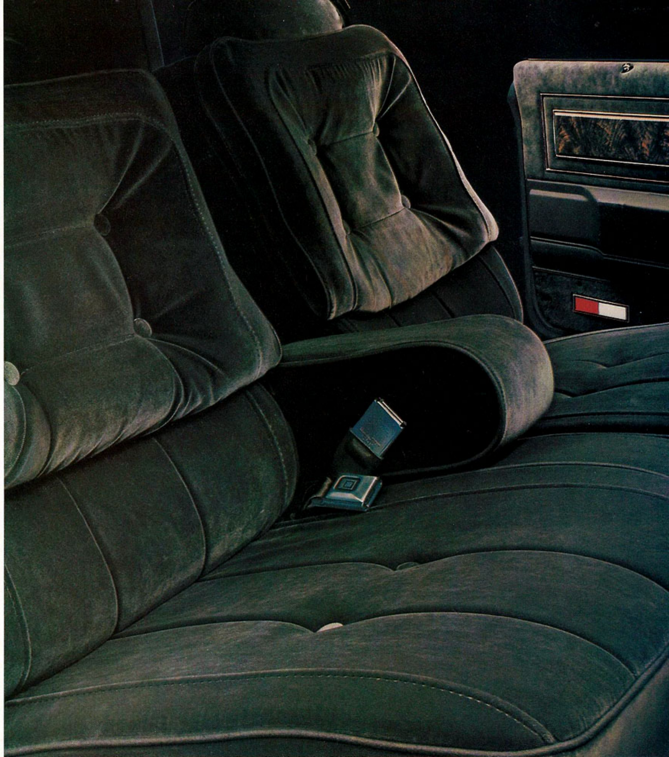
Above—Regal Instrument Panel with Available Equipment Right—Regal Limited Interior

*Not available on Regal Sedan S—standard A—available †Cloth trimmed doors ‡rear seat vinyl