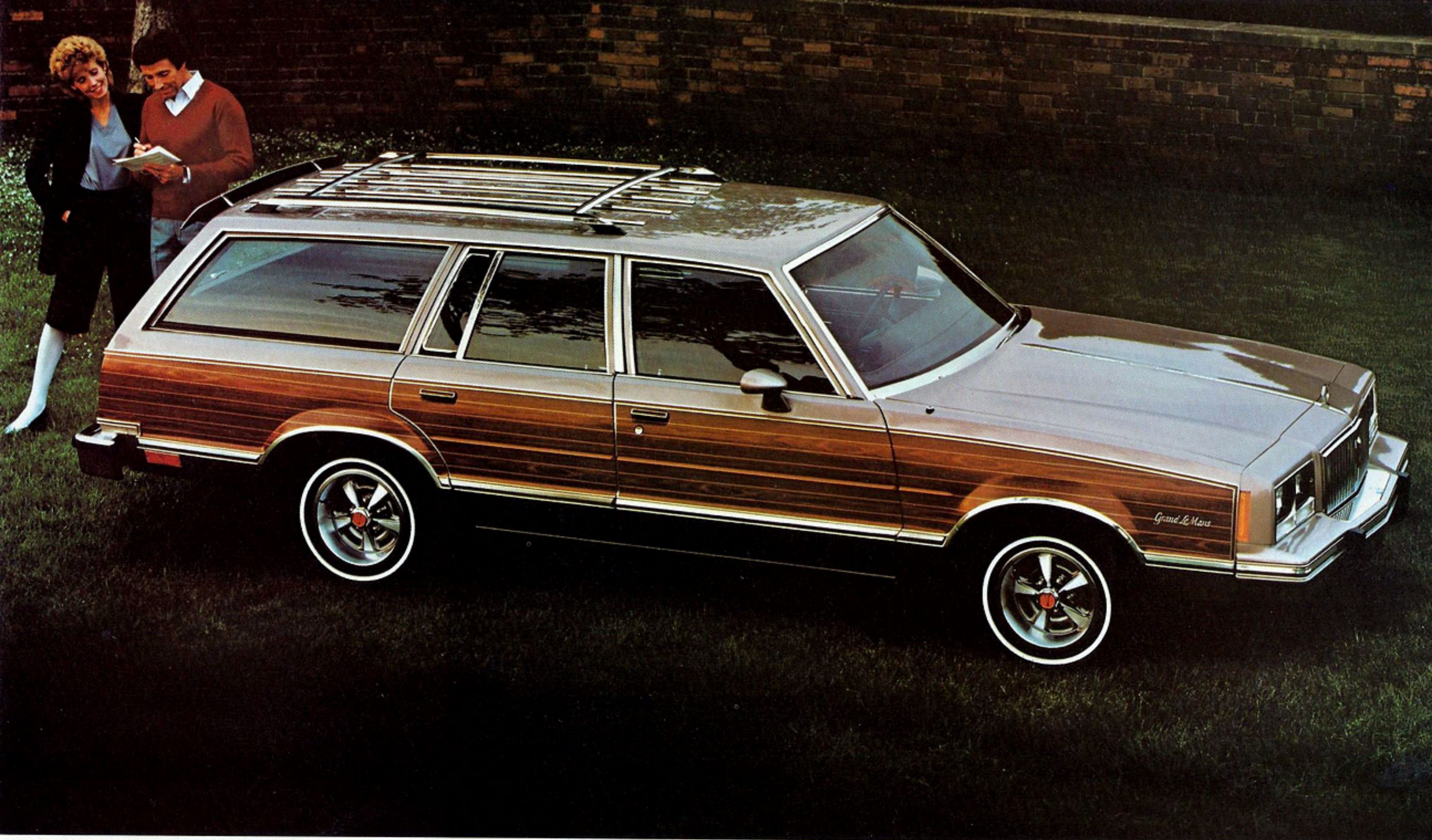
Grand LeMans Wagon.

GRAND LeMANS. Larger families with larger needs will really appreciate our '83 Grand LeMans wagon.