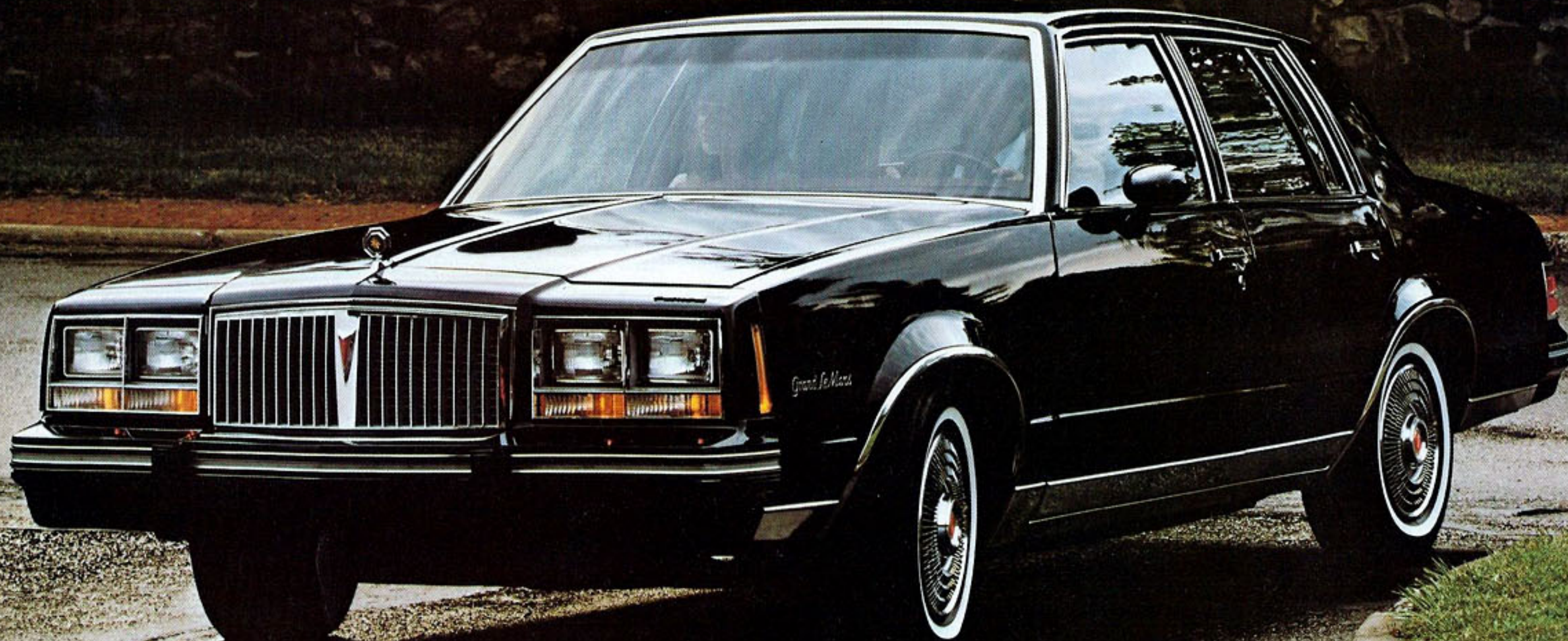
Grand LeMans Sedan.

GRAND LeMANS. Elegant, exciting, affordable. This may seem an unlikely combination of words to describe a luxury car, but actually they're some of the best words to describe the 1983 Grand LeMans Sedan.