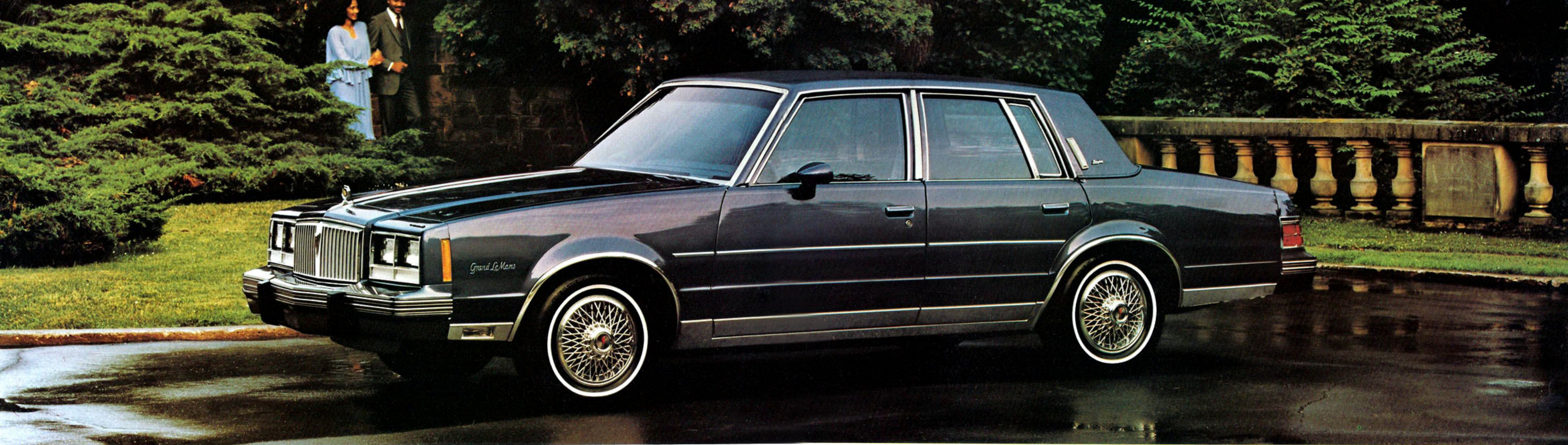
Grand LeMans Brougham Sedan.

People who buy luxury cars for extra comfort, added room and a certain measure of prestige, would probably be satisfied with just about any luxury car.