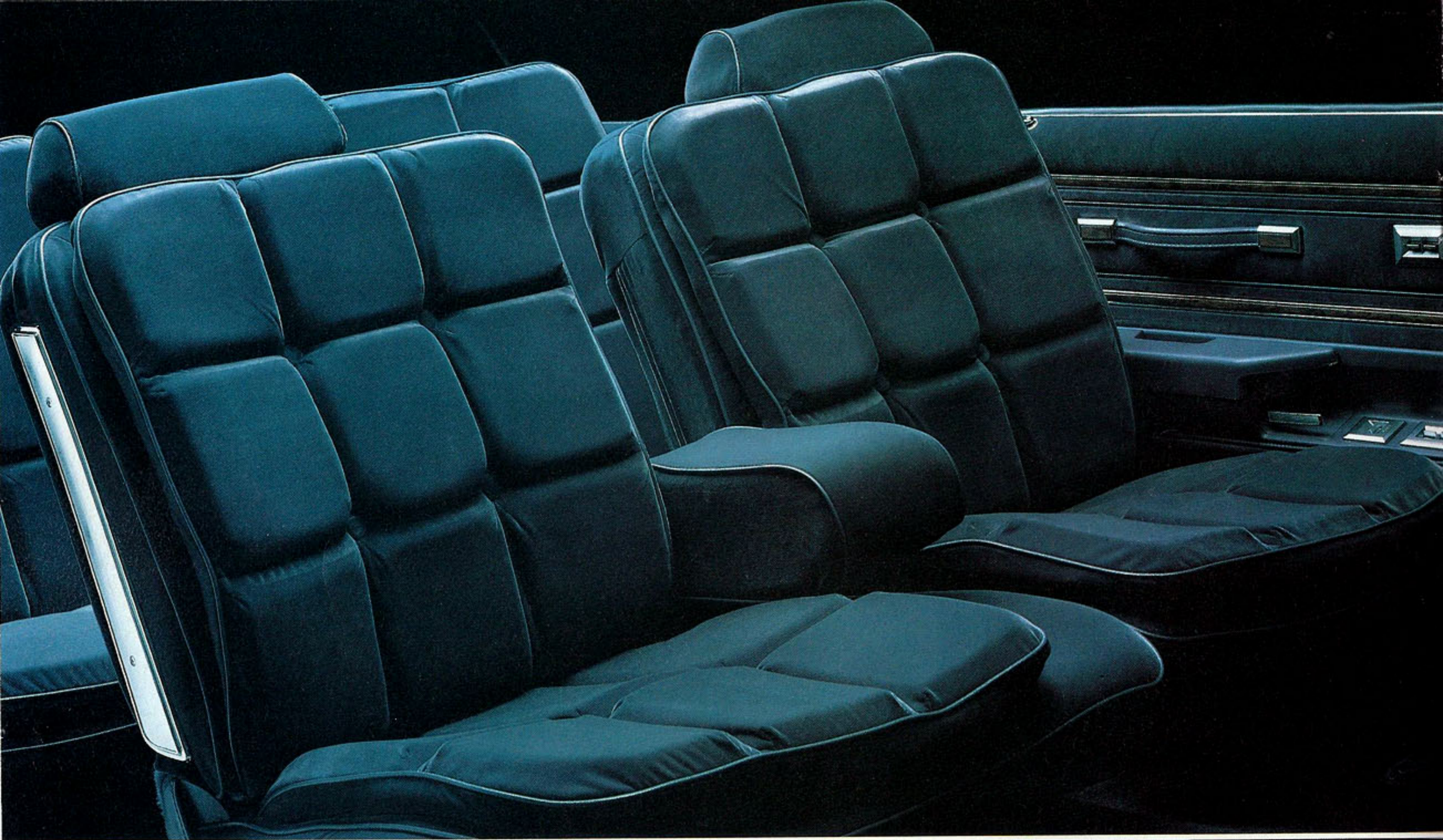
Grand LeMans Brougham Interior.

When you open the door to Grand LeMans Brougham, you open the door to a world of driving comfort that includes luxurious 60/40 split front seats with fold-down centre armrest. You also get thick cut-pile carpeting. Luxury door trim. And subtle chimes to remind you of keys, seatbelts and headlamps. We've put a