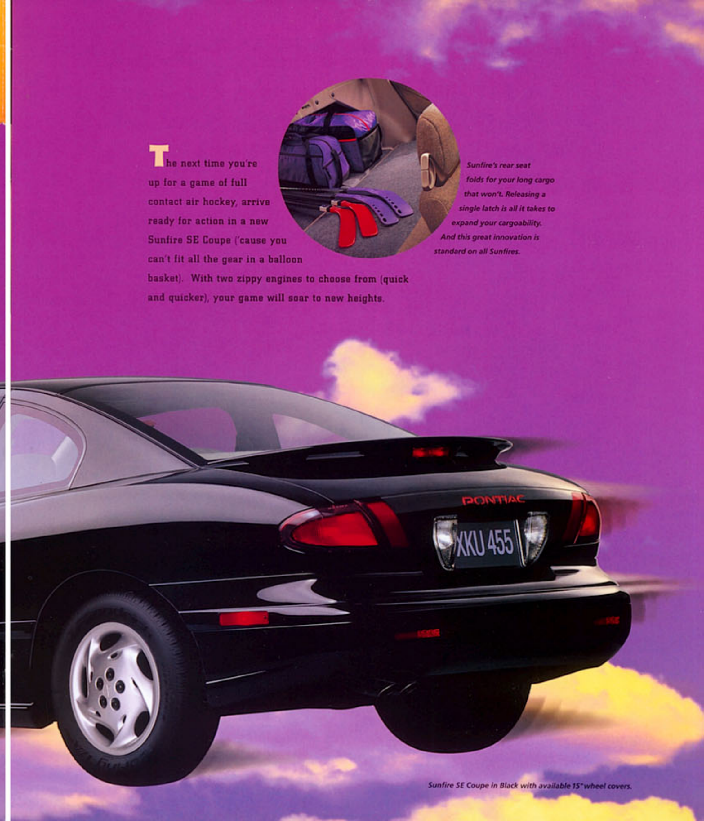
Sunfire SE Coupe in Black with available 15" wheel covers.

Sunfire's rear seat folds for your long cargo that won't. Releasing a single latch is all it takes to expand your cargoability. And this great innovation is standard on all Sunfires.