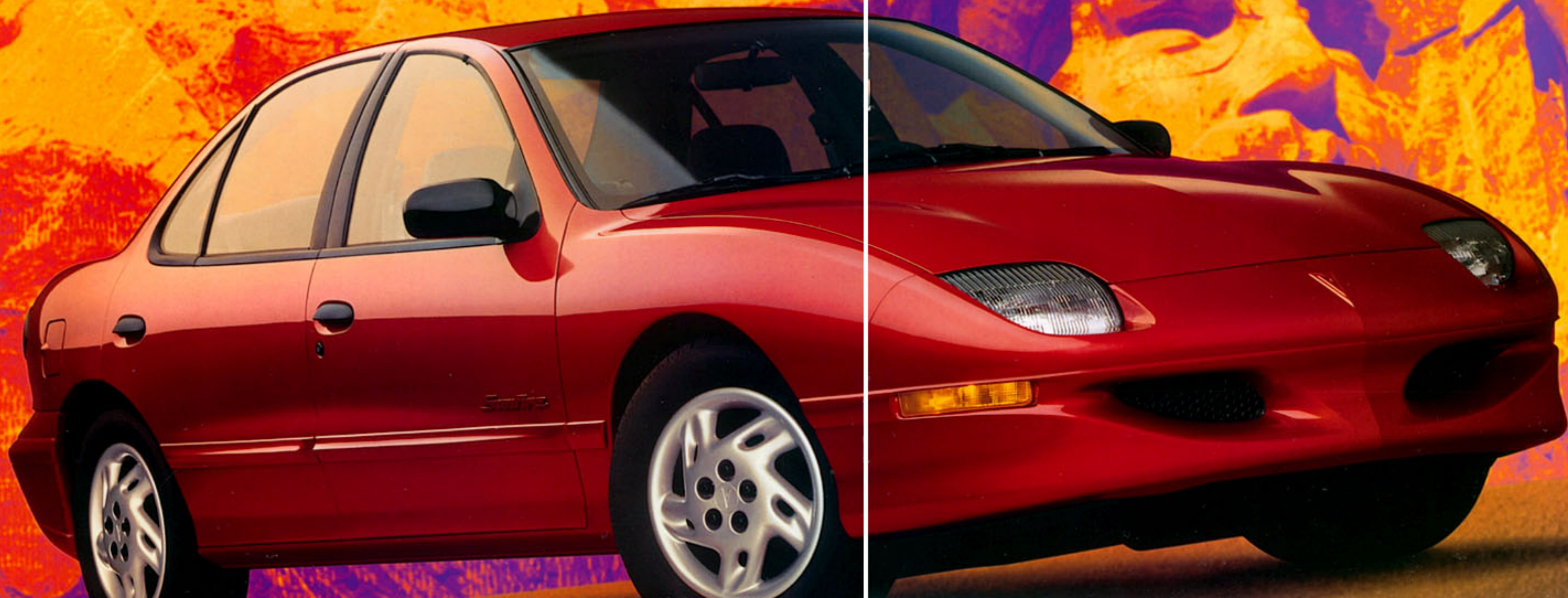
Sunfire SE Sedan in Red-Orange Metallic with available 15" wheel covers.

S ight-seeing is always more fun with a carload of friends...so pack in four of your favorite people and hit the road. Sunfire's monument-sized interior towers over its closest rivals, plus it offers those riding in back cool things like their own heat ducts.