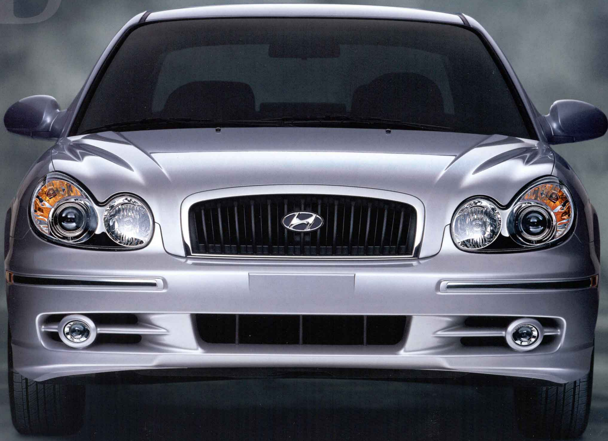
Sonata GLS in Brilliant Silver