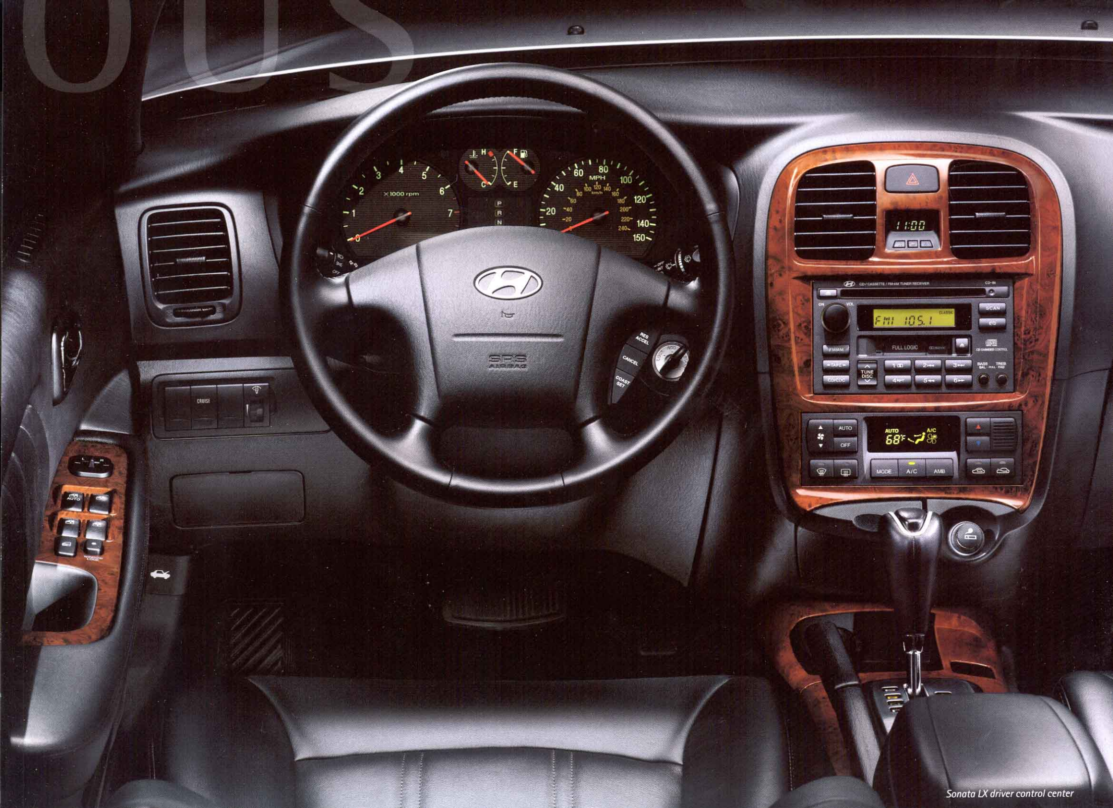
Sonata LX driver control center