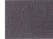
LX Black Leather