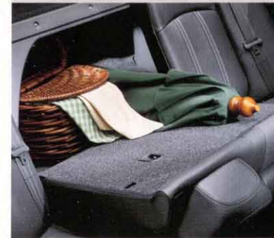
A 60/40 split fold-down rear seatback helps you handle plus-size cargo.