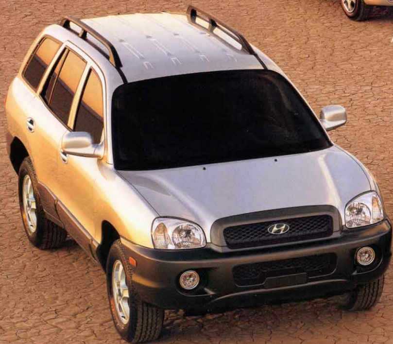
Santa Fe LX