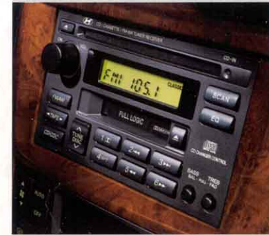
Both the Sonata GLS and LX include a premium AM/FM stereo cassette and CD player with 6 speakers and power antenna.

If you love the new Sonata because of its looks, who can blame you? It is, after all, quite a beautiful car. It's also every bit as appealing inside, with the kind of smart design that makes driving easier and more enjoyable. For instance, Sonata's gauges are set in the driver's natural line of sight for easy readability. Vital controls and switches, right down to the stereo and climate controls, are ergonomically designed and placed. The Sonata's functionality is matched by an impressive array of creature comforts, including power windows with a driver's Auto-down feature, power door locks and mirrors, and a 60/40 split fold-down rear seatback that helps you handle oversize cargo. Dialing things up a notch or two are the Sonata GLS and LX. Both feature a powerful 2.7-liter V6 engine, 4-wheel disc brakes, a premium AM/FM stereo cassette and CD player with 6 speakers, aluminum alloy wheels and woodgrain-trimmed interior. To this, the luxurious Sonata LX adds leather seating surfaces, an automatic climate control system and an 8-way power driver's seat.