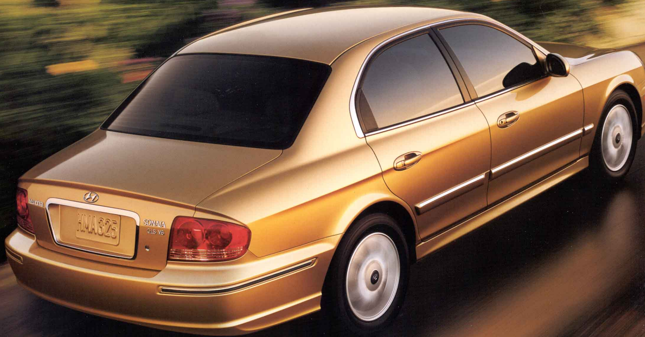
Sonata GLS in Desert Sand