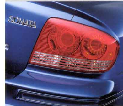
Rear combination taillights are designed to be more than just stylish. They're also highly visible to approaching drivers.

Hyundai Sonata is clearly a mission accomplished.