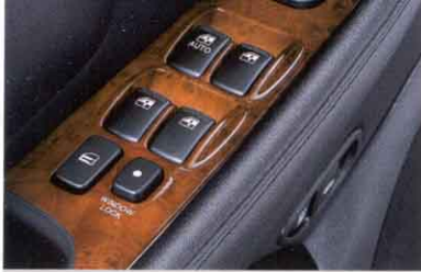
Power windows, door locks and mirrors are standard on all Sonata models.