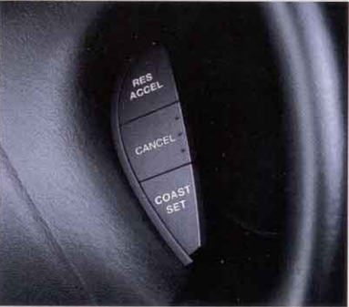
Steering wheel-mounted cruise control switches keep your eyes on the road.