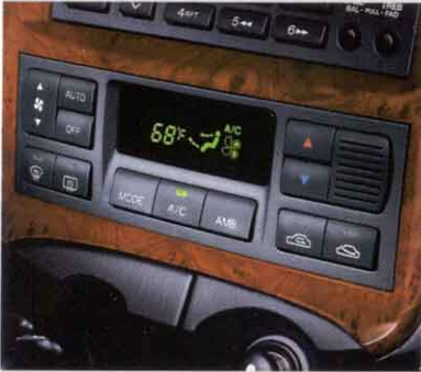
The Sonata LX's automatic climate control system maintains a pre-selected cabin temperature.