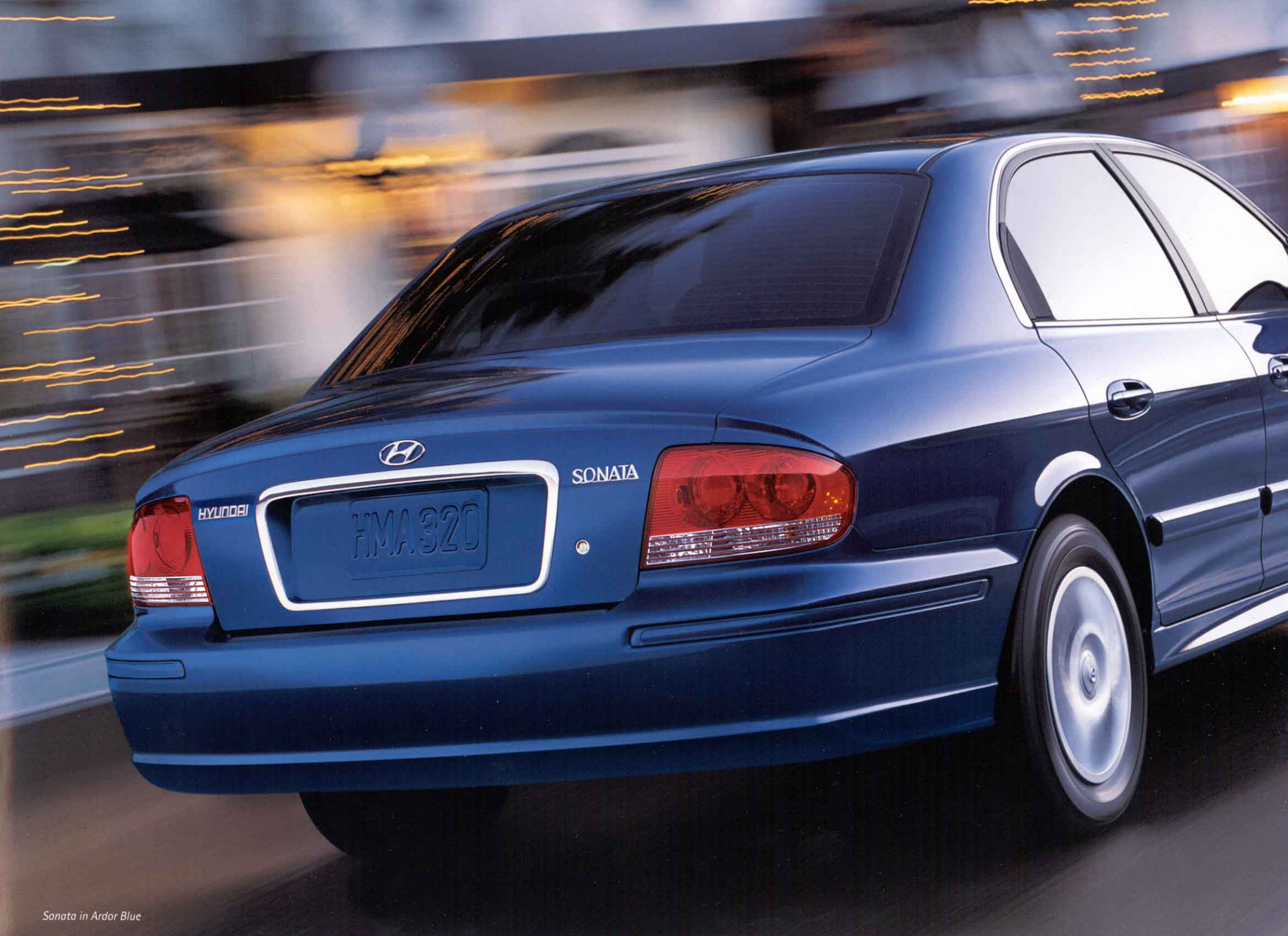
Sonata in Ardor Blue