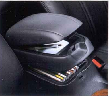
Sonata GLS and LX feature a front center console with a two-level storage compartment.

Chances are you'll be surprised, then delighted by the Sonata's cabin. When it comes to room, safety features and standard amenities,