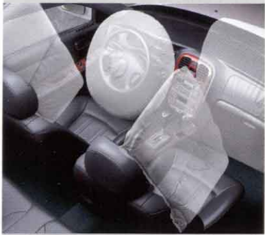
Dual front airbags and front side airbags are standard. The airbag system self-checks at start up to help ensure readiness.