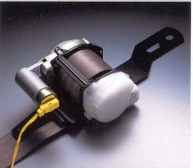
The 3-point front seatbelt pretensioners lock in the event of a moderate to severe frontal impact.

Significantly, some of Sonata's most advanced design is devoted to occupant protection. The cabin is filled with advanced safety features like dual front airbags 1 , front side airbags and front seatbelt pretensioners with force limiters. Sonata's structure is also a vital part of its occupant protection system, enclosing the passenger cabin with steel roof rails and side-impact door beams that protect against collision impacts. For added protection, the body contains energy-absorbing front and rear crumple zones. And since it's best to avoid