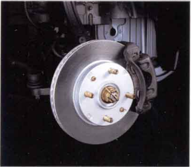
Sonata GLS and LX include 4-wheel disc brakes. An Anti-lock Braking System (ABS) 2 with a Traction Control System (TCS) 3 is available as an option.