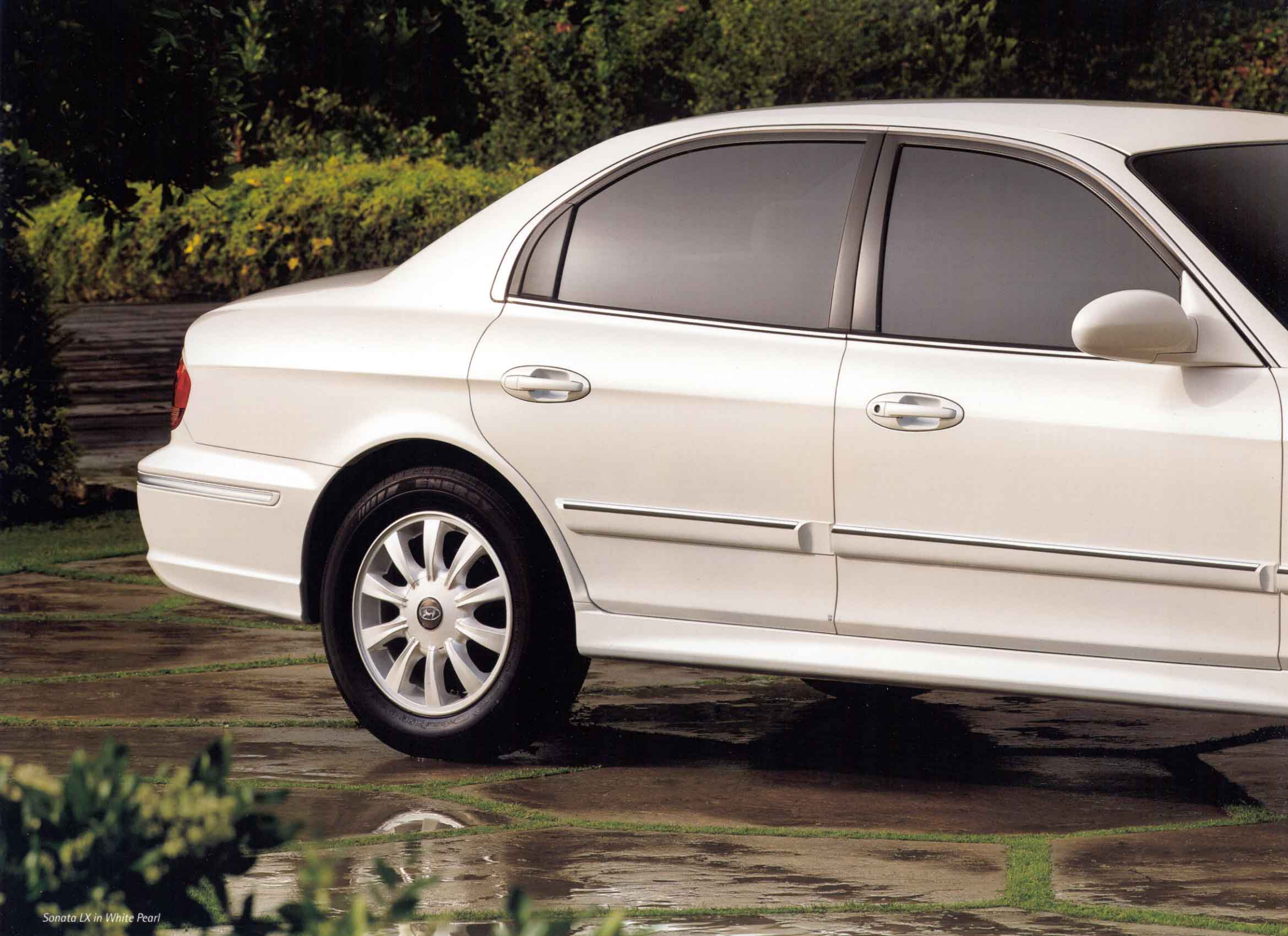
Sonata LX in White Pearl