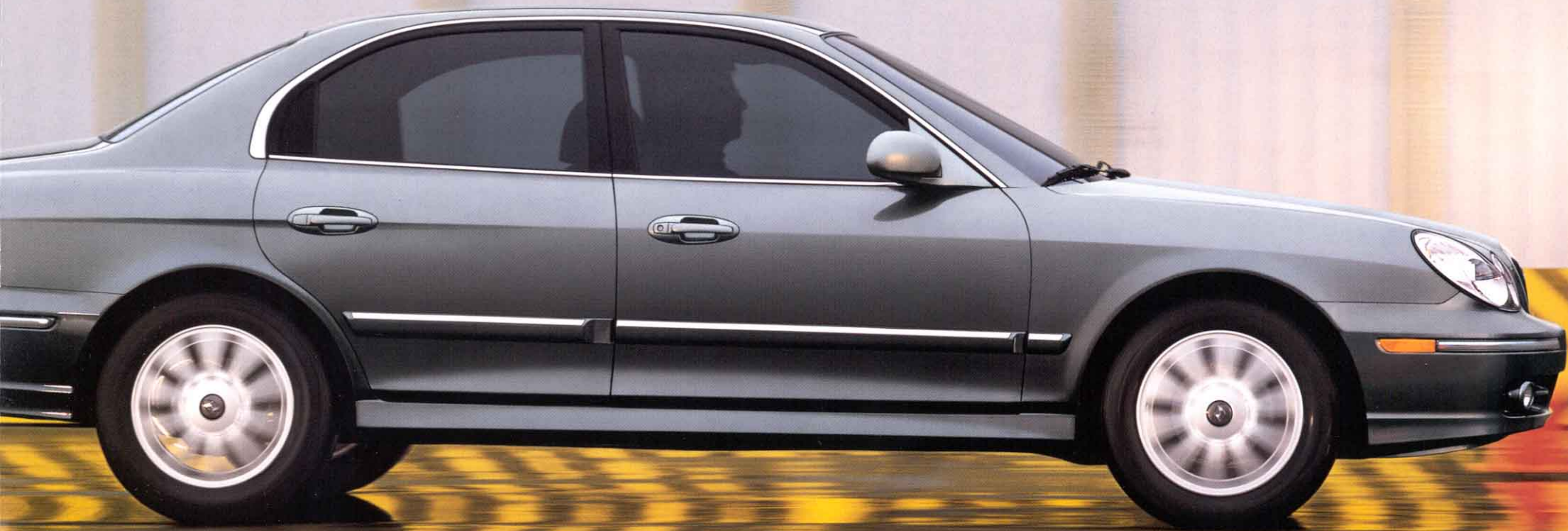
Sonata GLS in Slate Gray