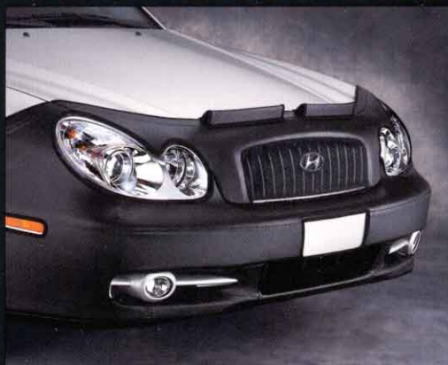
Protect your Sonata's finish with a durable, high-quality front nose mask.

Your Hyundai dealer can show you a full line of genuine Hyundai accessories designed to make driving your Sonata even more enjoyable. To keep your Hyundai looking and running like new, always use genuine Hyundai parts and accessories, which meet our own strict standards for quality and durability.