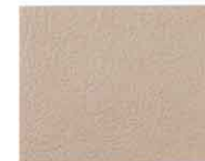
LX Beige Leather