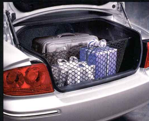
A custom-fitting trunk cargo net keeps important items in place.