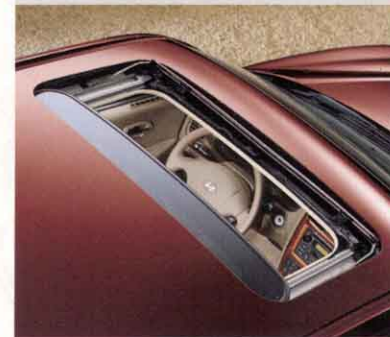
The available power moonroof tilts up or slides back at the touch of a button. An inner sunshade is included.