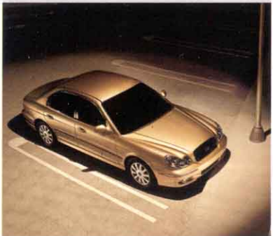
The standard battery saver feature automatically turns headlights off in case you forget to.