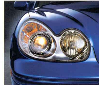
Aerodynamic, projector-type halogen headlights enhance already elegant styling.