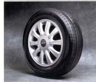
Sporty 16" 10-spoke aluminum alloy wheels and Michelin® touring tires are standard on the Sonata GLS and LX.