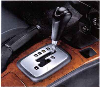
The dual-mode, automatic transmission with SHIFTRONIC™ offers fully automatic or manual sport shifting 1 .