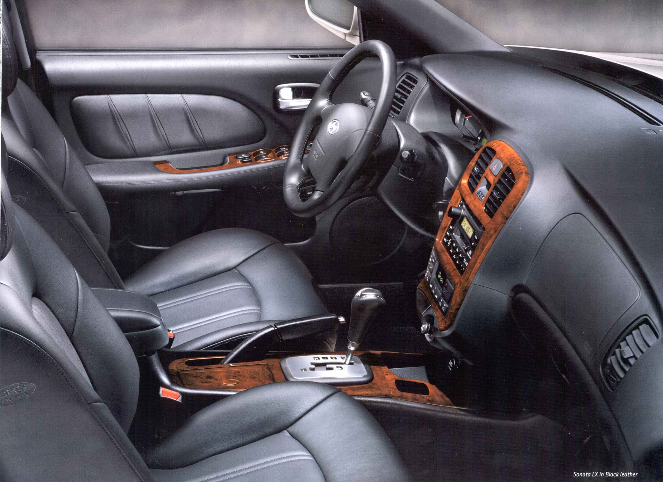
Sonata LX in Black leather