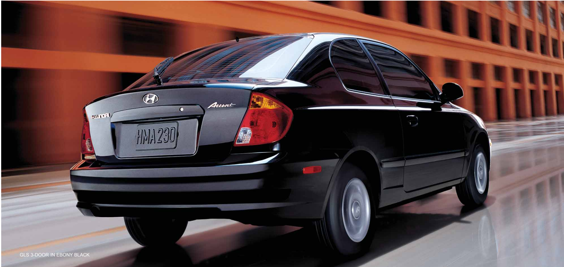
GLS 3-DOOR IN EBONY BLACK