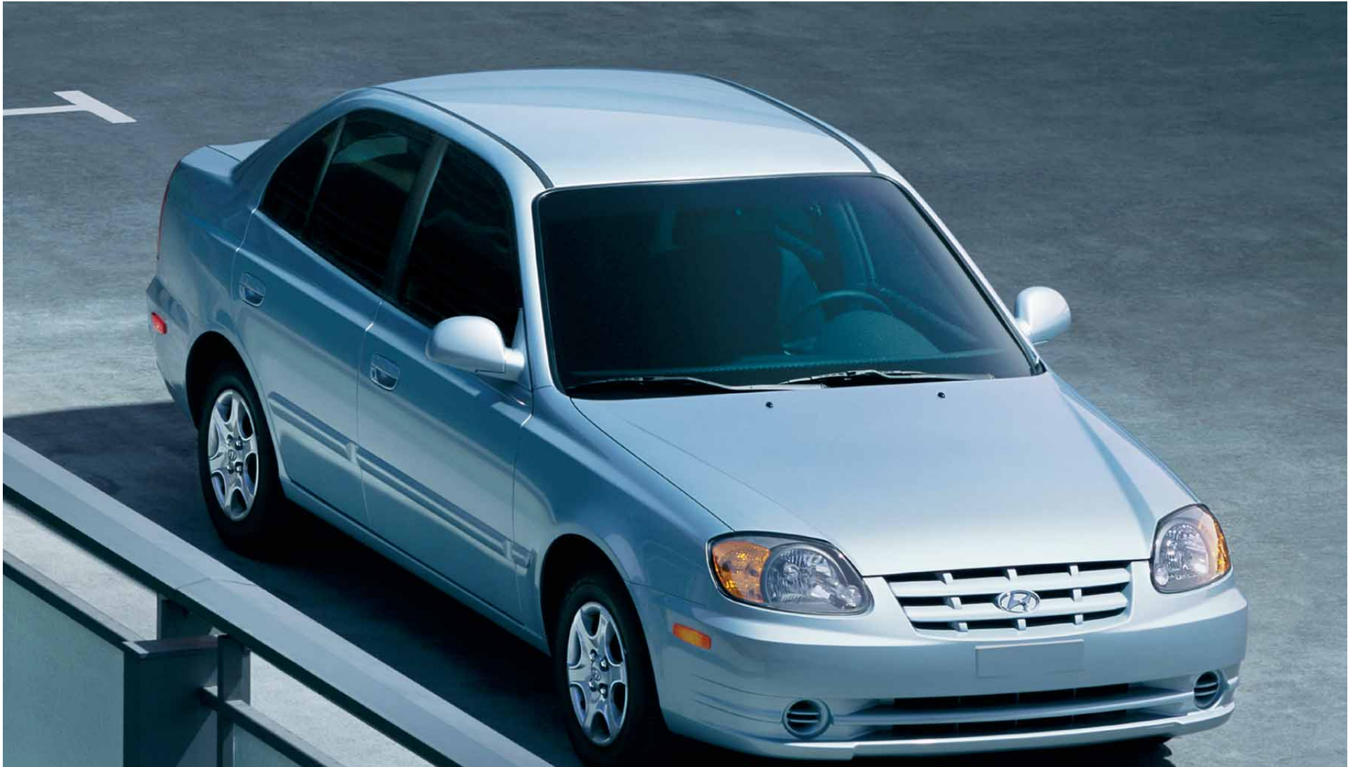
GLS 4-DOOR IN GLACIER BLUE

■ YOU'RE AS GOOD AS THERE. The Accent gets you where you want to go in more ways than one — with style, comfort and money left over to do the things you want. Want a 3-door? 4-door? No problem. The GLS and GT models deliver, along with advanced engineering, numerous standard features and worry-free ownership the competition can only dream about. Now that sounds pretty good.