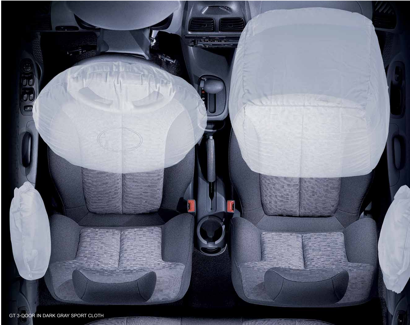
GT 3-DOOR IN DARK GRAY SPORT CLOTH

■ REST ASSURED. While the Accent is impressively economical, it offers a wealth of safety features. Dual front and front side-impact airbags 1 and front and rear crumple zones are standard features. Also standard are front seatbelts with pretensioners and force limiters, and rear child-seat attachment anchors. The Accent's unibody construction is key to its structural integrity and durability.