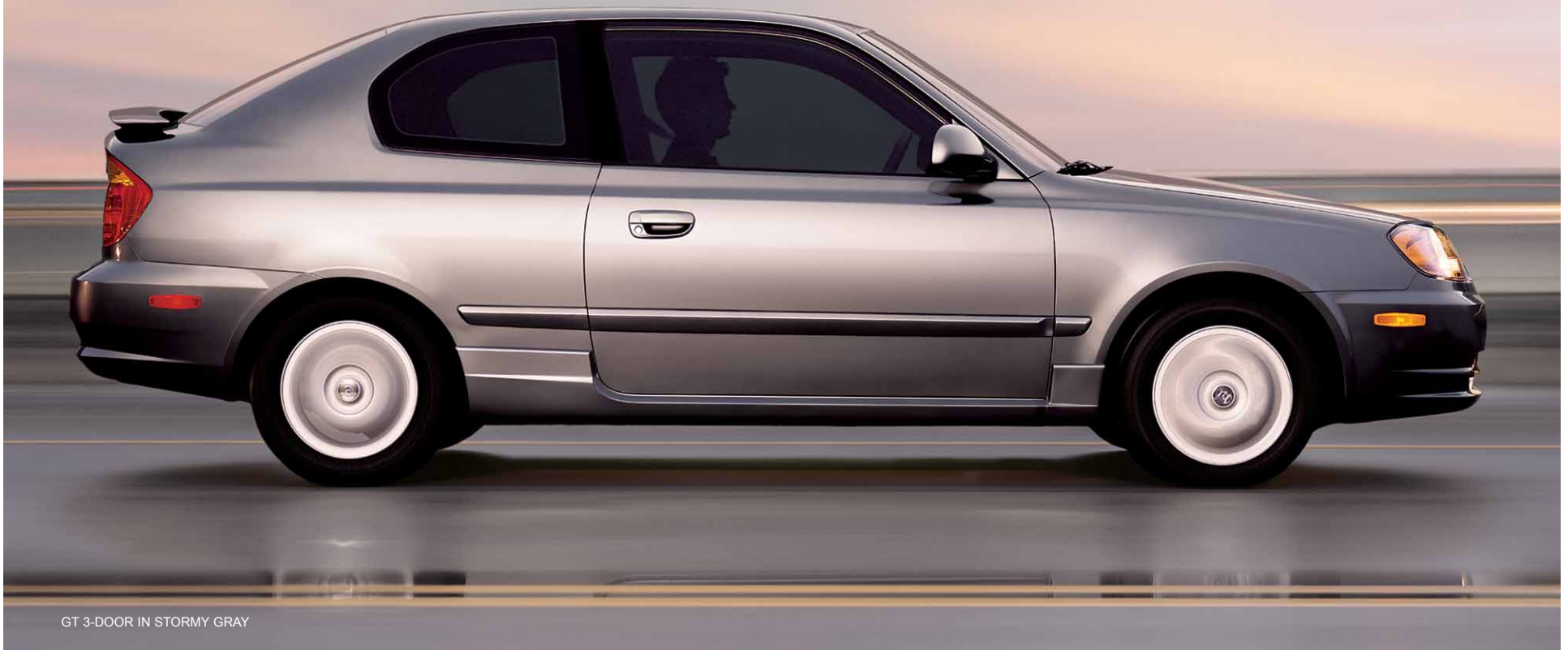
GT 3-DOOR IN STORMY GRAY