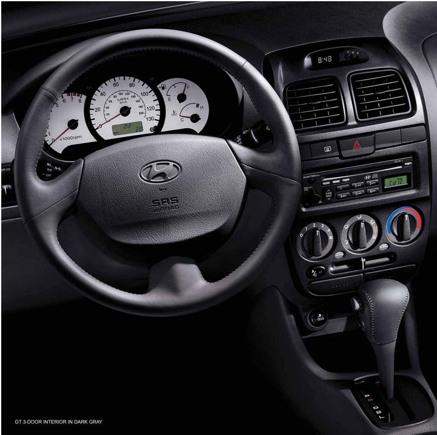
GT 3-DOOR INTERIOR IN DARK GRAY