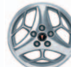
16" cast-aluminum. Standard on 15A and 15B AWD and 15B FWD models.