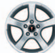
17" five-spoke cast-aluminum. Standard on 15C FWD and AWD; available on 15B FWD and AWD models.