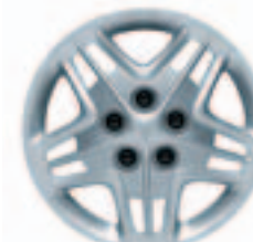
16" steel with a bolt-on cover. Standard on 15A FWD models.