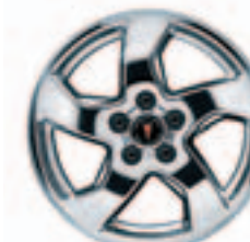
17" Rally-specific chrome-finished aluminum. Available only with the Rally Appearance Package on 15B and 15C FWD and AWD models.