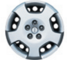
16" steel with bolt-on wheel covers. Standard on G6 6-cylinder.