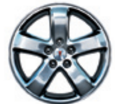
17" Chrome Tech cast-aluminum. Available on GT.