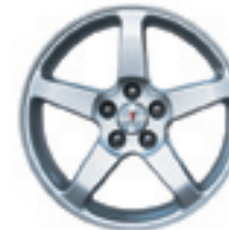
17" painted cast-aluminum. Standard on GT.