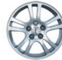
16" painted cast-aluminum. Available on G6 6-cylinder.