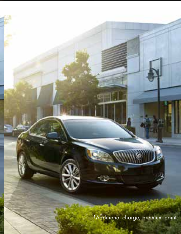
1 Additional charge, premium paint.