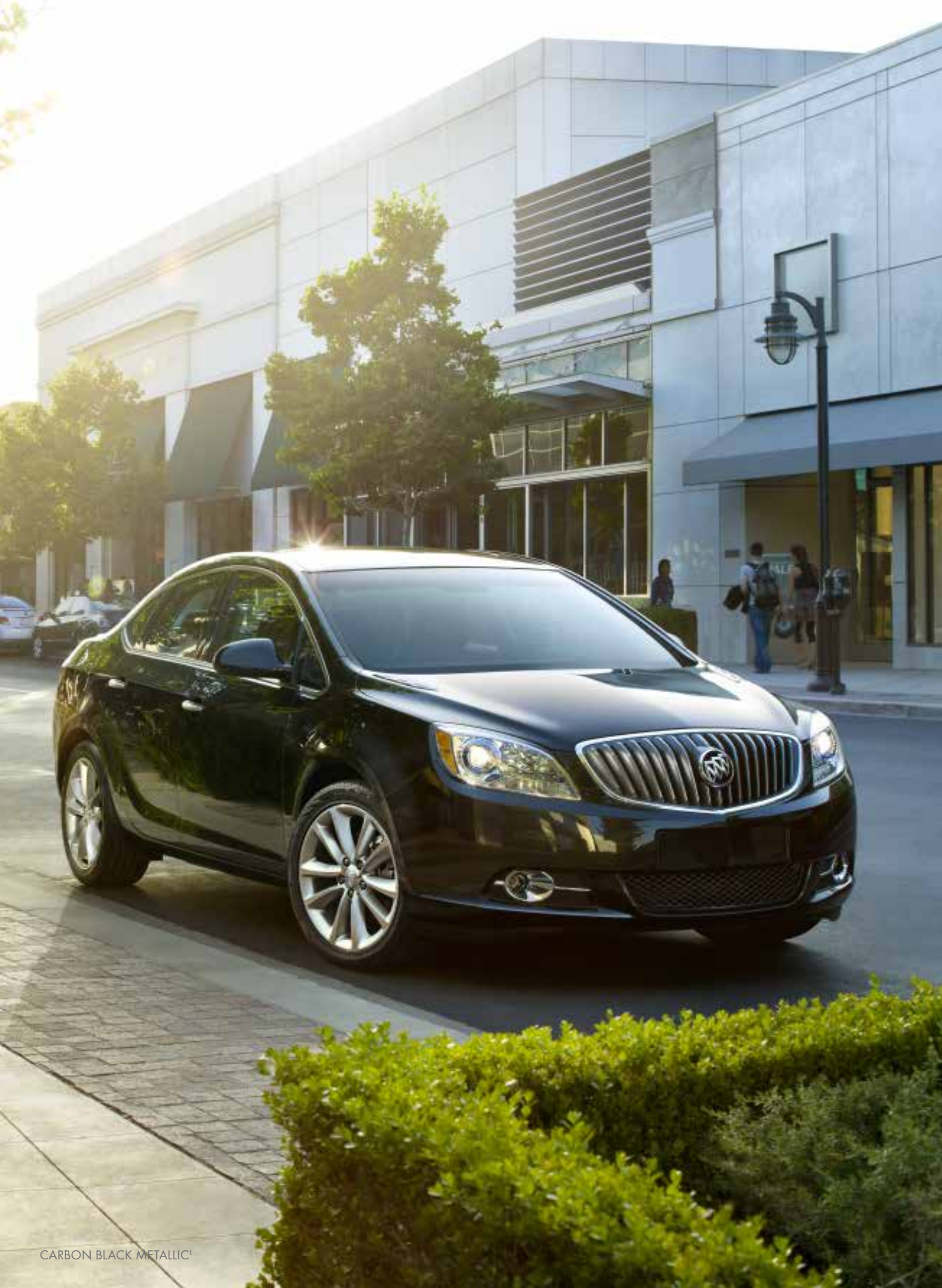
CARBON BLACK METALLIC 1