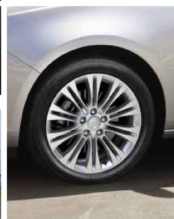
18" SPLIT-SPOKE ALLOY WHEELS WITH MANOOJIAN SILVER PREMIUM FINISH