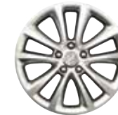
RV1 18" MULTI-SPOKE MACHINED-FACED ALLOY WHEELS WITH POLISHED FACE AND STERLING SILVER FINISHED POCKETS