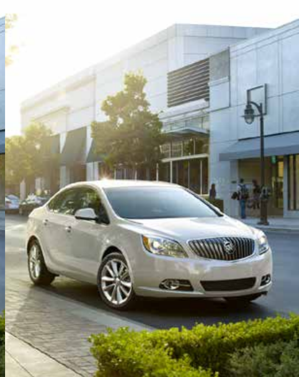
WHITE DIAMOND TRICOAT 1