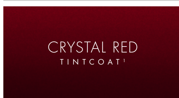
CRYSTAL RED TINTCOAT 1