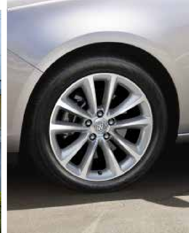
18" MULTI-SPOKE MACHINED-FACED ALLOY WHEELS WITH POLISHED FACE AND STERLING SILVER FINISHED POCKETS