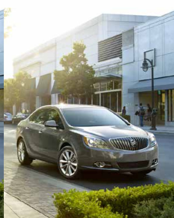
SMOKY GRAY METALLIC