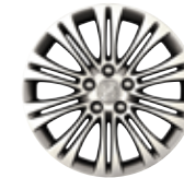
WQN 18" SPLIT-SPOKE ALLOY WHEELS WITH MANOOAGIAN SILVER PREMIUM FINISH