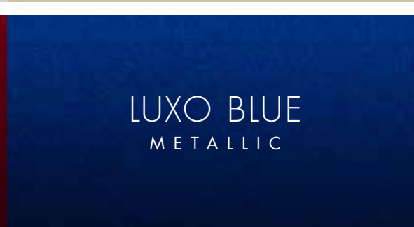
LUXO BLUE METALLIC