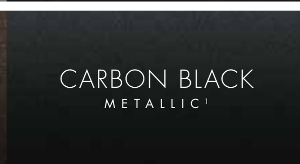
CARBON BLACK METALLIC 1