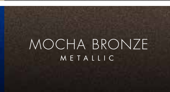
MOCHA BRONZE METALLIC