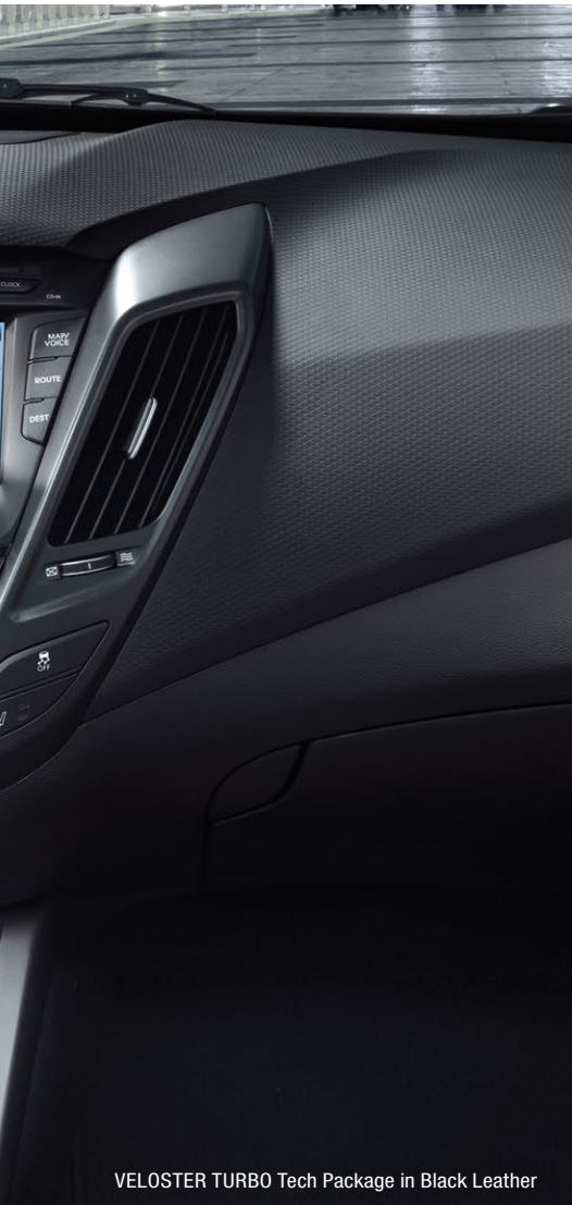
VELOSTER TURBO Tech Package in Black Leather