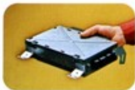
On-board computer for EFI.

Seville was designed for few required maintenance operations. And there are over 1,600 Cadillac dealers across the U.S.—with trained technicians and parts readily available.