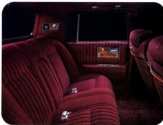
Dover Cloth in Claret

Seville is engineered to be a delight to drive—in the city and on the highway. Its agility is due in part to its trim, 114.3" wheelbase. However, many factors contribute to Seville's ease of handling. There's Variable Ratio Power Steering for easy parking, while retaining a feel of the road. Front and rear stabilizer bars to help reduce body roll during cornering. Standard 15" steel-belted