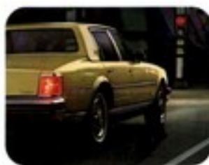
Four-wheel disc brakes.

Few cars in so short a period of time have so captured the imagination of the motoring public as this car. In fact, Seville is meeting the needs of more and more particular people—making it one of the most successful new luxury cars of this, or any other decade.