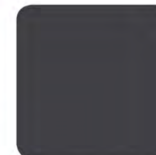
Graphite Gray Metallic