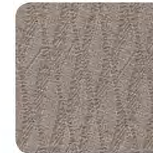
Warm Ivory Cloth (WIC)