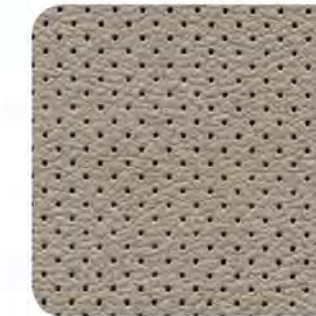
Warm Ivory Leather (WIL)