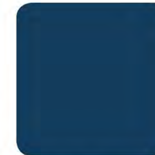
Azurite Blue Pearl