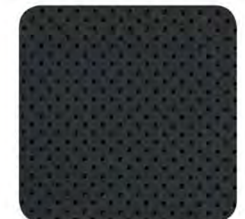
Off-Black Leather (OBL)