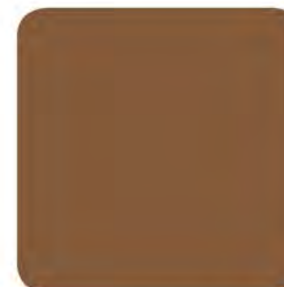
Caramel Bronze Pearl