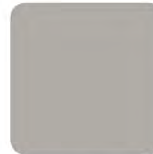
Steel Silver Metallic