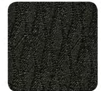
Off-Black Cloth (OBC)