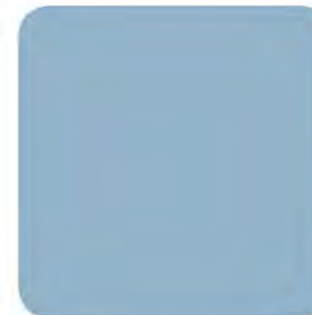
Sky Blue Metallic