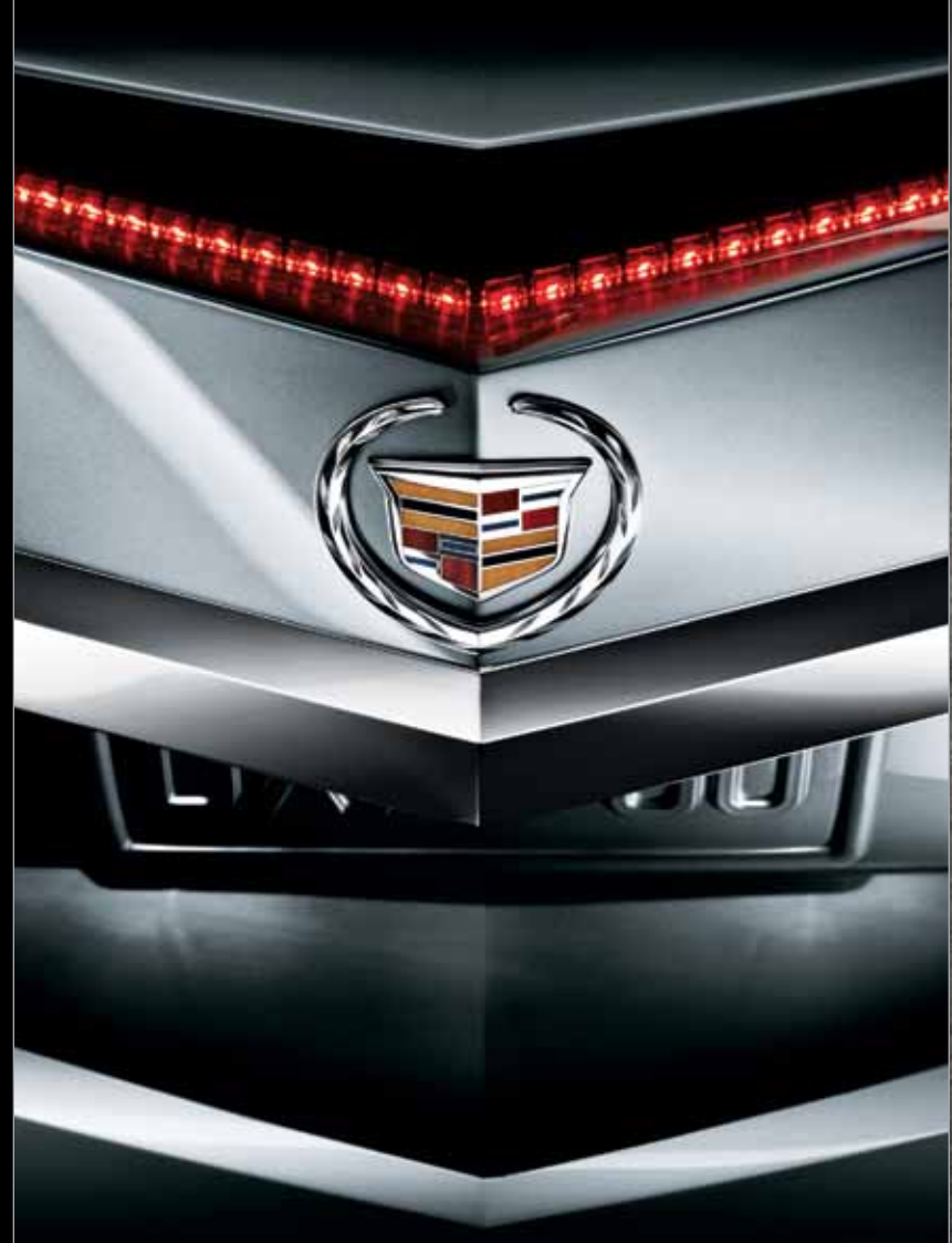
STOP LAMP? SPOILER? BOTH.

Who says one brilliantly engineered component can't do the work of two? The integrated center brake light ingeniously doubles as a spoiler to reduce lift at high speeds.