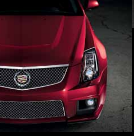
CTS-V POWER DOME HOOD