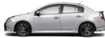
SE-R: BUILT READY TO PERFORM