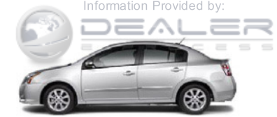
2.0 SL: FEATURE-PACKED AND READY