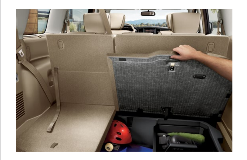
All seats up. Seven on board and you still have room for gear. The permanent storage well has two separate lids. You can keep a flat cargo floor on one side, and leave the other lid open to carry taller things. Accessory Cargo Organizer shown.

In Quest, not only does the second row fold flat, forward, and out of the way, so does the third. So unlike other minivans, instead of stowing seats, the cargo well behind the third row is a permanent place to put whatever you like, eliminating the need to ever empty it out.