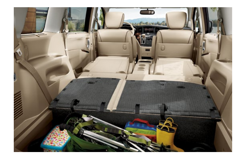
All seats down. Go full cargo mode, while Quest's practical and permanent rear storage well is always at the ready.