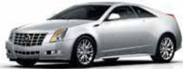
RADIANT SILVER METALLIC

A meticulous 3-layer process that results in a dramatic hue-shifting color.