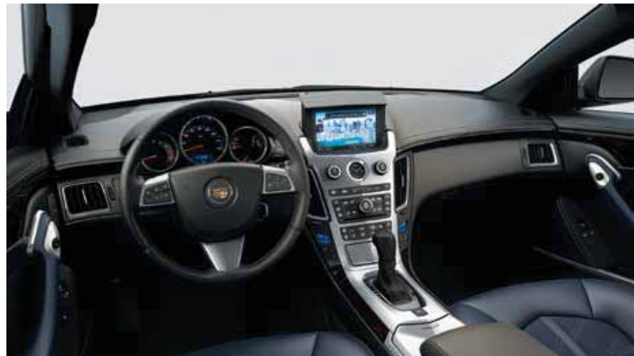
CTS COUPE with Sport Blue Interior Package / Twilight Blue Seats with Twilight Blue sueded inserts