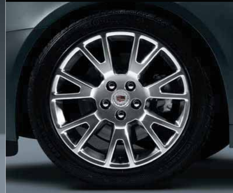
AVAILABLE POLISHED ALUMINUM WHEELS