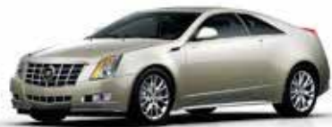
SILVER COAST METALLIC