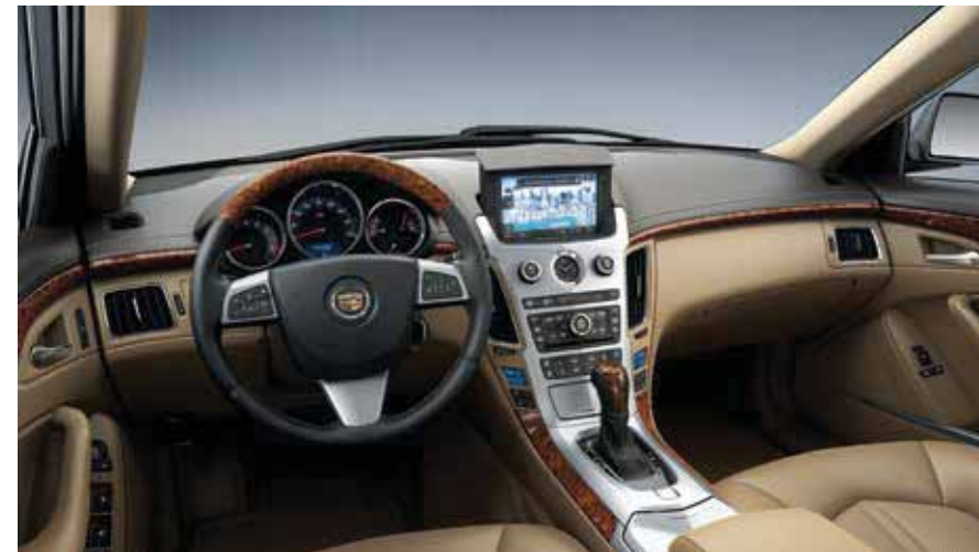
CTS SPORT WAGON / Cashmere seats with Cashmere inserts 2