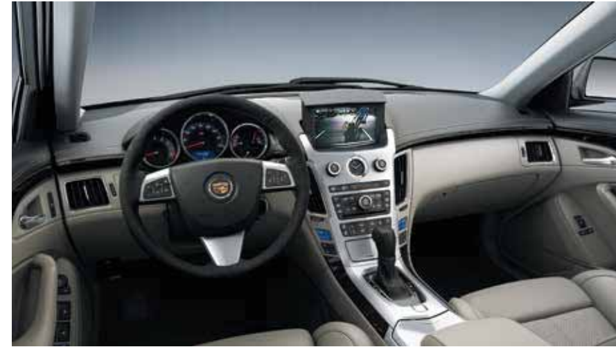
CTS SPORT WAGON with Touring Package / Light Titanium Seats with Light Titanium sueded inserts 2