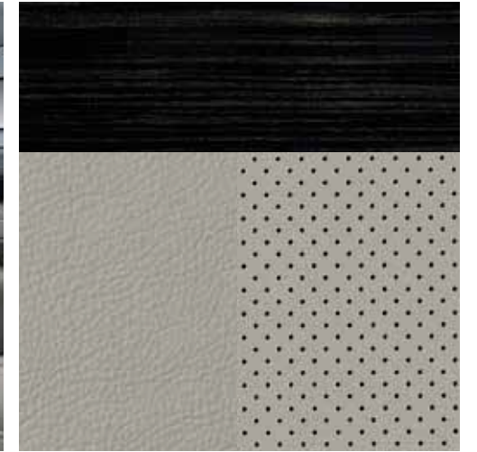
Midnight Sapele Wood Trim