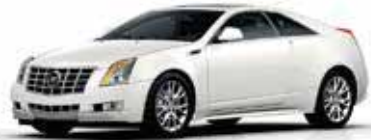
WHITE DIAMOND TRICOAT 1