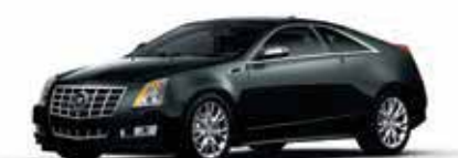
PHANTOM GRAY METALLIC