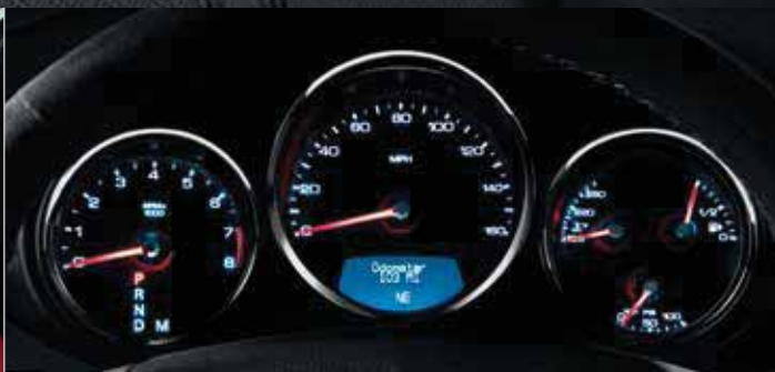
MOTORCYCLE-INSPIRED HIGH-PERFORMANCE GAUGES

Every stitch, examined. Every finish, closely appraised. Even the lighting was addressed with a keen eye. Because when you demand more from an interior, it shows. Hand-craftsmanship with cut-and-sewn features comes alive with the warm glow of the available LED ambient lighting. Polished metal accents, available Sapele wood trim and elegant French stitching on the available leather seating surfaces provide a refined touch. Further enhance your surroundings by adding heated and ventilated front seats. An optional 10-speaker Bose® Cabin Surround® sound system strikes the perfect chord; additional available features include a Rear Vision Camera and Side Blind Zone Alert 1 to help keep you aware of hazards you might not see—proving once and for all, it's the details within the details that set the CTS apart.