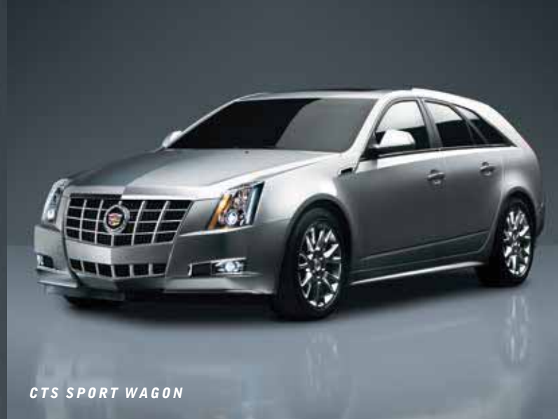
CTS SPORT WAGON

What happens when you give automotive designers carte blanche? You get a car that questions everything. First glance tells you this is the case. The CTS possesses an angular silhouette that expresses a singular philosophy untouched by the competition. Where creased sheet metal gives way to a nearly perfectly balanced Rear-Wheel Drive chassis, revealing its intent as you take every corner. And, whether you choose a coupe, wagon or potent V-Series model, each is engineered to deliver a level of exhilarating performance that is nothing short of world-class. Proof that not following anybody is how you become a leader.