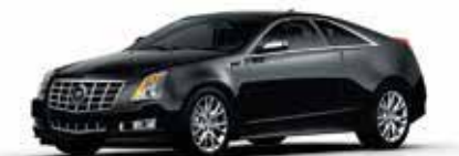
BLACK DIAMOND TRICOAT 1