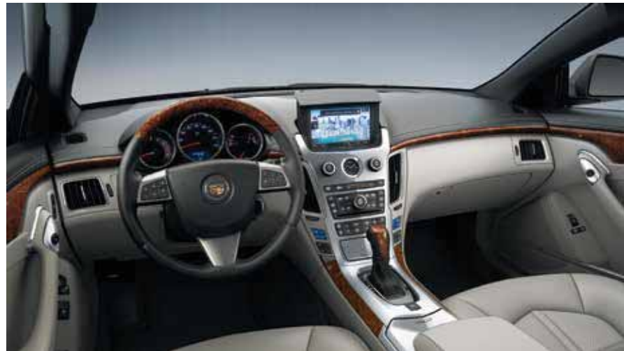
CTS COUPE / Light Titanium seats with Light Titanium inserts 1