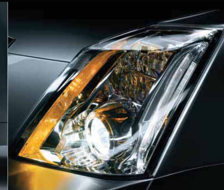
HID HEADLAMPS WITH ADAPTIVE FORWARD LIGHTING