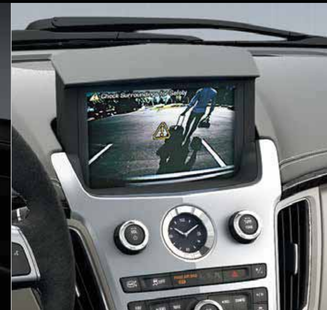
REAR VISION CAMERA

Luxury steps to the forefront in this artfully bold Collection. Standard on the Sport Wagon, the Luxury Collection begins with soft-touch leather seating surfaces. The heated front seats are further refined with 10-way power-adjustability that includes memory presets for two drivers. Exotic Sapele wood trim is accented by the glow of warm ambient lighting that traces throughout the cabin. The Bose® sound system with SiriusXM Satellite Radio 1 delivers excellent sound quality. And features like Rainsense wipers and a Rear Vision Camera not only add convenience, but also help to enhance safety. It's an exceptional Collection, all set in motion by a smooth 3.0L direct-injection V6 engine with 270 HP.