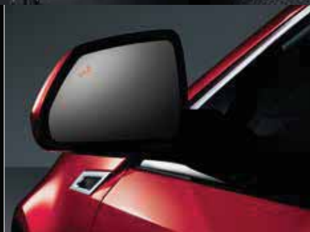
AVAILABLE SIDE BLIND ZONE ALERT