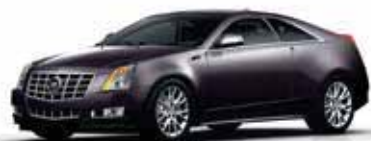
MAJESTIC PLUM METALLIC 1