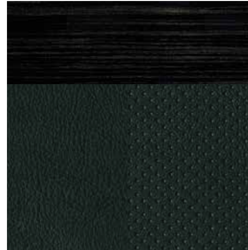
Midnight Sapele Wood Trim