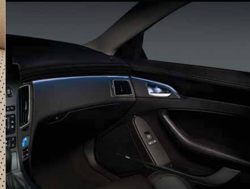
AMBIENT INTERIOR LIGHTING

Luxury extends to every detail. French stitching on the leather seating surfaces, door trim and instrument panel top pad is highlighted by Sapele wood trim with a warm, lustrous finish. Combined, they add a touch of sophistication and understated elegance.