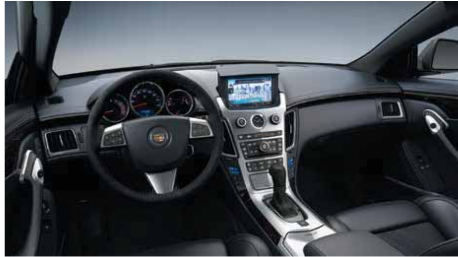
CTS COUPE with Touring Package / Ebony seats with Ebony sueded inserts 1