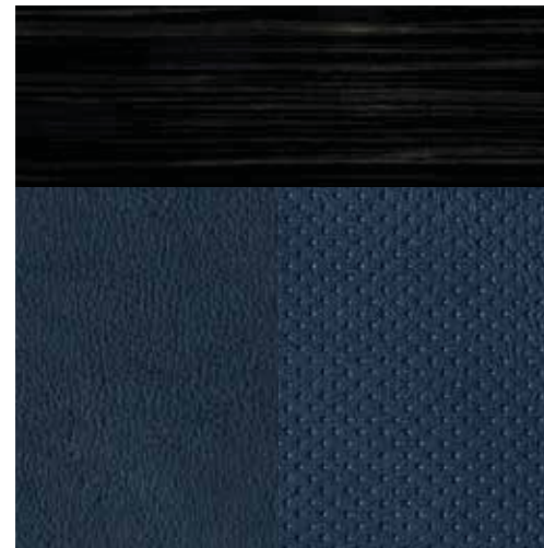
Midnight Sapele Wood Trim