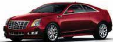
RED OBSESSION TINTCOAT 1