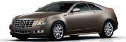
MOCHA STEEL METALLIC 2