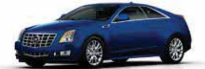
OPULENT BLUE METALLIC