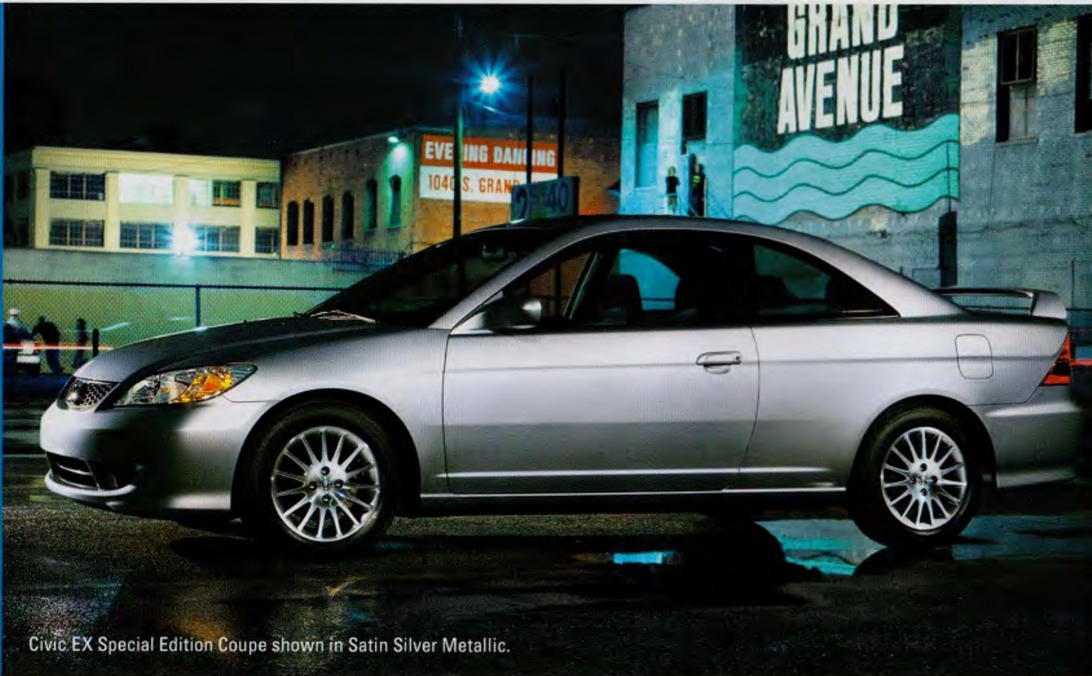
Civic EX Special Edition Coupe shown in Satin Silver Metallic.