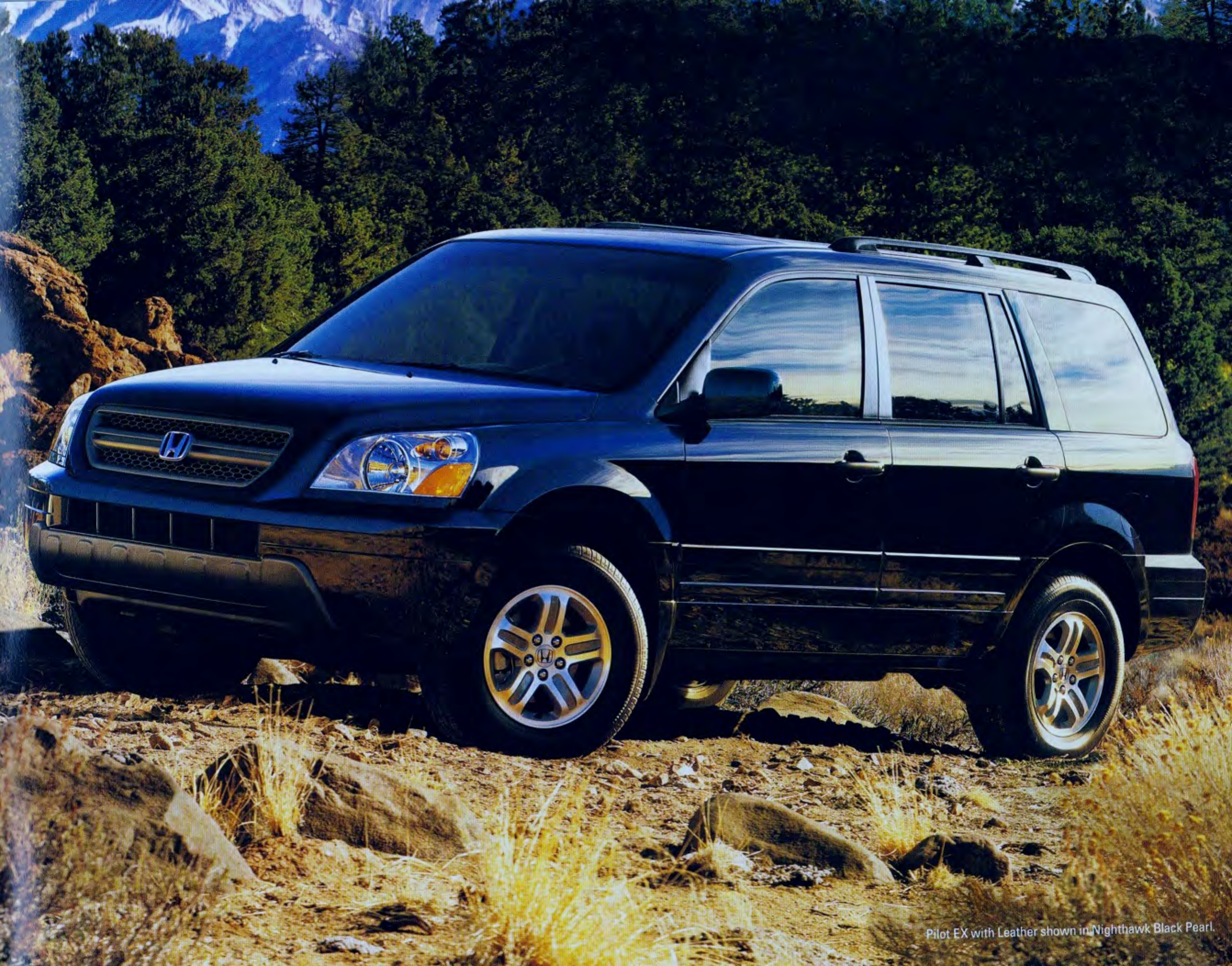
Pilot EX with Leather shown in Nighthawk Black Pearl.