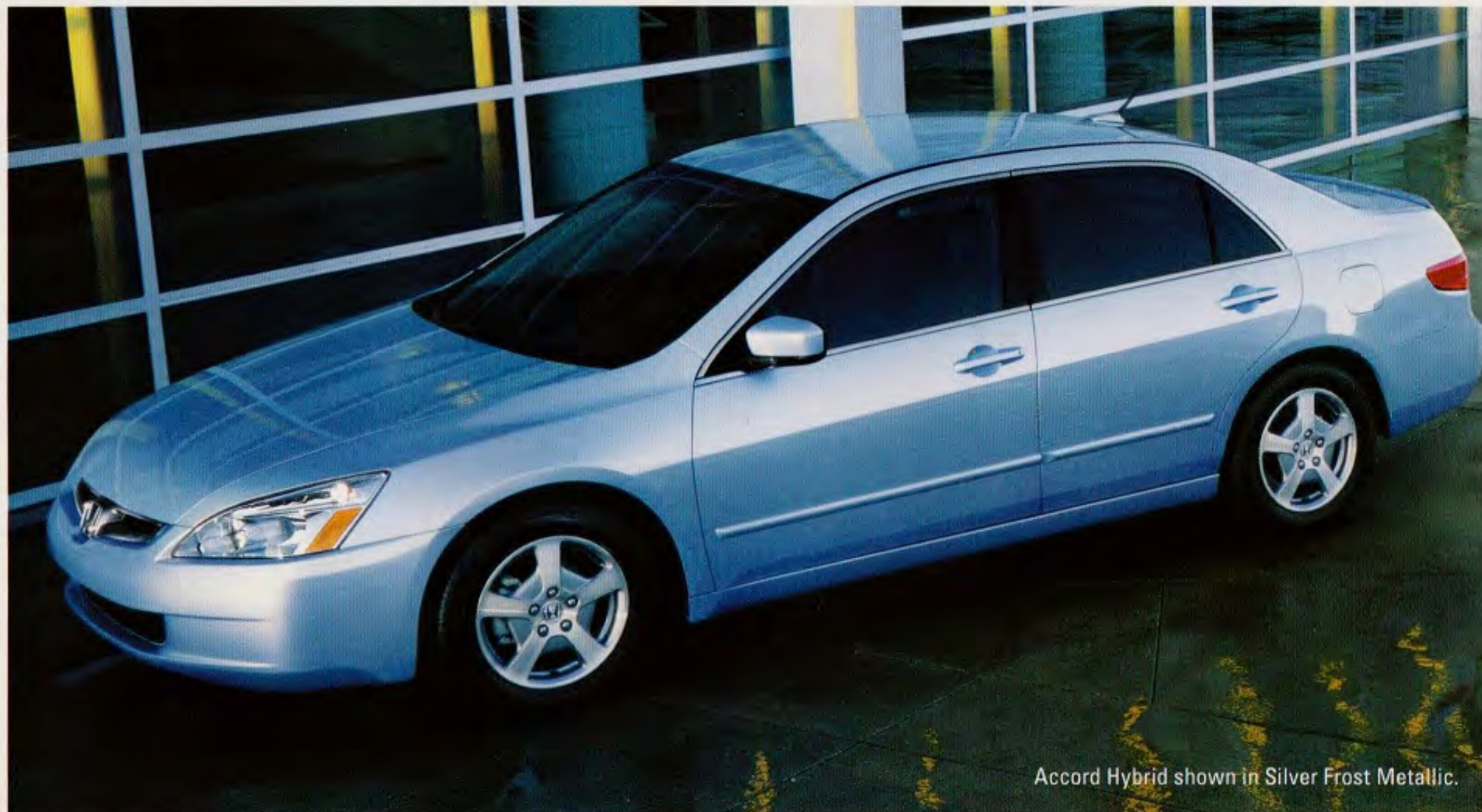
Accord Hybrid shown in Silver Frost Metallic.

5-Speed Automatic Transmission (City/Highway): 29/37 Fuel (gal.): 17.1