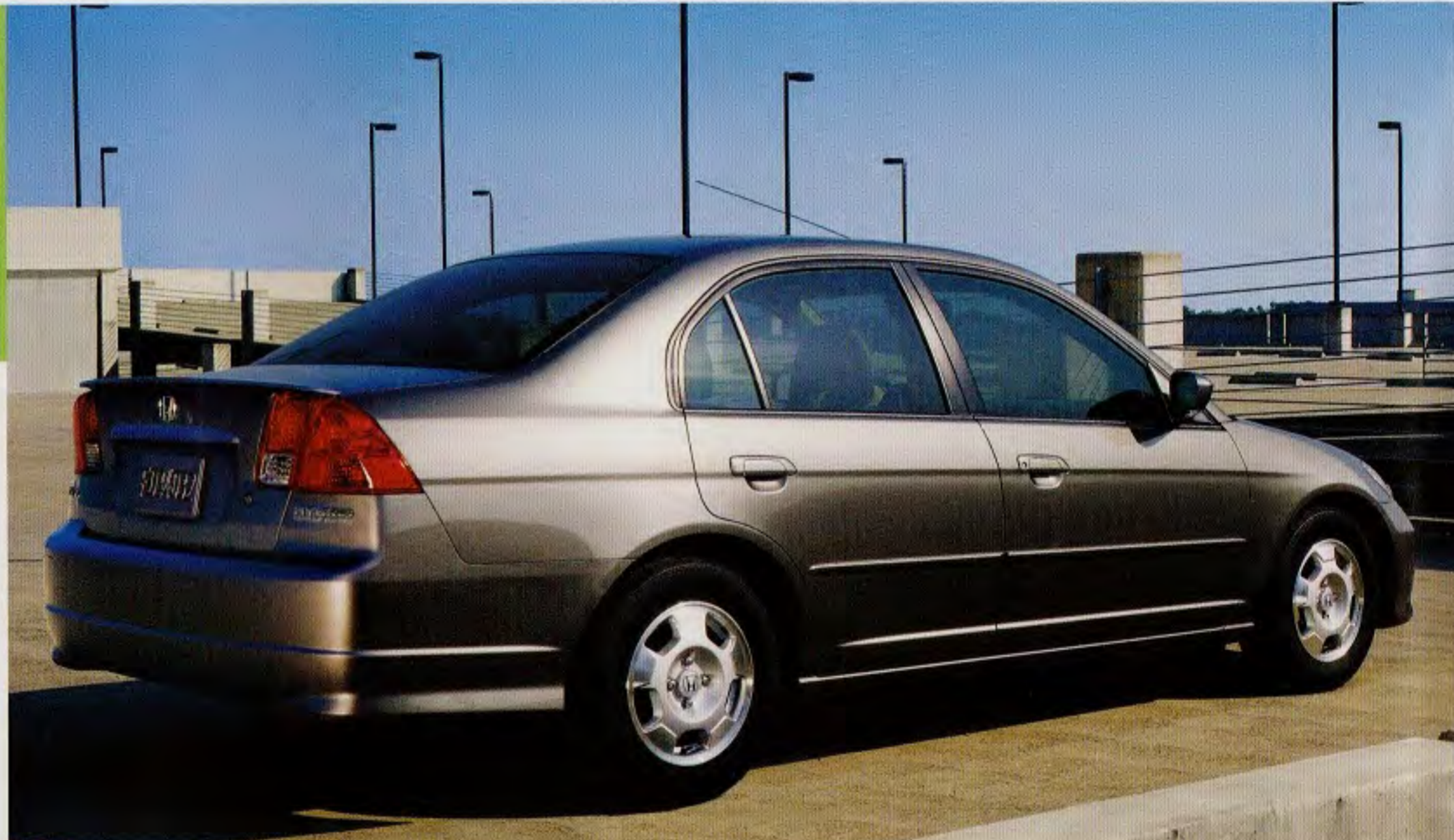
Civic Hybrid shown in Magnesium Metallic.

5-Speed MT (City/Highway): 46/51 (ULEV), 45/51 (AT-PZEV) CVT (City/Highway): 48/47 (ULEV), 47/48 (AT-PZEV) Fuel (gal., ULEV/AT-PZEV): 13.2/11.9