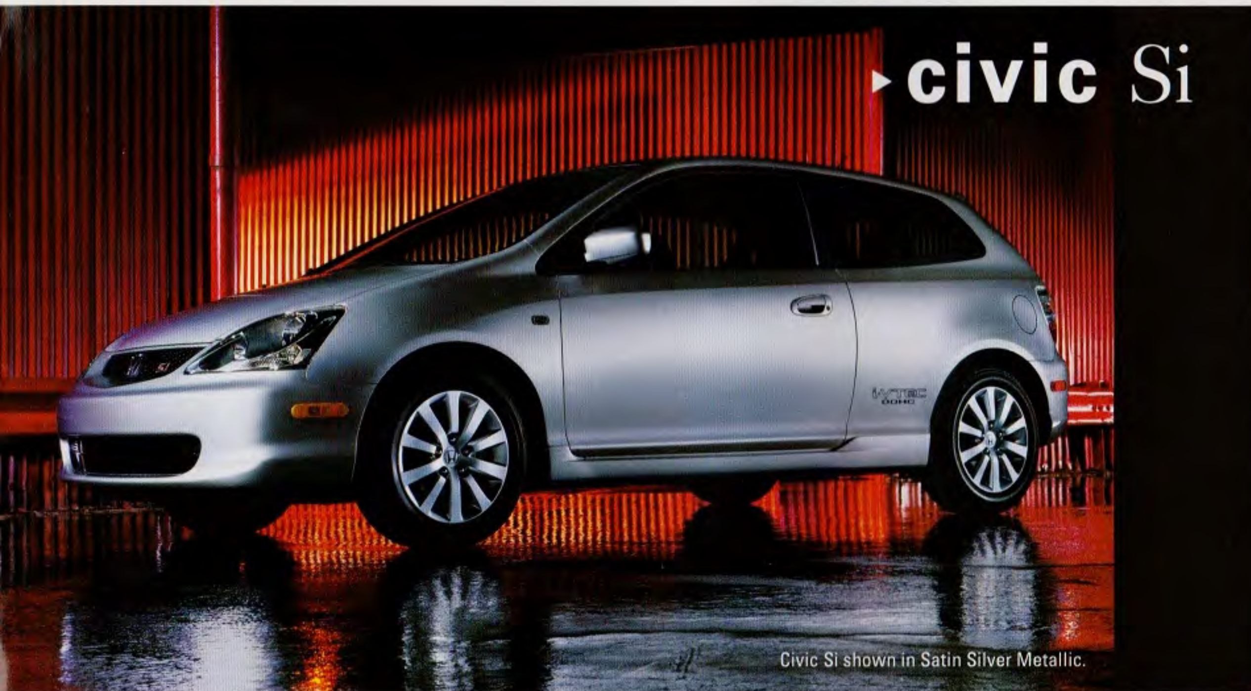
Civic Si shown in Satin Silver Metallic.