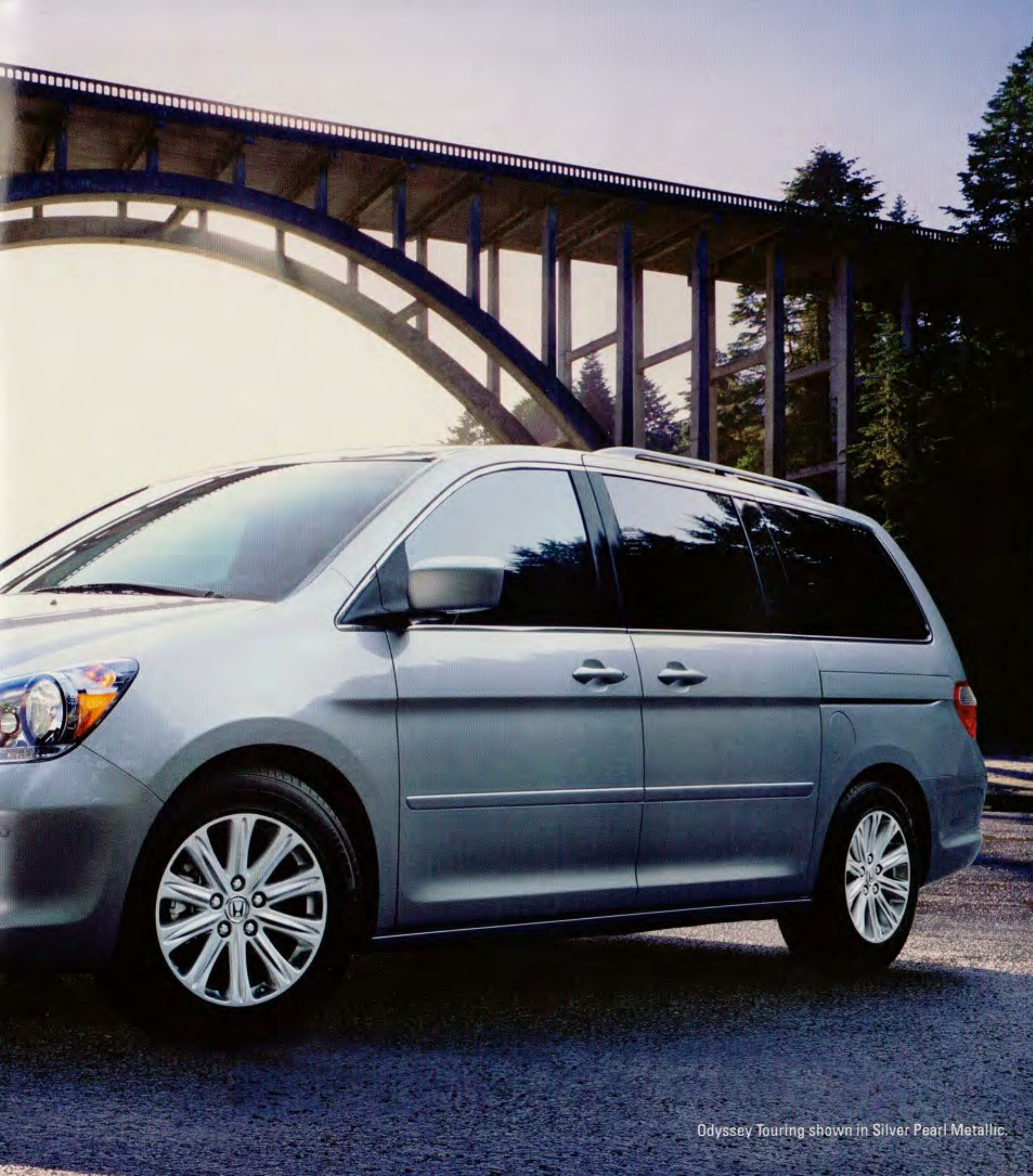
Odyssey Touring shown in Silver Pearl Metallic.