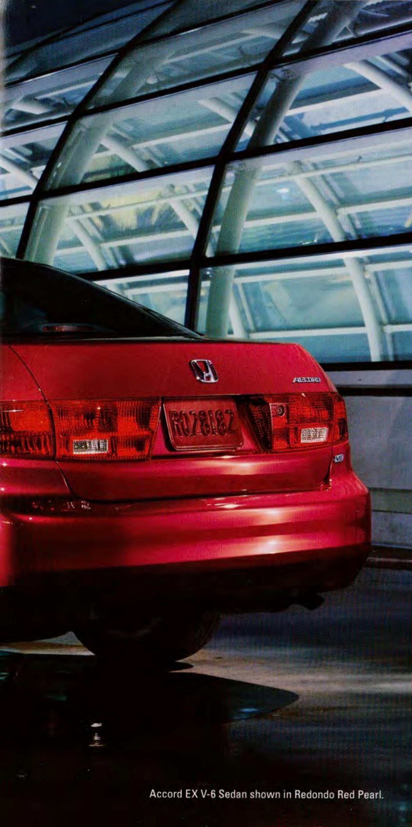
Accord EX V-6 Sedan shown in Redondo Red Pearl.

On top of their supple luxury and comfort, leather-trimmed Accord EX models let you enjoy more than 120 channels of digital-quality sound via XM® Satellite Radio. 3 For 2005, most Accord models feature steering wheel-mounted controls that are now illuminated for ease of use at night.