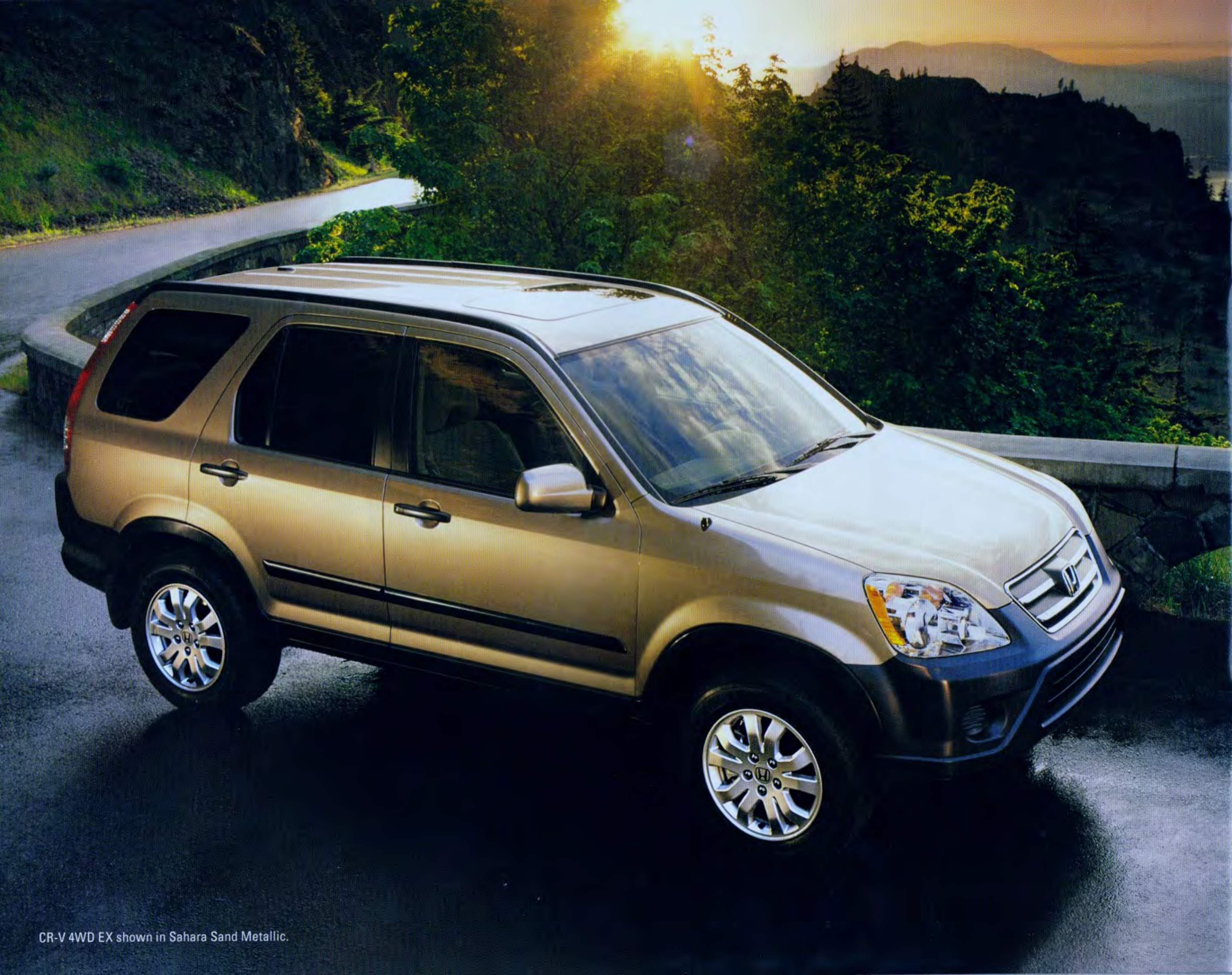
CR-V 4WD EX shown in Sahara Sand Metallic.