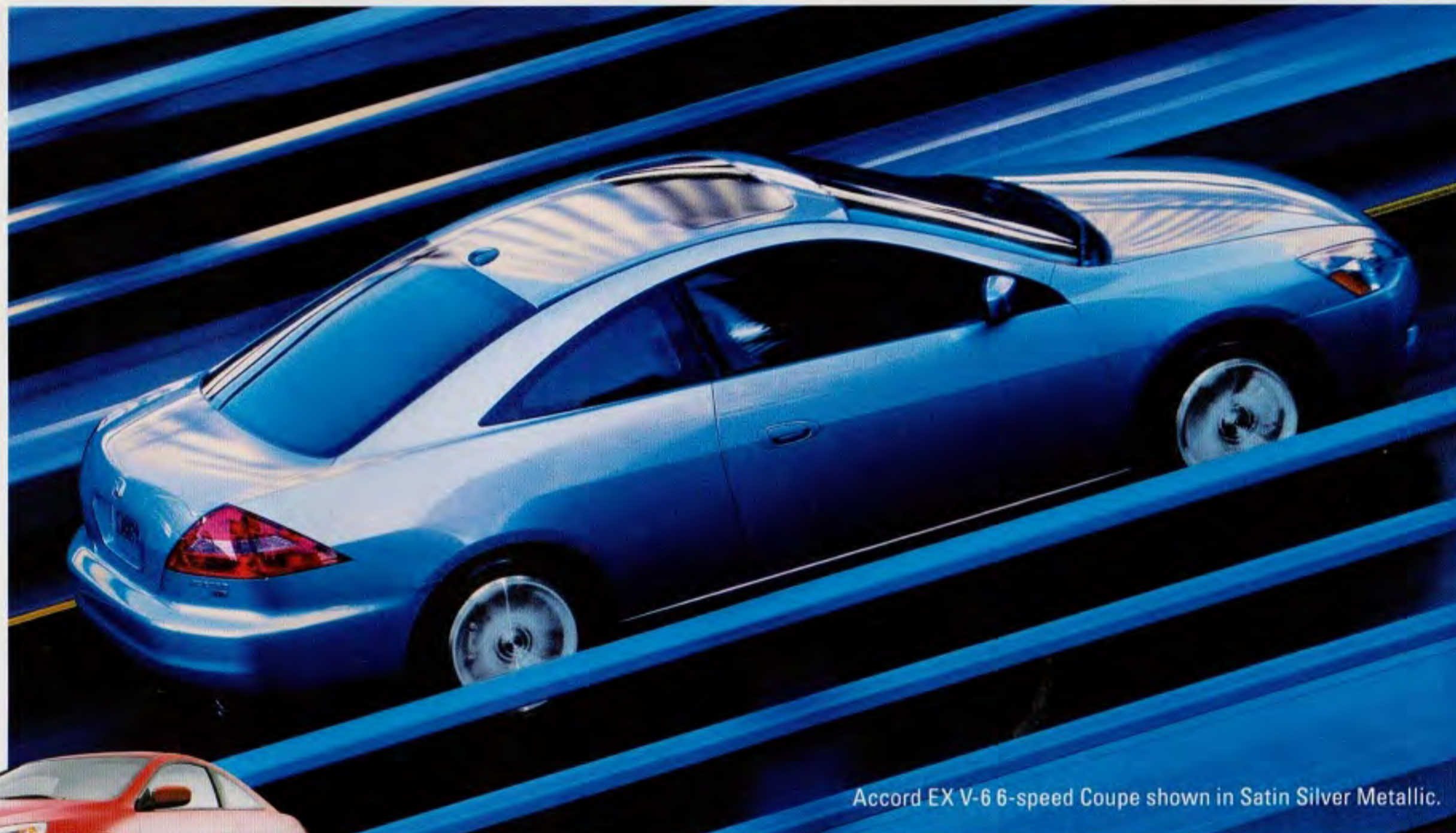
Accord EX V-6 6-speed Coupe shown in Satin Silver Metallic.

5-Speed Manual Transmission (City/Highway): 26/34 5-Speed Automatic Transmission (City/Highway): 24/34 (LX, EX) 5-Speed Automatic Transmission (City/Highway): 21/30 (LX V-6, EX V-6) 6-Speed Manual Transmission (City/Highway): 20/30 Fuel (gal.): 17.1