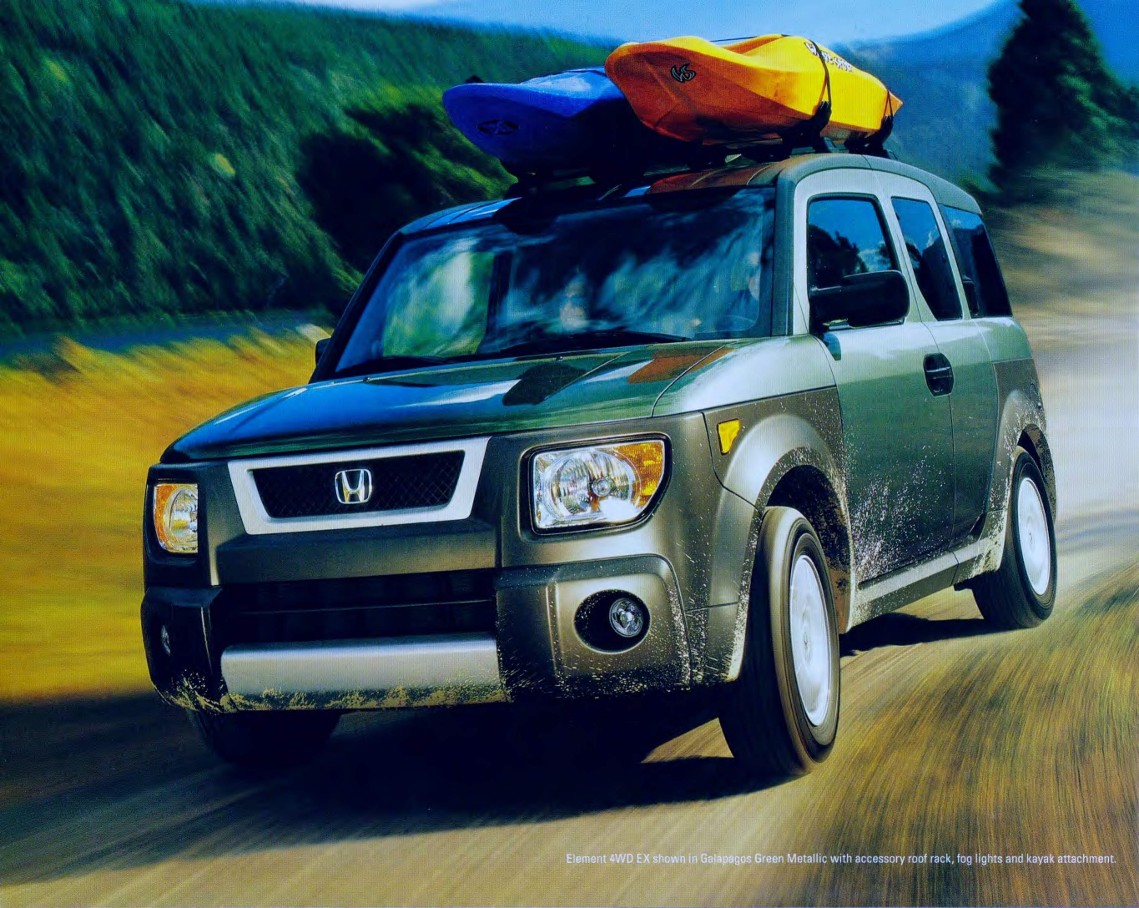
Element 4WD EX shown in Galapagos Green Metallic with accessory roof rack, fog lights and kayak attachment.