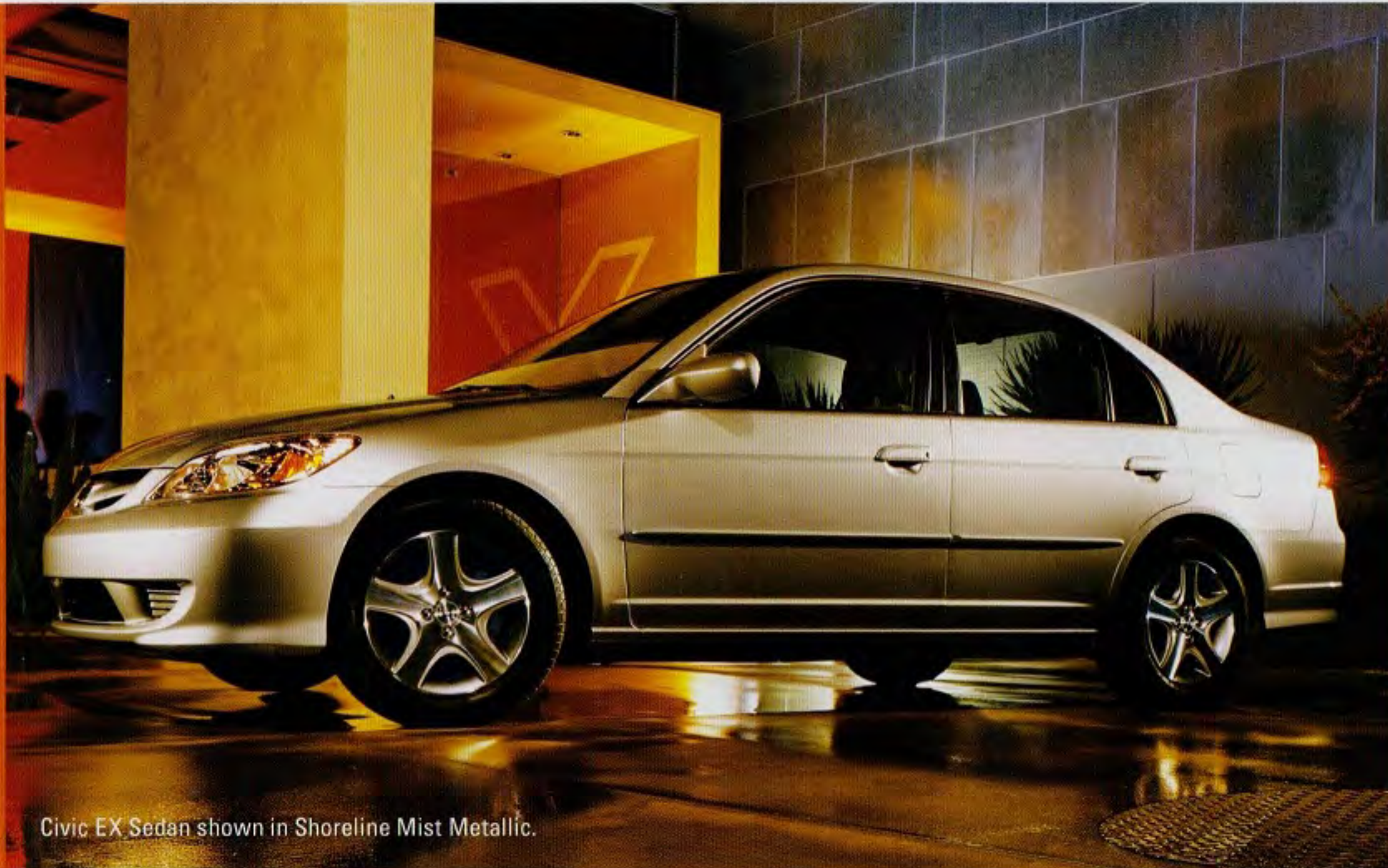
Civic EX Sedan shown in Shoreline Mist Metallic.

Spend just a moment behind the wheel of a Civic Sedan, and you'll understand just what the science of ergonomics is all about. All the controls feel like they were tailored to you, and they operate with an uncanny precision. And everything's right where it should be, so you can enjoy the Civic's fun-to-drive nature in no time.