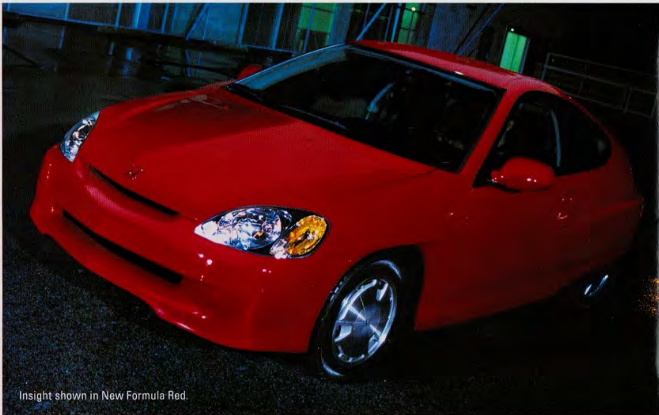
Insight shown in New Formula Red.

5-Speed Manual Transmission (City/Highway): 61/66 Continuously Variable Transmission (City/Highway): 57/56 Fuel (gal.): 10.6