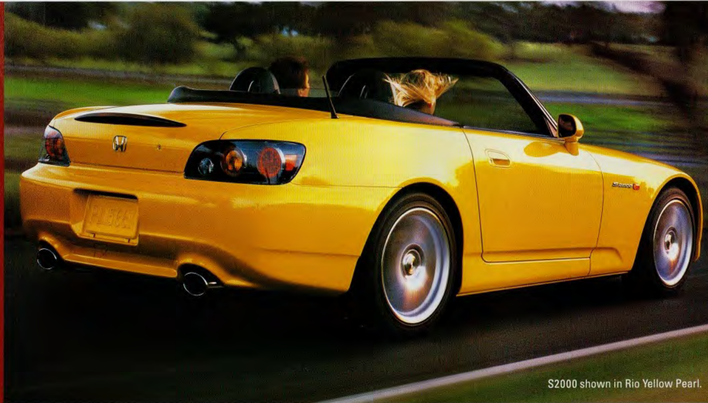
S2000 shown in Rio Yellow Pearl.

The S2000's torque-rich VTEC engine is mated to a sweet-shifting 6-speed manual transmission Car and Driver called "The Best Mass-Produced Gearbox on the Planet." 9